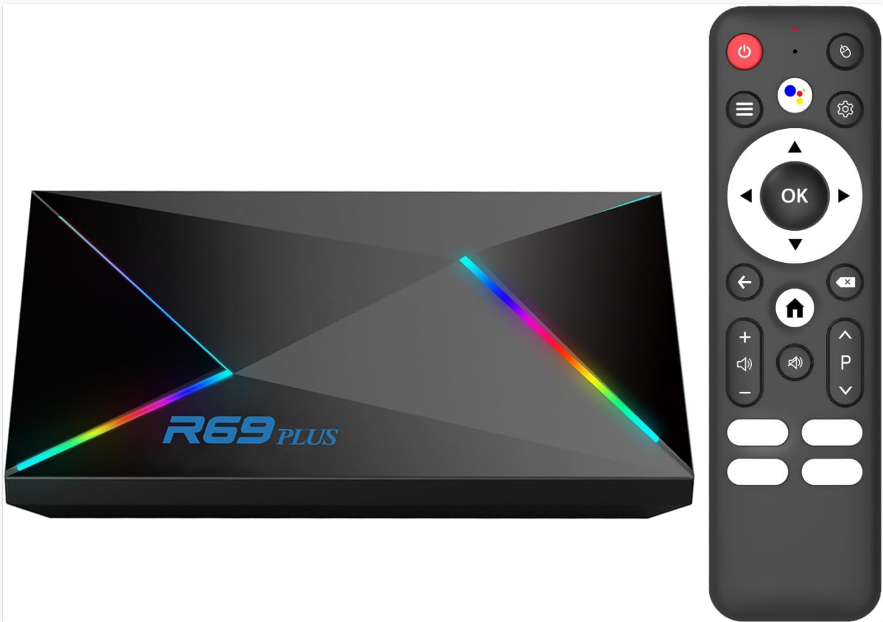
Figure 3.1: Upvivi R69PLUS 2025 Android TV Box and its accompanying remote control. The TV box features a sleek black design with colorful LED accents.