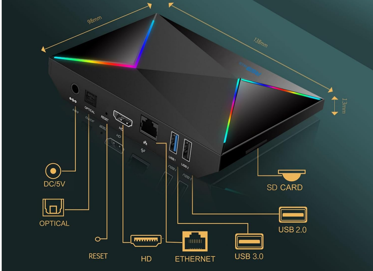
Figure 3.2: Detailed view of the Upvivi R69PLUS 2025 Android TV Box interfaces and dimensions. Ports include DC/5V power input, Optical audio output, Reset button, HD (HDMI) output, Ethernet port, USB 3.0, USB 2.0, and an SD Card slot. Dimensions are approximately 136mm x 98mm x 13mm.

Various interfaces such as HD, LAN, USB, etc. To meet your different needs at the same time.