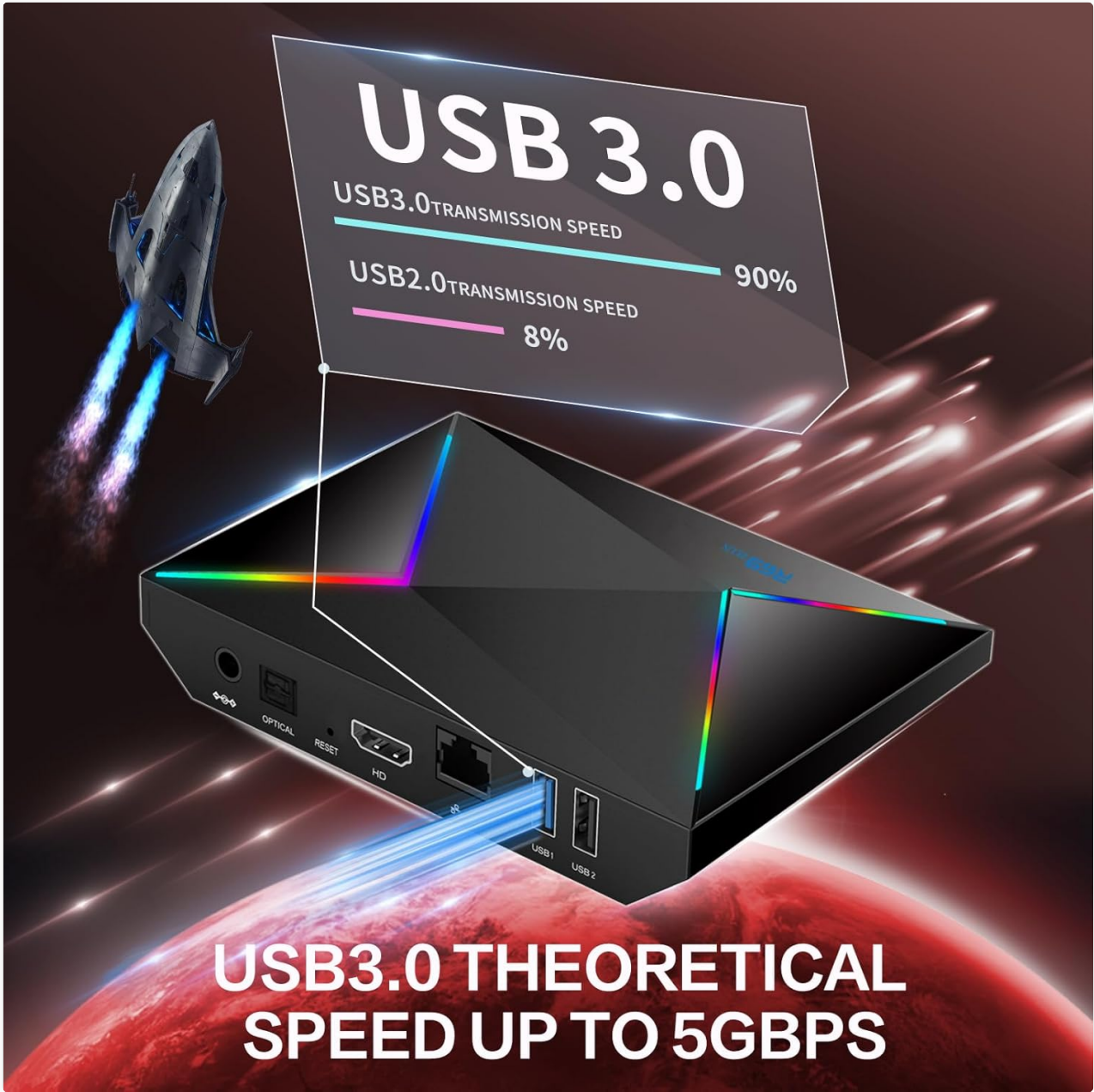
Figure 3.8: The USB 3.0 port offers significantly faster data transmission speeds (up to 5Gbps theoretical) compared to USB 2.0, ideal for connecting external storage devices.