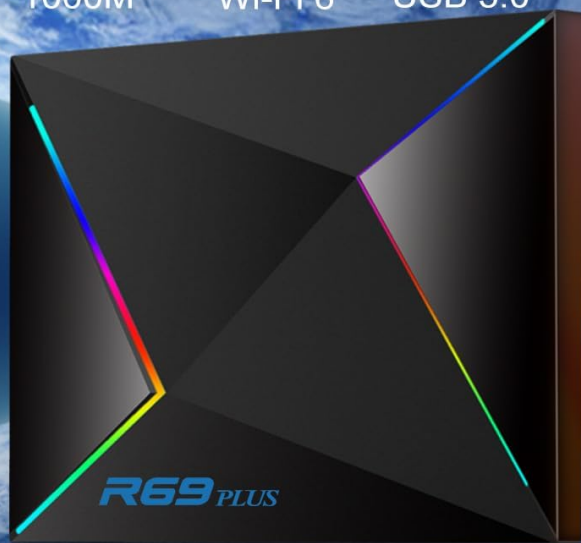
Figure 3.3: Overview of key features including H728 CPU, Octa-core architecture, Android 14 OS, 1000M Ethernet, Wi-Fi 6, and USB 3.0 connectivity.