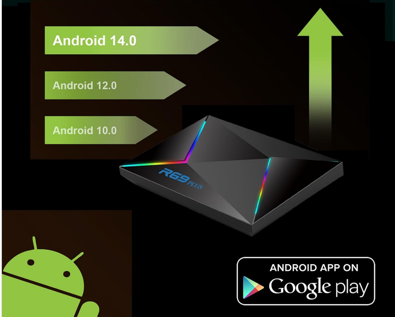
Figure 3.9: The device runs on Android 14.0 OS, providing a higher version, smoother performance, and enhanced compatibility with modern applications compared to previous Android versions.

The 64-bit Android system is compatible with more high-performance apps