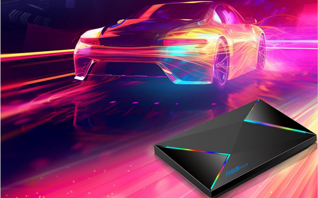
Figure 3.6: The device supports WiFi6 (802.11ax) for next-generation wireless connectivity, offering faster speeds, lower latency, and a more secure network compared to WiFi 5.