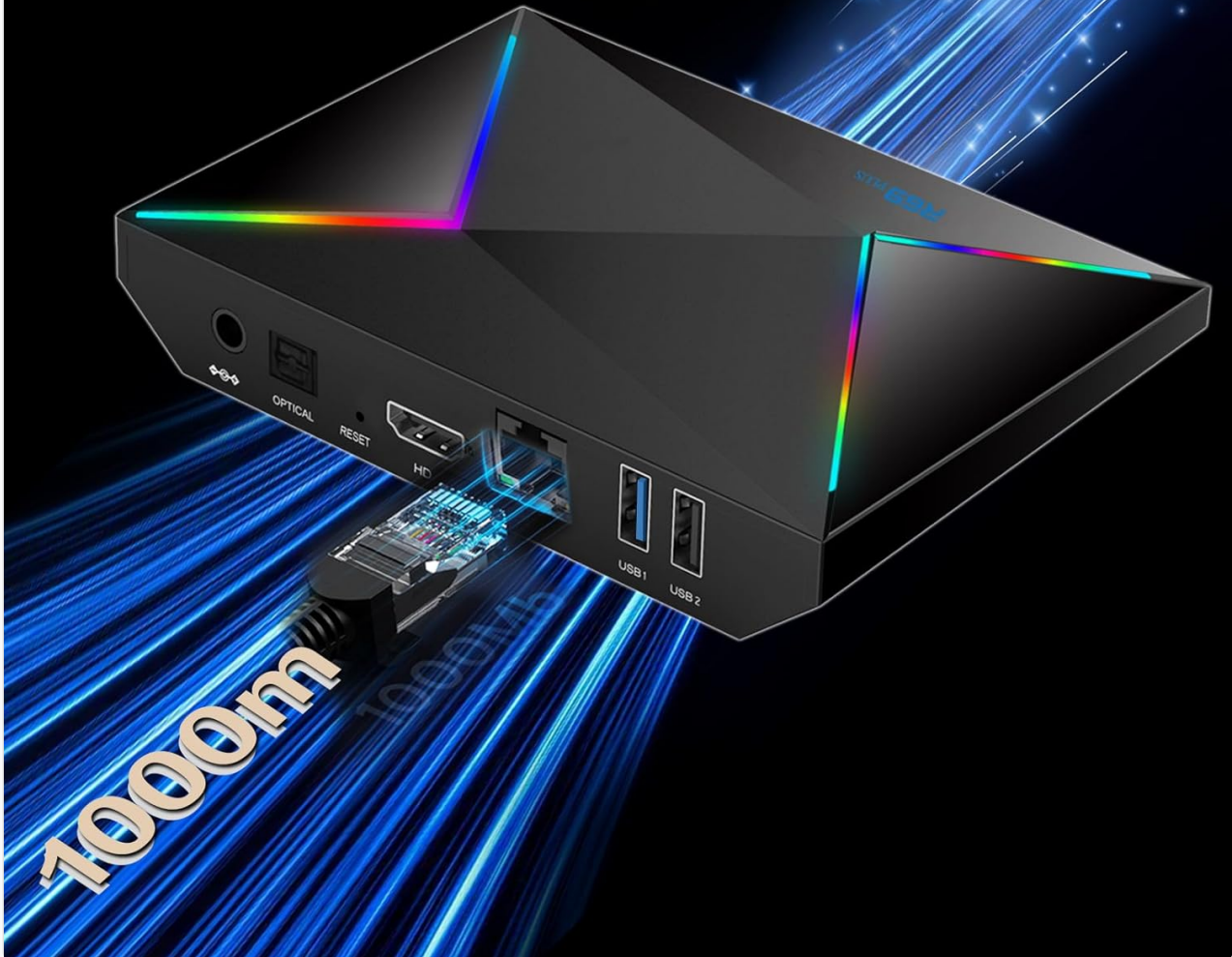
Figure 3.5: The Gigabit Ethernet port provides a 1000M connection for fast and stable wired internet access, minimizing latency.

Gigabit Ethernet port for ultimate network speed; features low latency and high speeds.