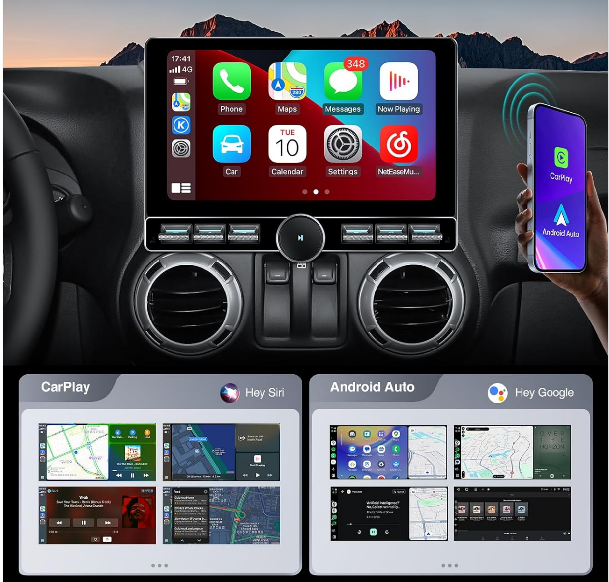
Image: The car stereo display highlighting the customizable knob and keybutton design for easy control.

Your browser does not support the video tag.