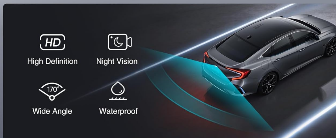
Image: The car stereo display showing the view from the 1080P AHD Backup Camera with parking guidelines.