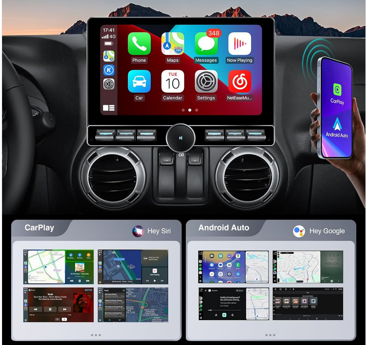
Image: The car stereo display showing the Wireless CarPlay and Android Auto interface, with various app icons for phone, music, maps, and messages.

Your browser does not support the video tag.