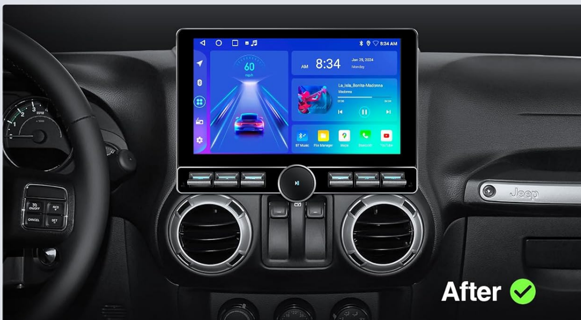
Image: A side-by-side comparison showing the original Jeep Wrangler dashboard with the factory radio (Before) and the same dashboard with the new AINAVITO 10-inch QLED Touch Screen Car Stereo installed (After).