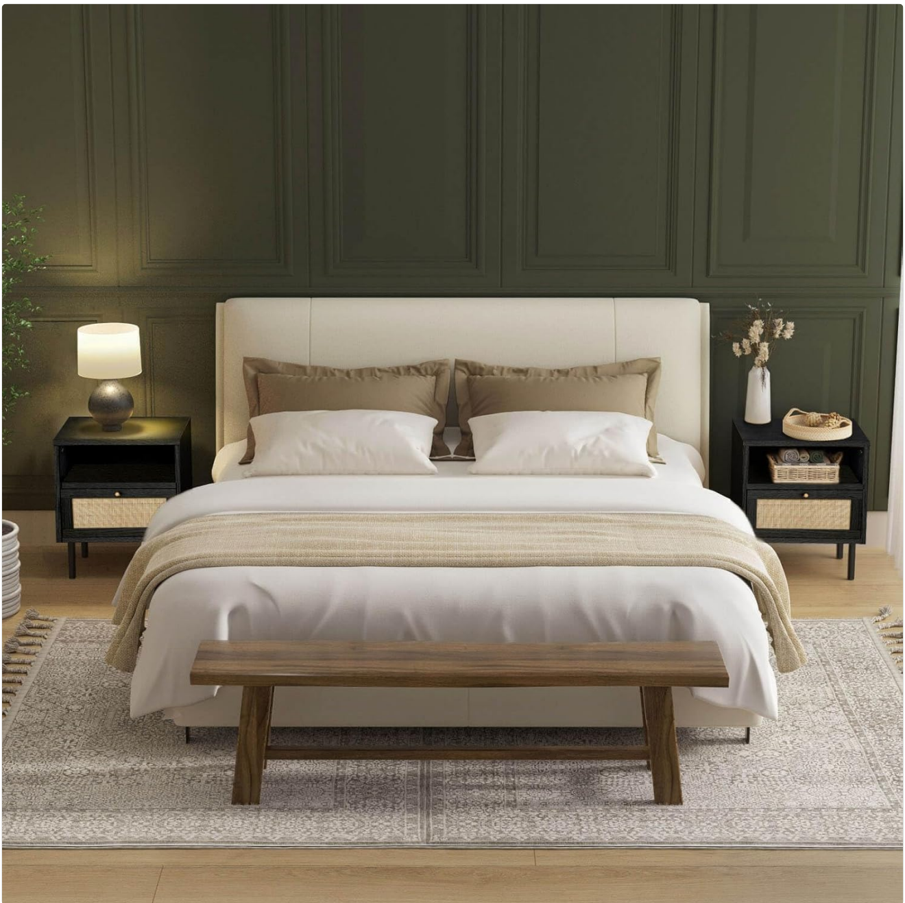
Image 1.2: Two nightstands positioned on either side of a bed, demonstrating their use in a bedroom environment.