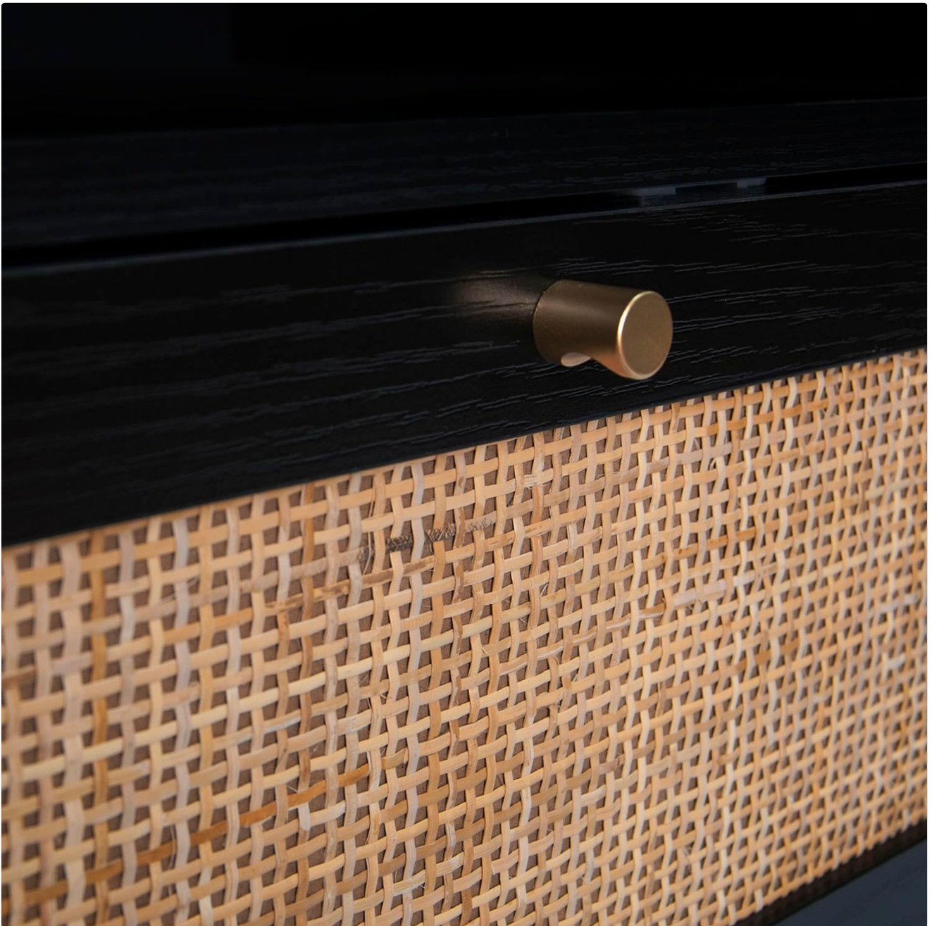
Image 4.2: Detailed view of the rattan door texture and the golden handle.