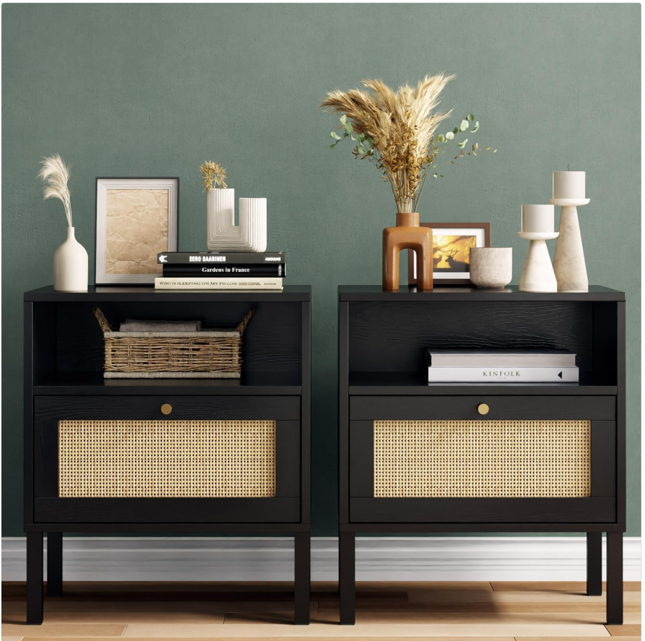
Image 1.1: Front view of the Angel Sar Rattan Night Stand in black, showcasing the open shelf and the rattan-fronted cabinet door.