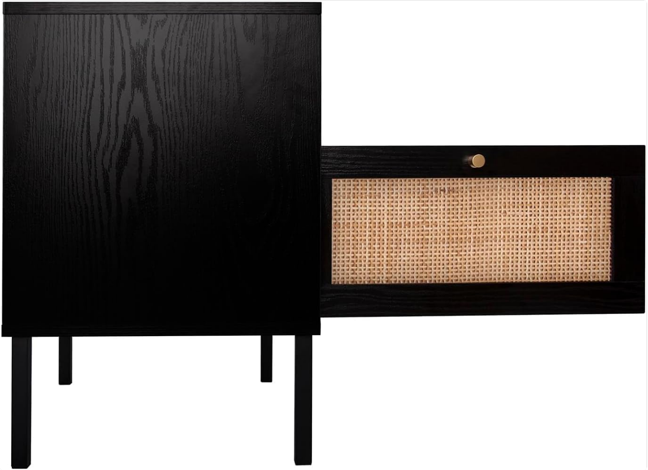
Image 4.1: The nightstand with its rattan door open, showing the internal storage compartment.