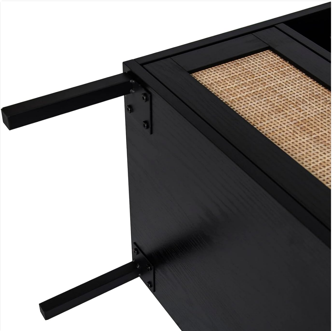
Image 3.1: View of the nightstand's underside, illustrating the attachment points for the metal legs.