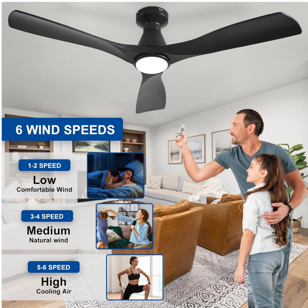
Figure 5: Six adjustable wind speeds.