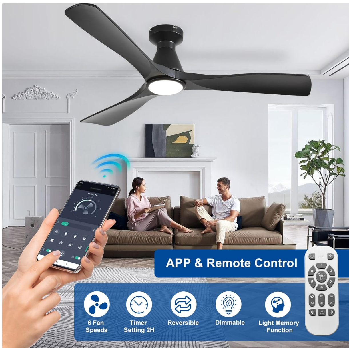
Figure 3: Remote and App control features.

Video 3: Demonstration of Depuley Smart Ceiling Fan with Light and Remote APP Control.