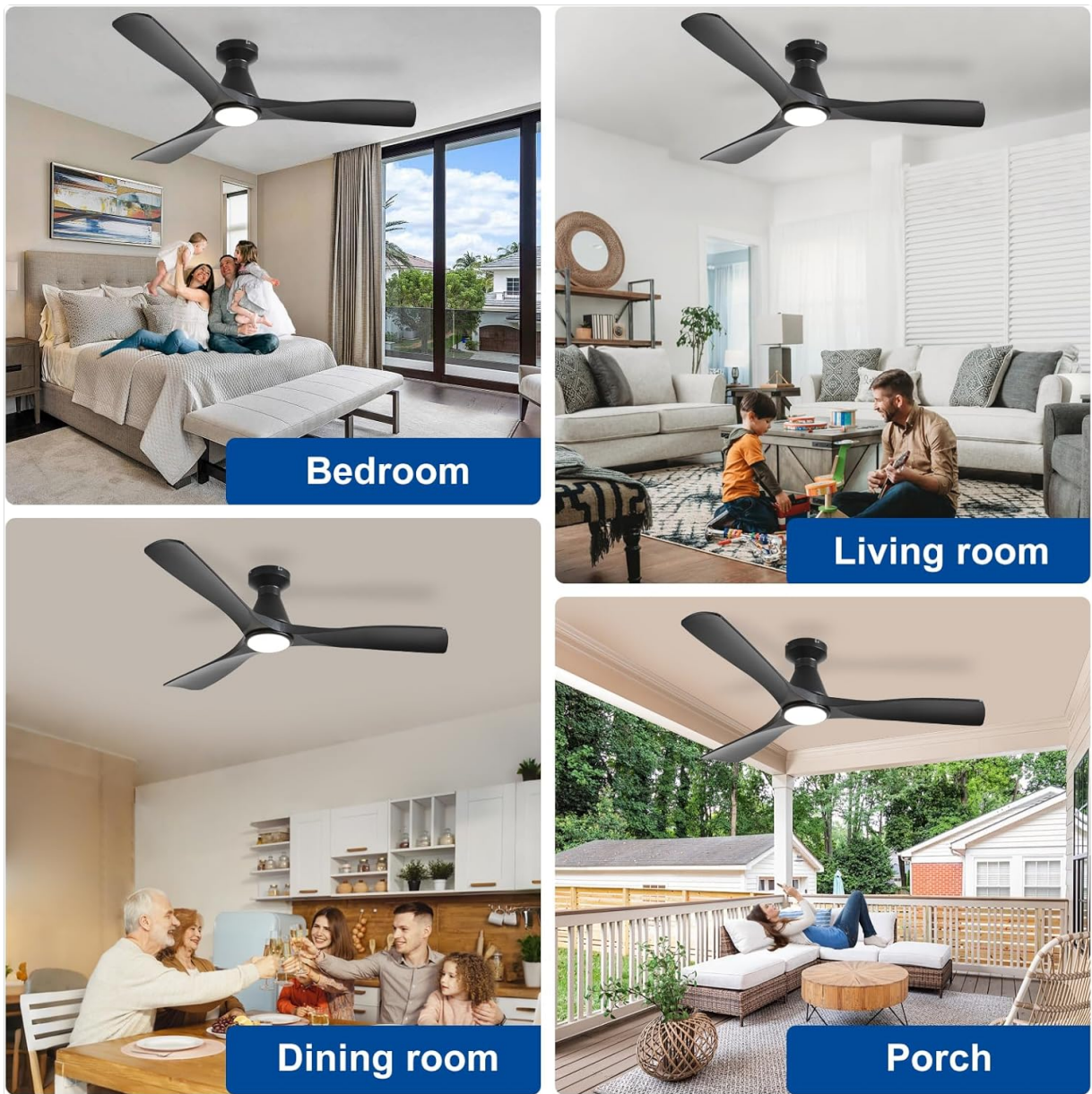
Figure 1: Depuley 52-inch ceiling fan in various indoor and outdoor settings.