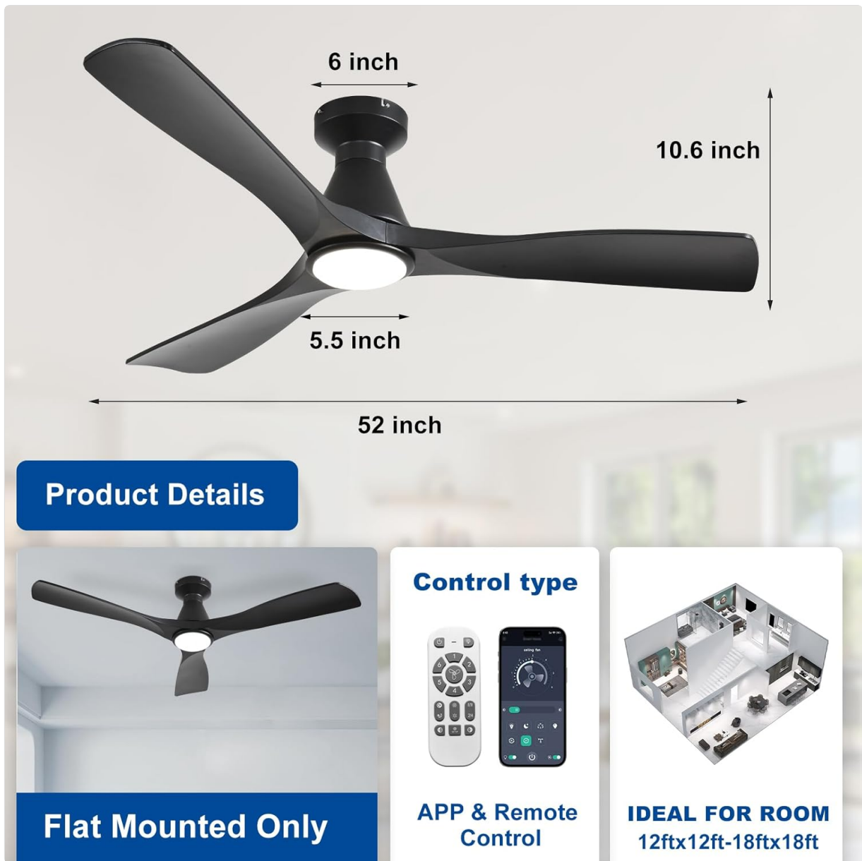
Figure 7: Product dimensions and control types.