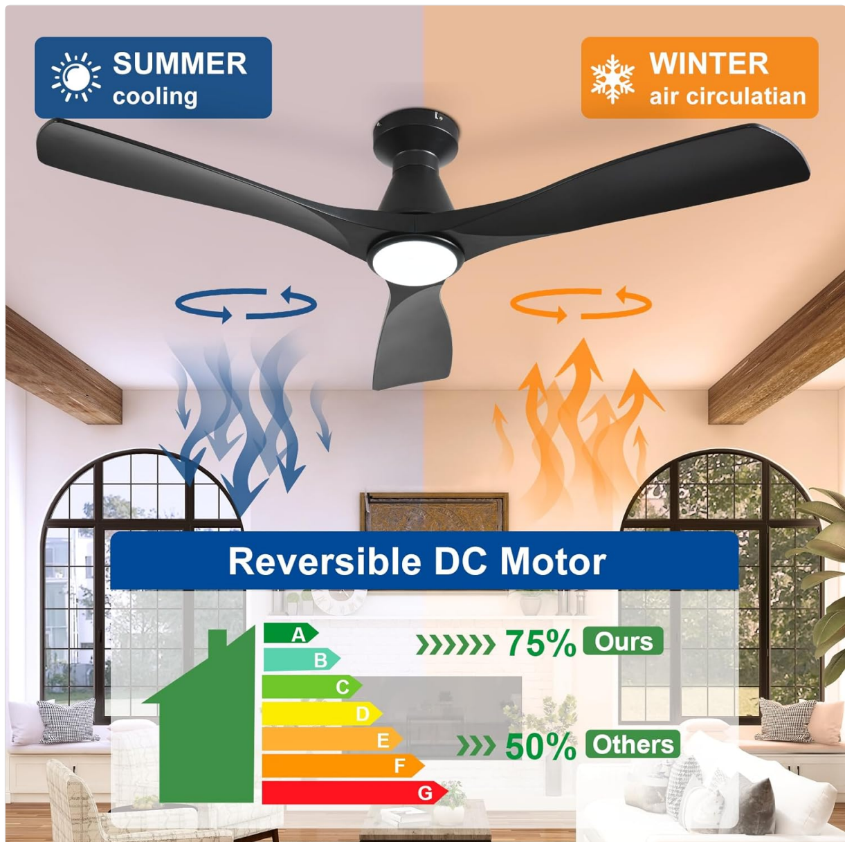
Figure 4: Reversible DC motor for year-round comfort.