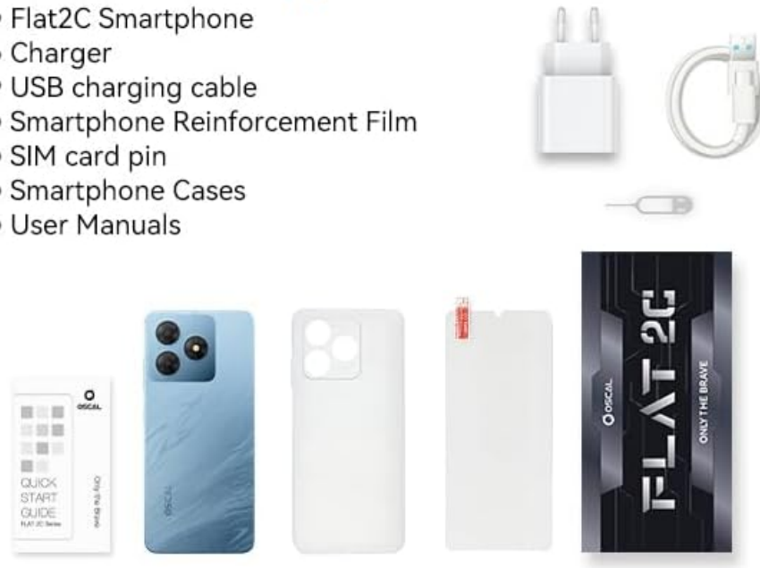
Figure 2.1: Included accessories with the OSCAL FLAT 2C Mobile Phone.

If any items are missing or damaged, please contact customer support immediately.