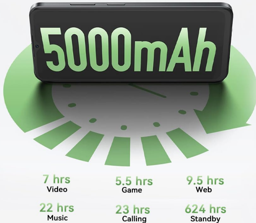
Figure 3.5: Battery capacity and estimated usage times.

Fuel your day with the FLAT 2C's 5000mAh battery, giving you the freedom to stay connected and productive from morning to midnight. Wave goodbye to battery worries and hello to endless possibilities.