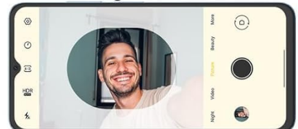
Figure 3.3: Camera specifications and available shooting modes.