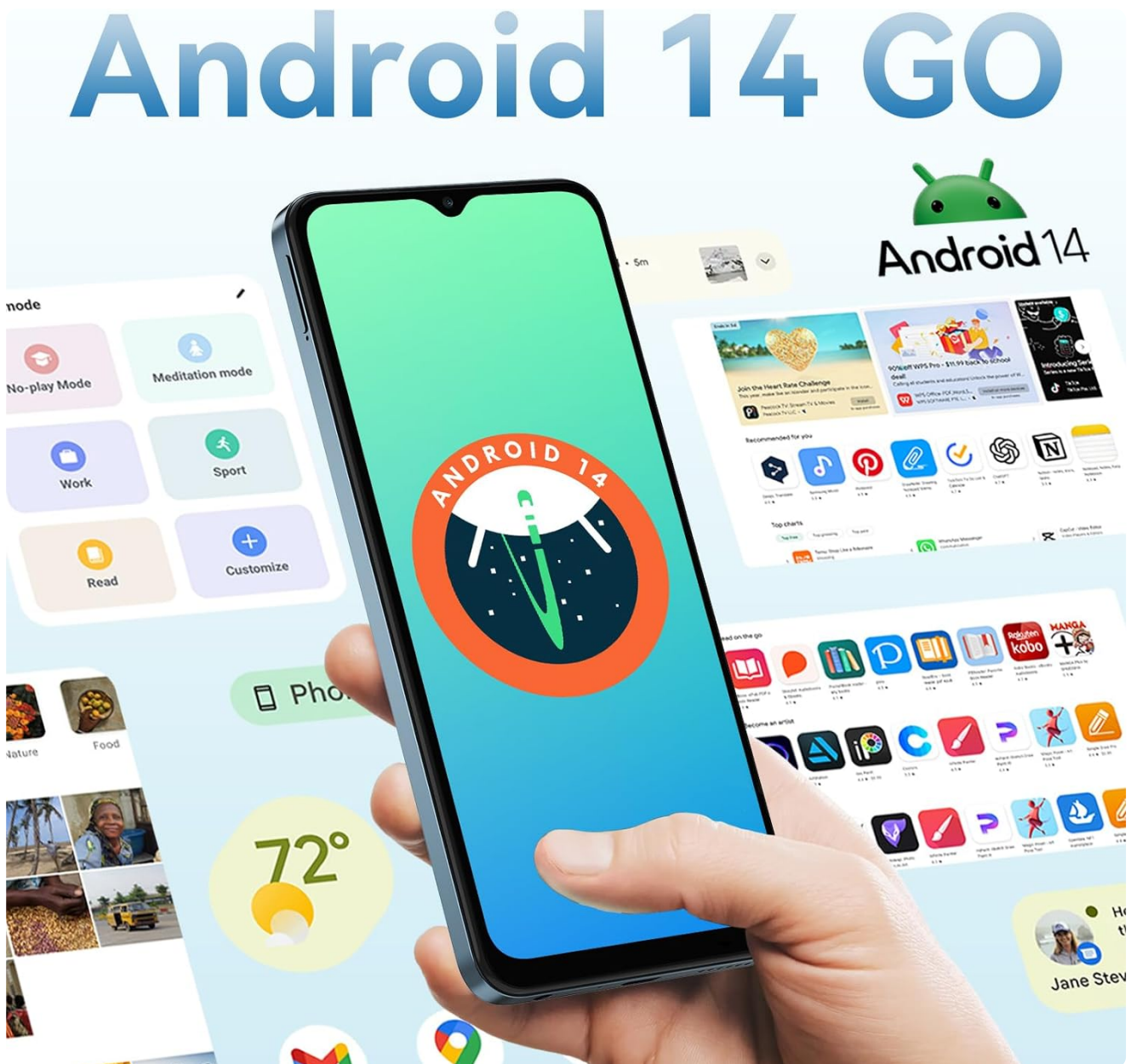
Figure 5.1: Overview of Android 14 Go features.

The OSCAL FLAT 2C runs on Android 14 Go, optimized for smooth operation and enhanced privacy. This version offers personalized customization options and a comprehensive Permission Manager to control app access to your data.