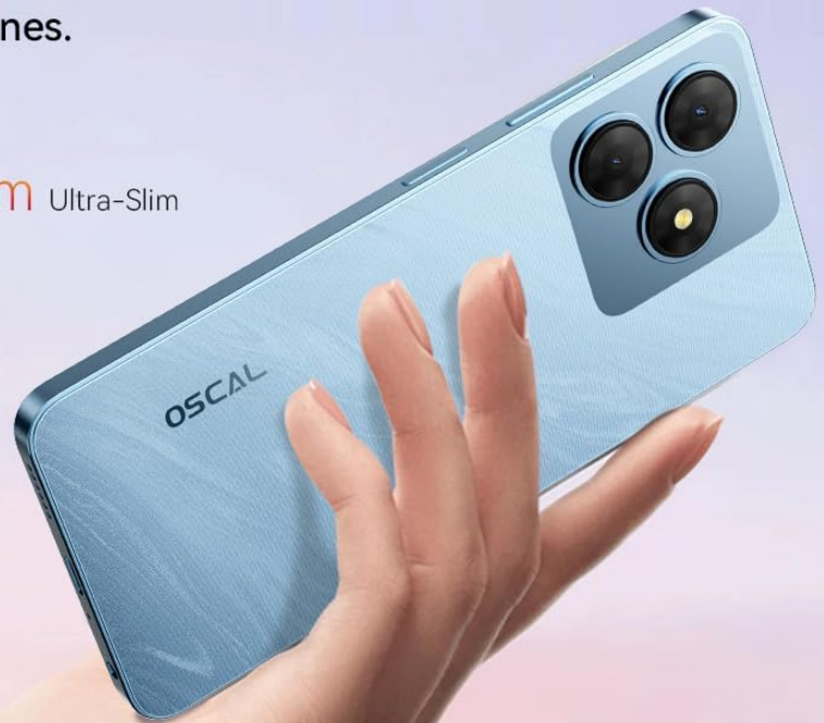
Figure 3.1: The slim and lightweight design of the OSCAL FLAT 2C.

It boasts a 6.56-inch HD+ Ultra-large IPS Display with 16.7 million colors and a 60Hz refresh rate, offering an 89% screen-to-body ratio and 178° IPS Full View for an immersive visual experience.