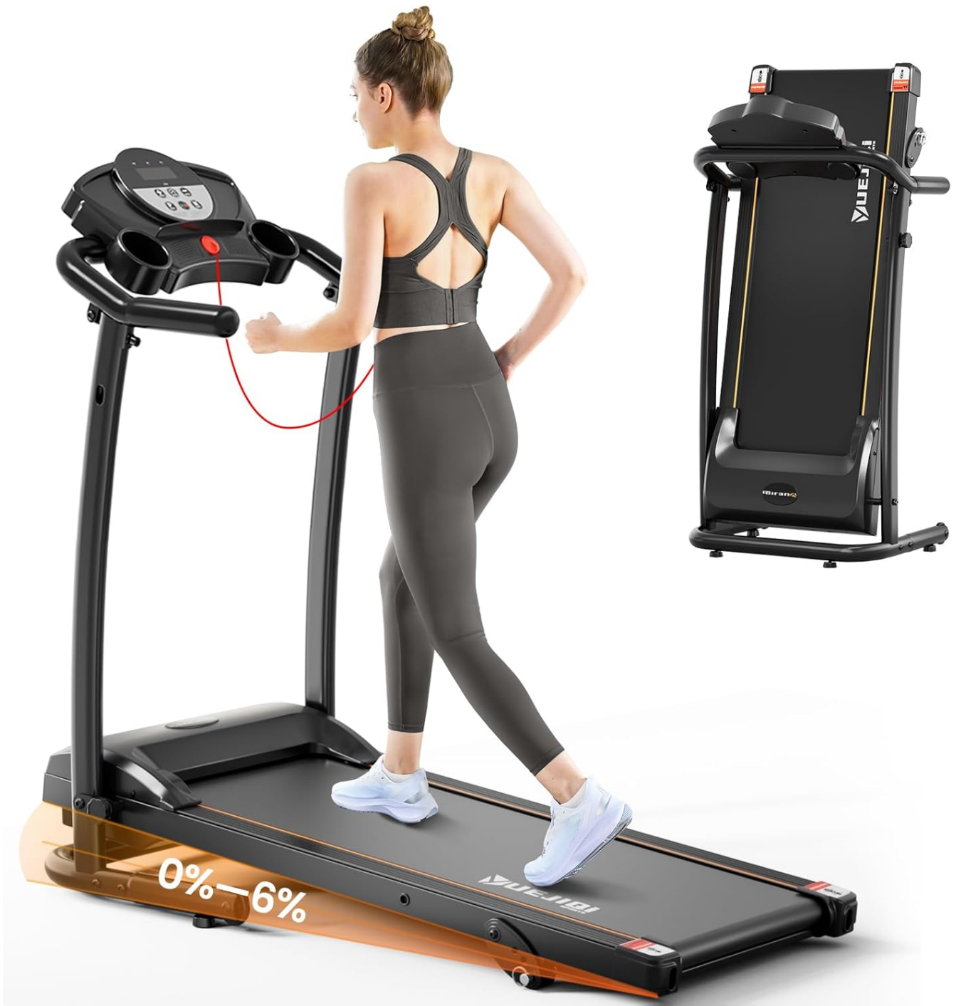
Image: The Yuejiqi G3530 Folding Treadmill shown in both its operational state with a user walking, and its compact folded state for storage.