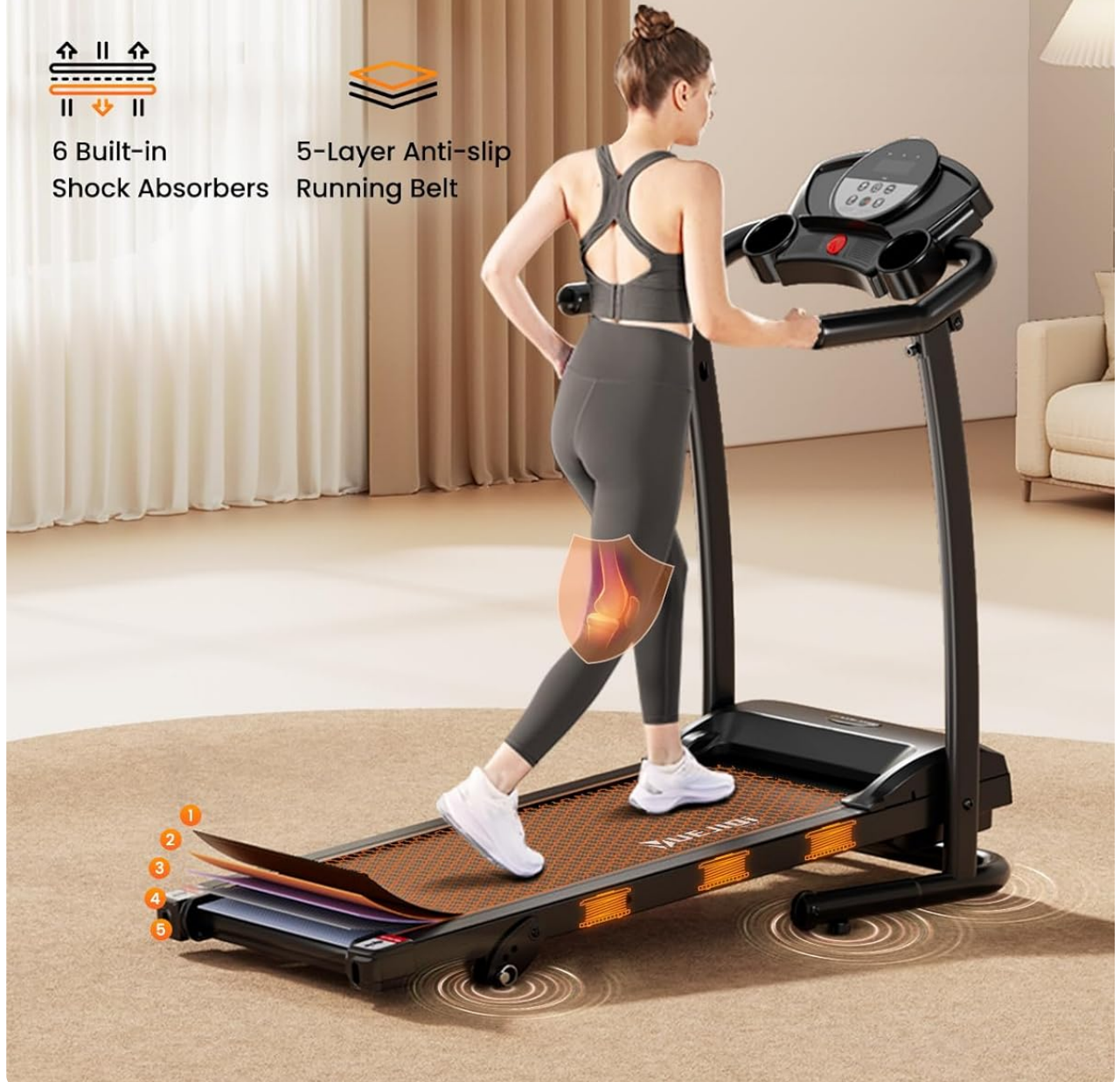
Image: A visual representation of the treadmill's running belt layers and the integrated shock absorption system, designed to reduce impact on knees and joints.