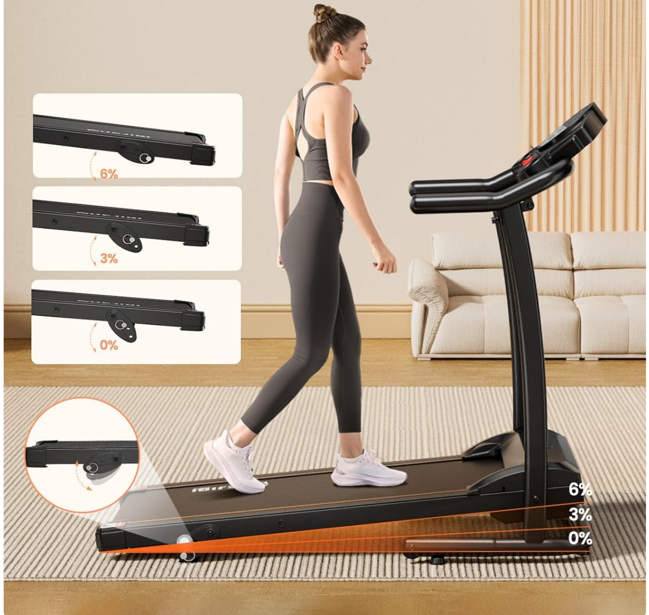
Image: A user on the treadmill, with visual overlays demonstrating the three distinct manual incline levels (0%, 3%, and 6%) available for varied workout intensity.