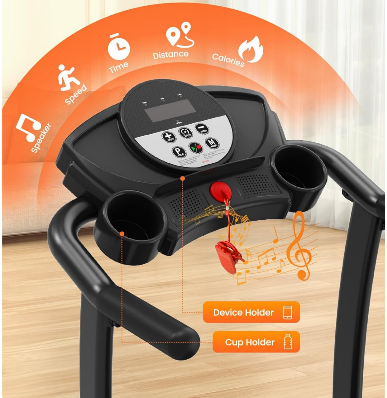
Image: A detailed view of the treadmill's LED display console, showing the screen, control buttons for speed and programs, integrated speakers, device holder, and cup holders.