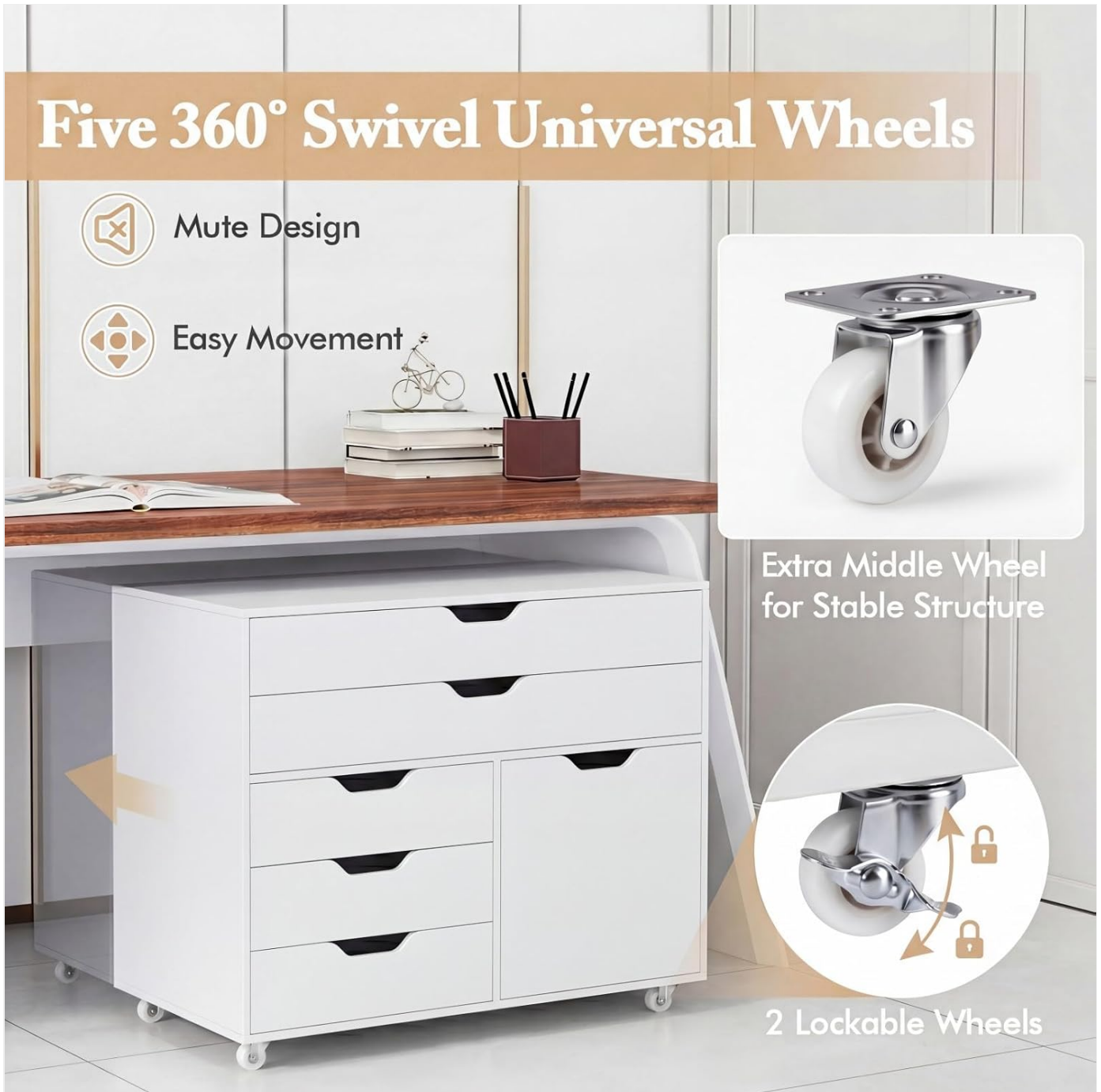
Figure 6: Overview of the cabinet's storage compartments.