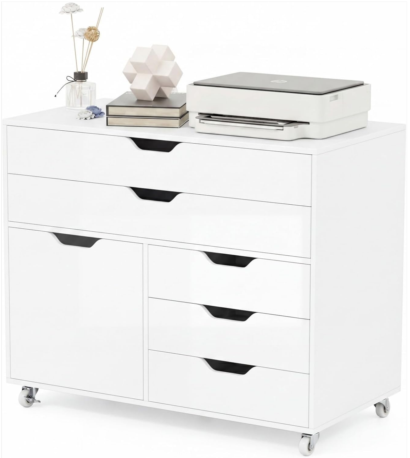
Figure 1: Giantex GT10295-JZWH Rolling Lateral File Cabinet in a home office environment.