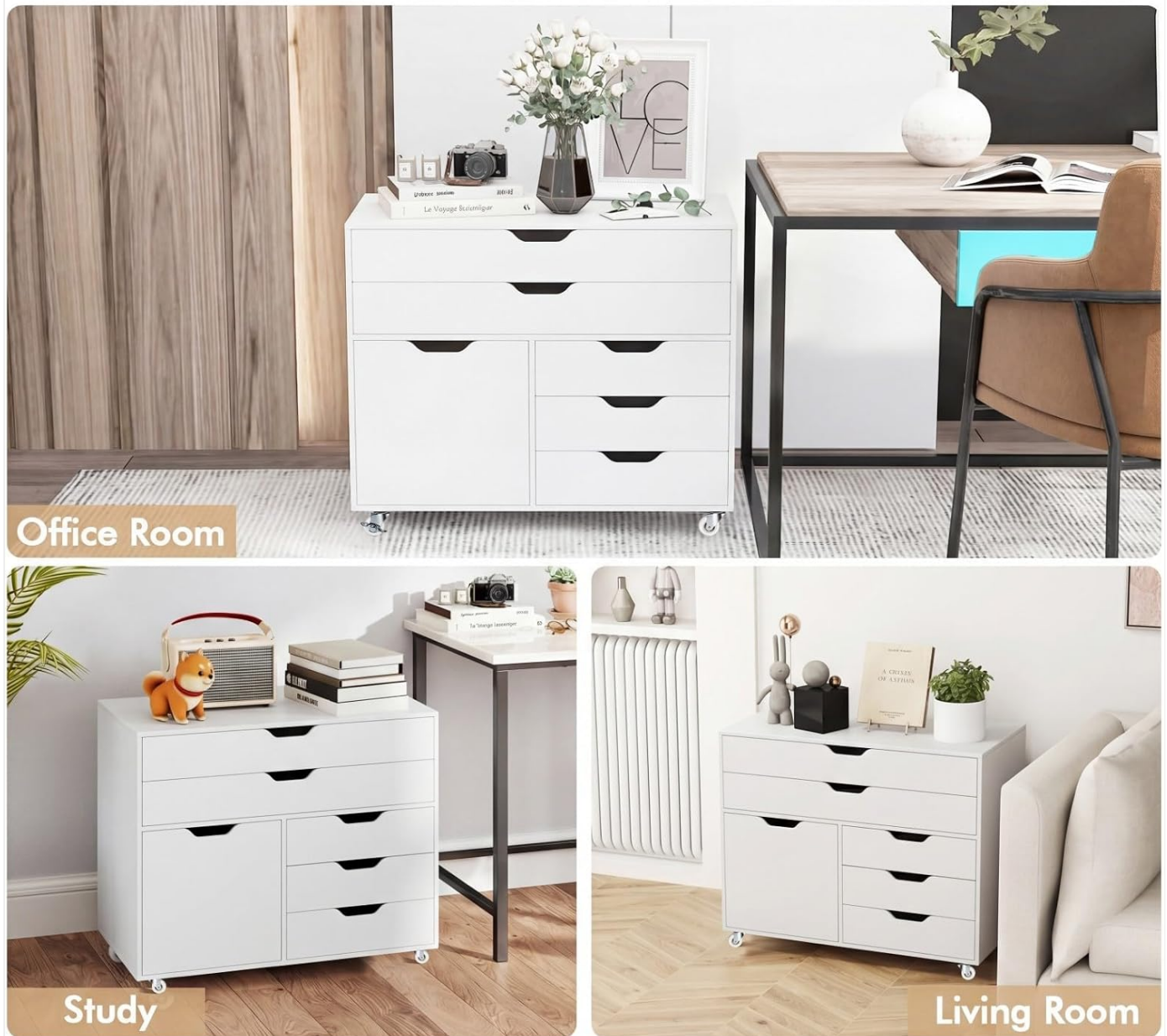
Figure 2: Versatile use of the cabinet in different room settings.