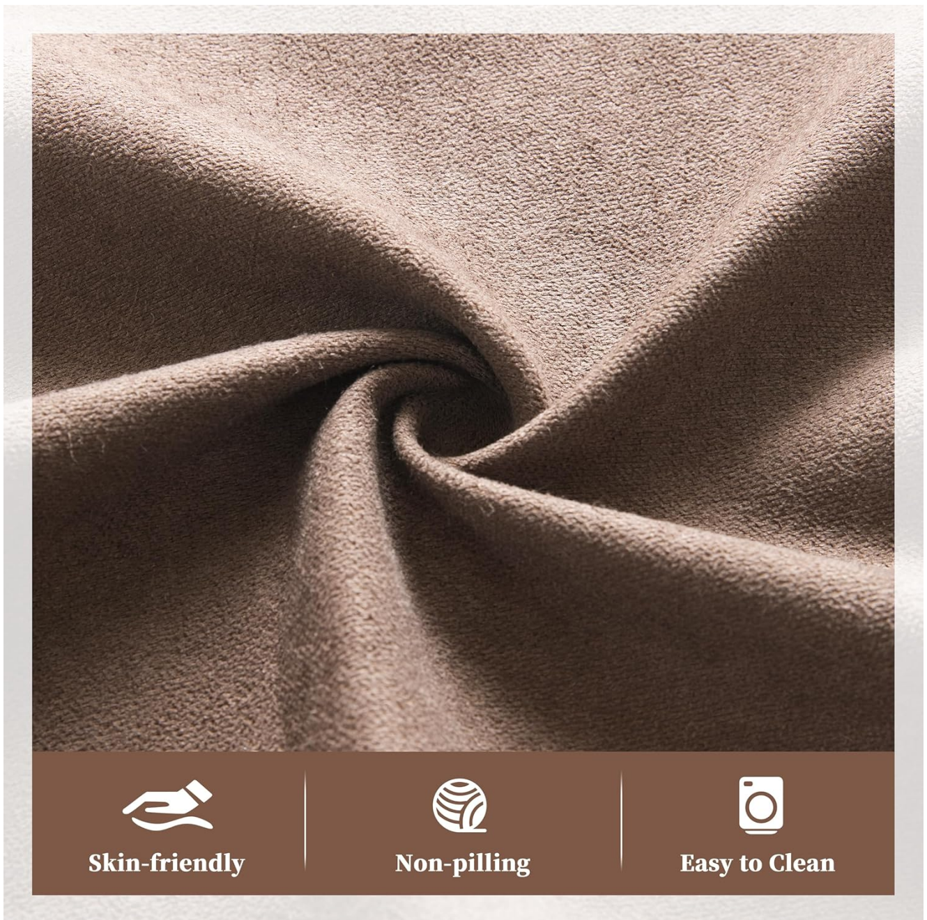
Figure 6.1: Fabric characteristics for easy maintenance.