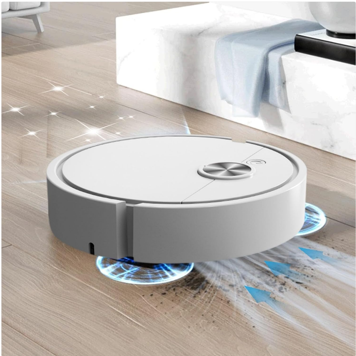
Figure 6.1: The robot vacuum actively cleaning a hard floor surface.