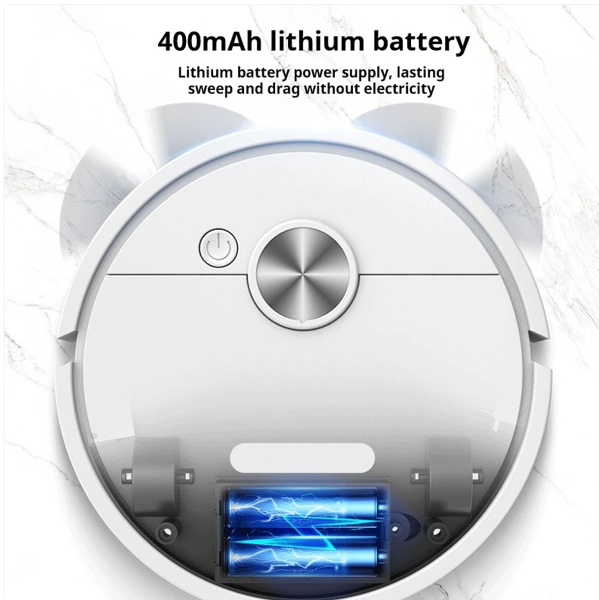
Figure 5.1: Location of the battery compartment and battery specifications.