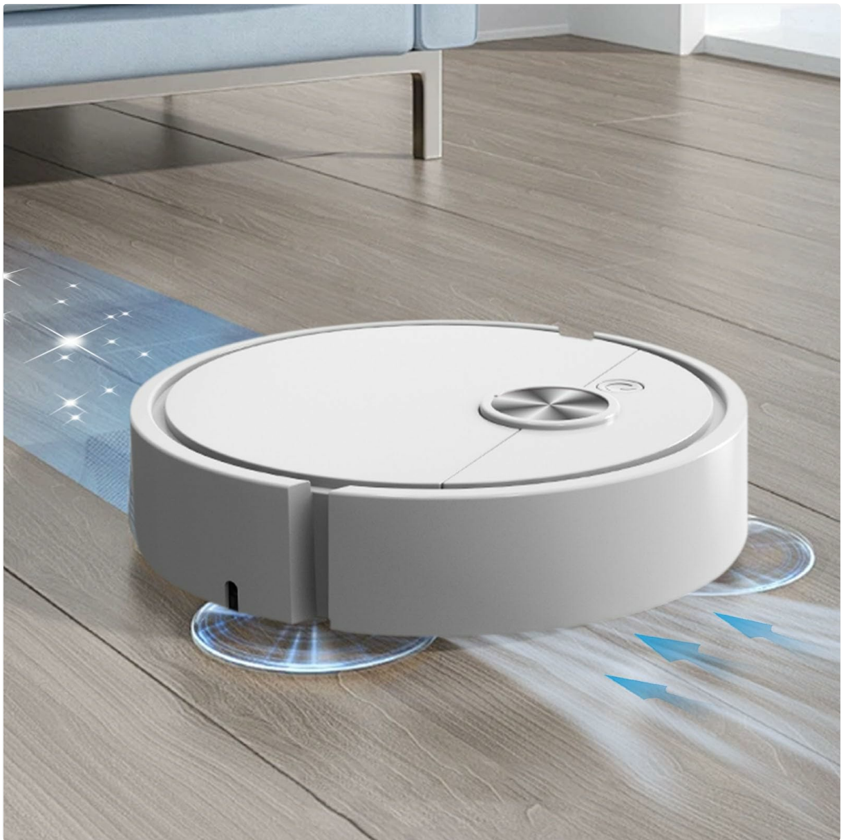
Figure 4.1: Top view of the robot vacuum, highlighting its sleek design and central control button.

The robot is equipped with a 400mAh lithium battery for lasting performance and can be controlled via an app for convenience.