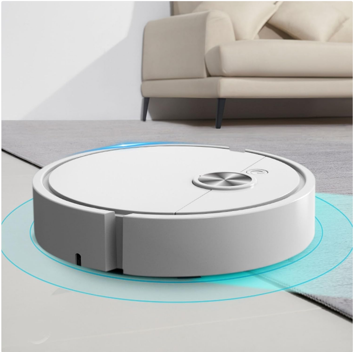
Figure 4.2: The robot vacuum in operation, demonstrating its compact size and cleaning path.