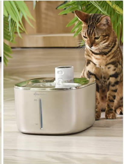
Image: Pets enjoying the wireless water fountain in different indoor settings, highlighting its portability.