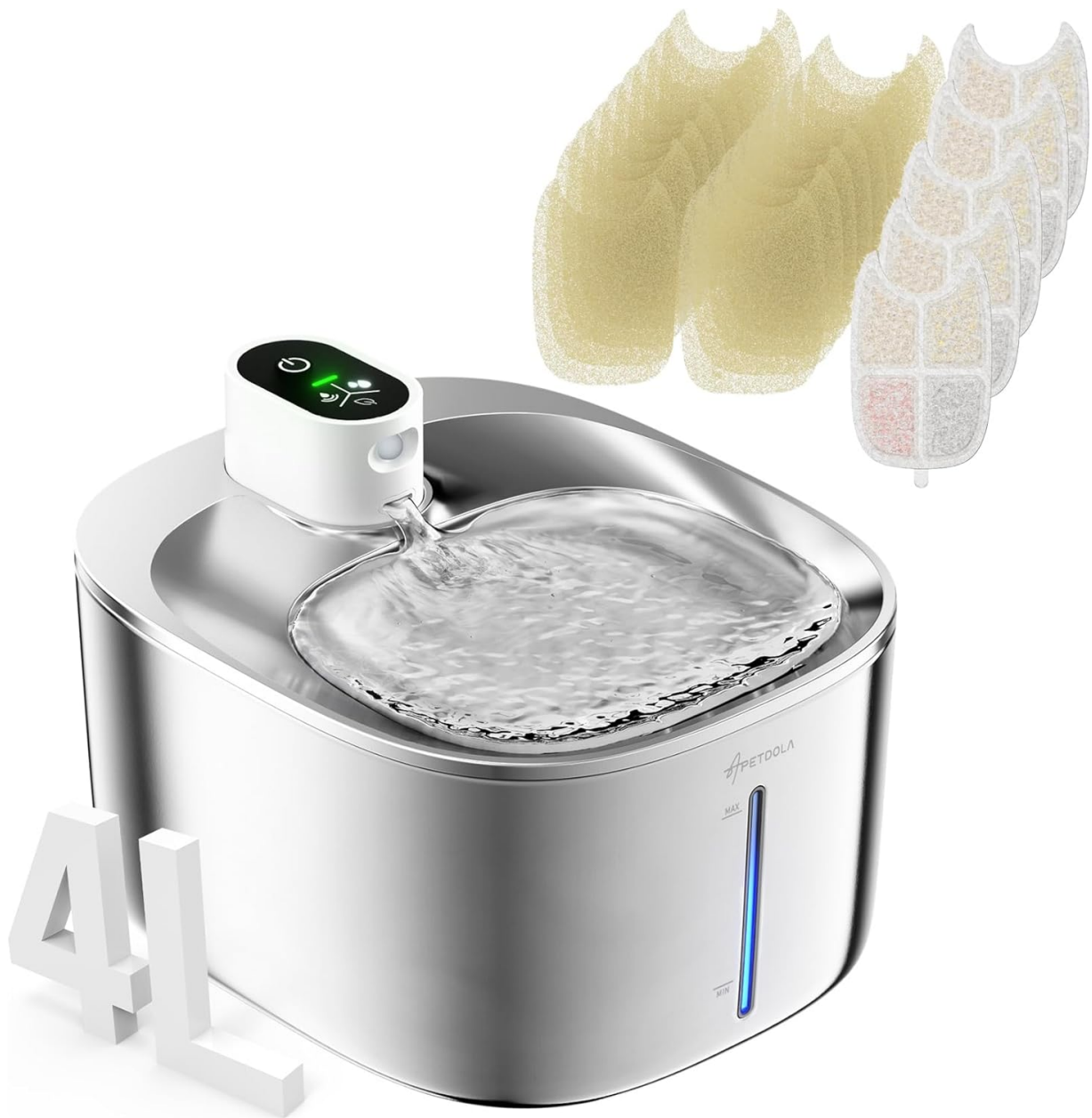
Image: The APD APETDOLA FS10pro-5 Wireless Stainless Steel Pet Water Fountain, showcasing its sleek design and included filters.