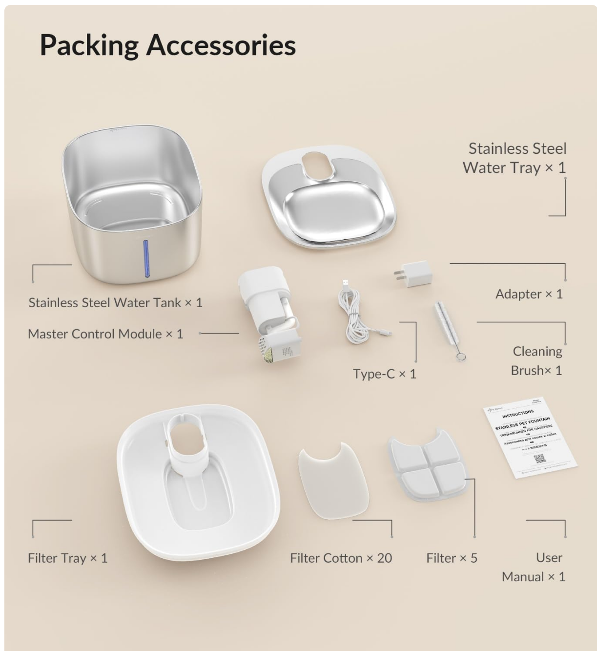
Image: All components included in the product packaging, laid out for clear identification.