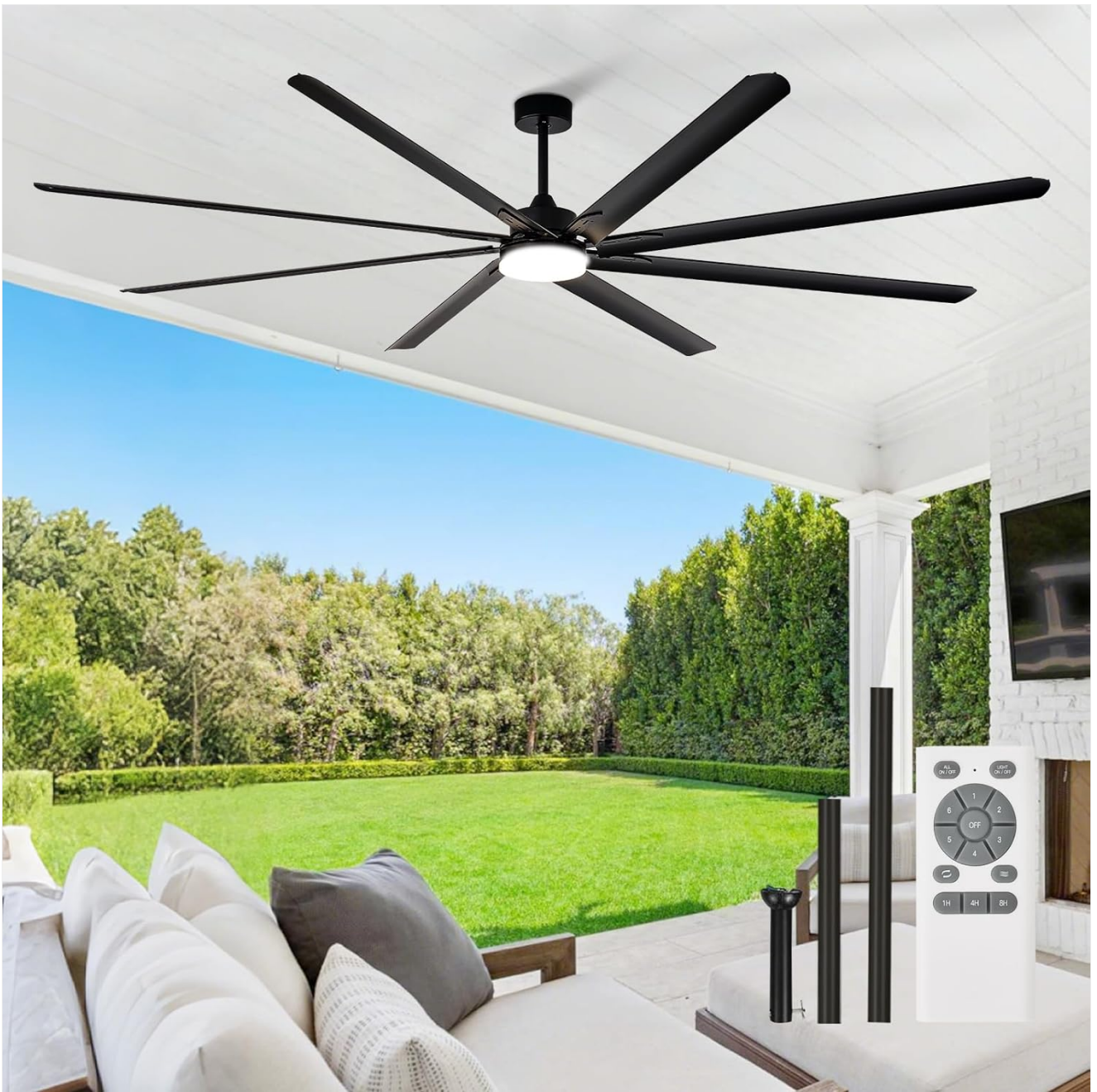
Image: The BvenuBigLite 100 Inch Large Ceiling Fan with Light, shown installed on a covered patio, demonstrating its scale and design. Includes the remote control and various downrod lengths.