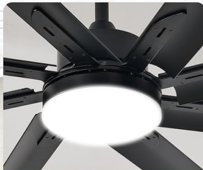
Bright 24W LED