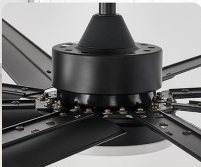
High efficiency DC motor