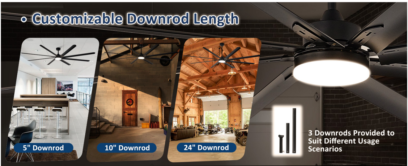
Image: An illustration demonstrating the three customizable downrod lengths (5-inch, 10-inch, 24-inch) provided with the fan,