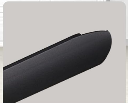
Durable aluminum blade