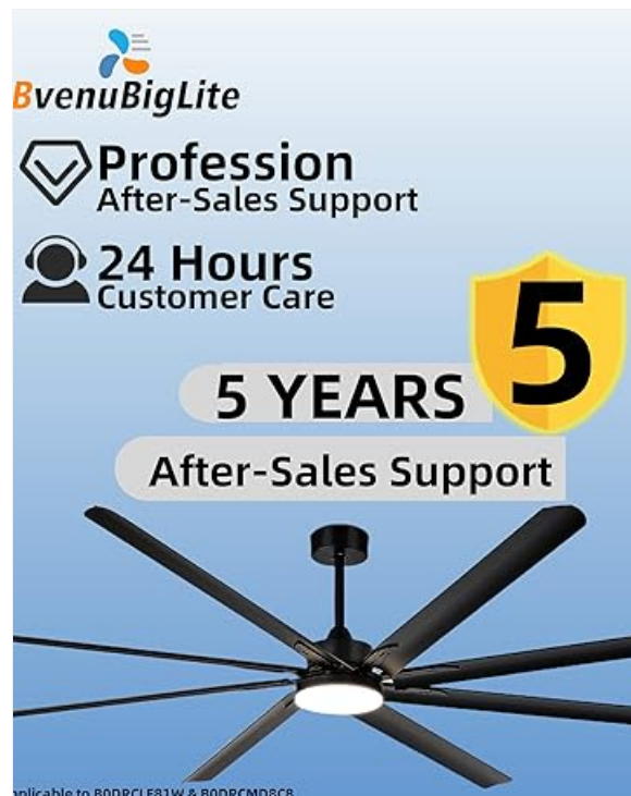
Image: A graphic highlighting BvenuBigLite's commitment to professional after-sales support, 24-hour customer care, and a 5-year after-sales support period.

Your BvenuBigLite 100 Inch Large Ceiling Fan with Light comes with a 5-YEAR after-sales service . This warranty covers defects in materials and workmanship under normal use. Please retain your proof of purchase for warranty claims.