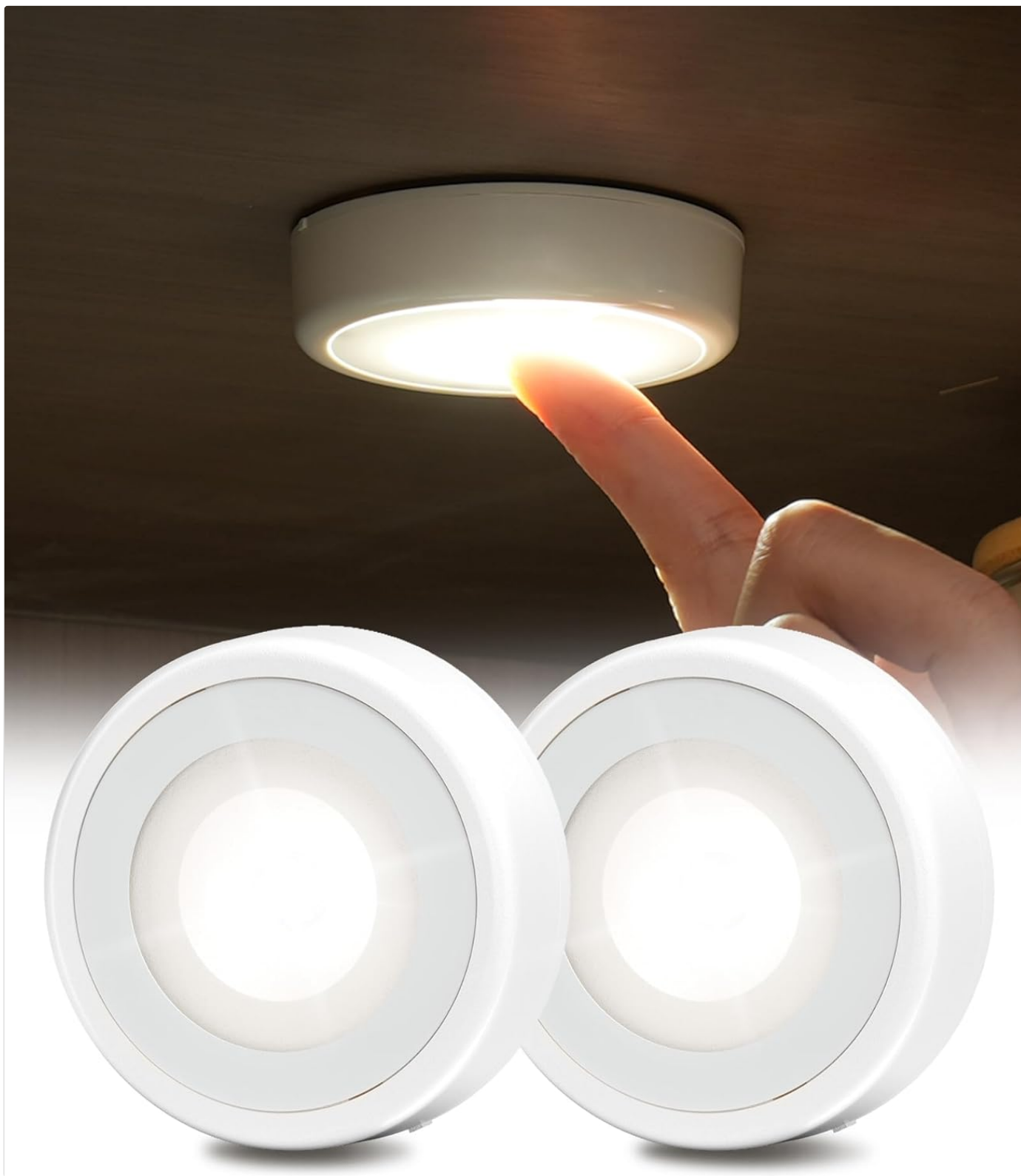
Image: EZVALO LED Puck Lights in use, demonstrating touch activation.