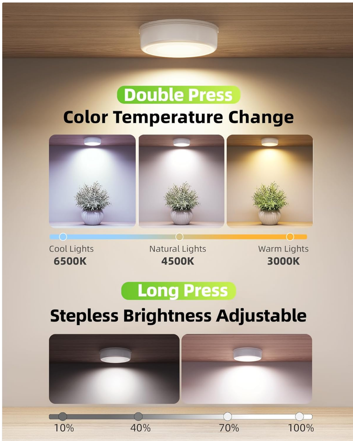
Image: Visual guide to changing color temperature and adjusting brightness using touch controls.

Your browser does not support the video tag.