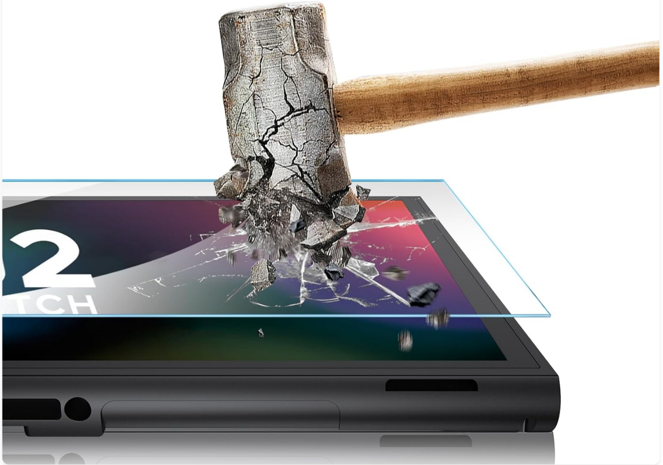
Image: Visual representation of the screen protector's shatter-proof quality.