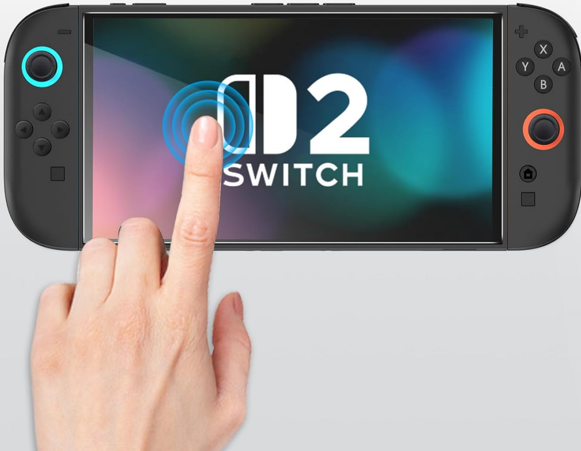
Image: Hand interacting with the screen protector, highlighting its ultra-sensitivity.

Ultra high sensitivity for a better gaming experience