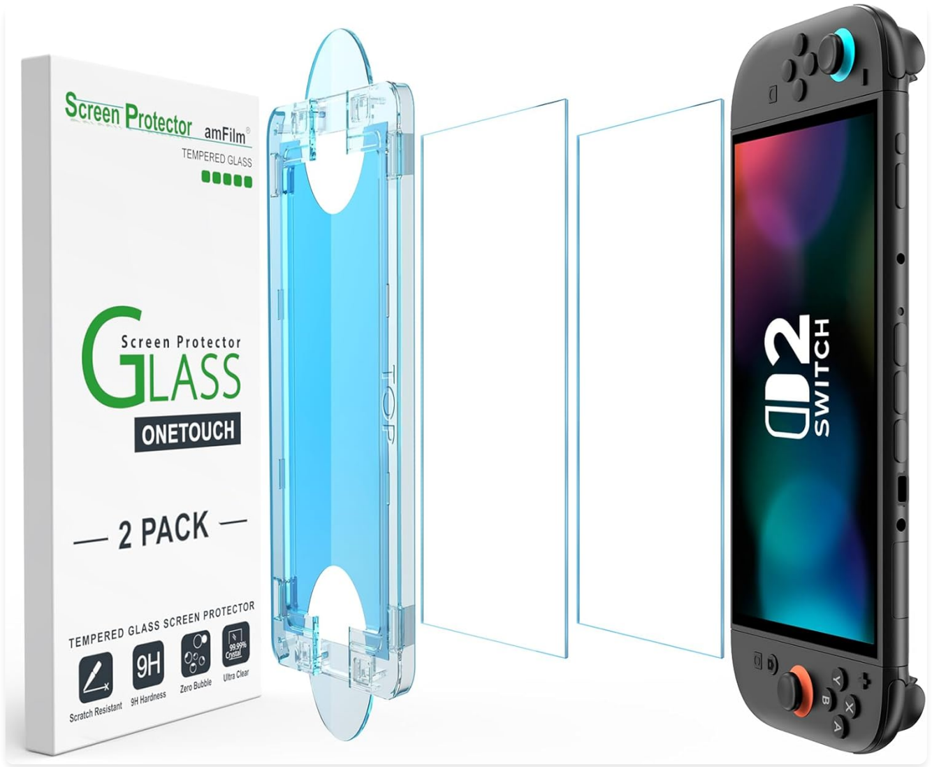
Image: amFilm OneTouch Screen Protector components and packaging.