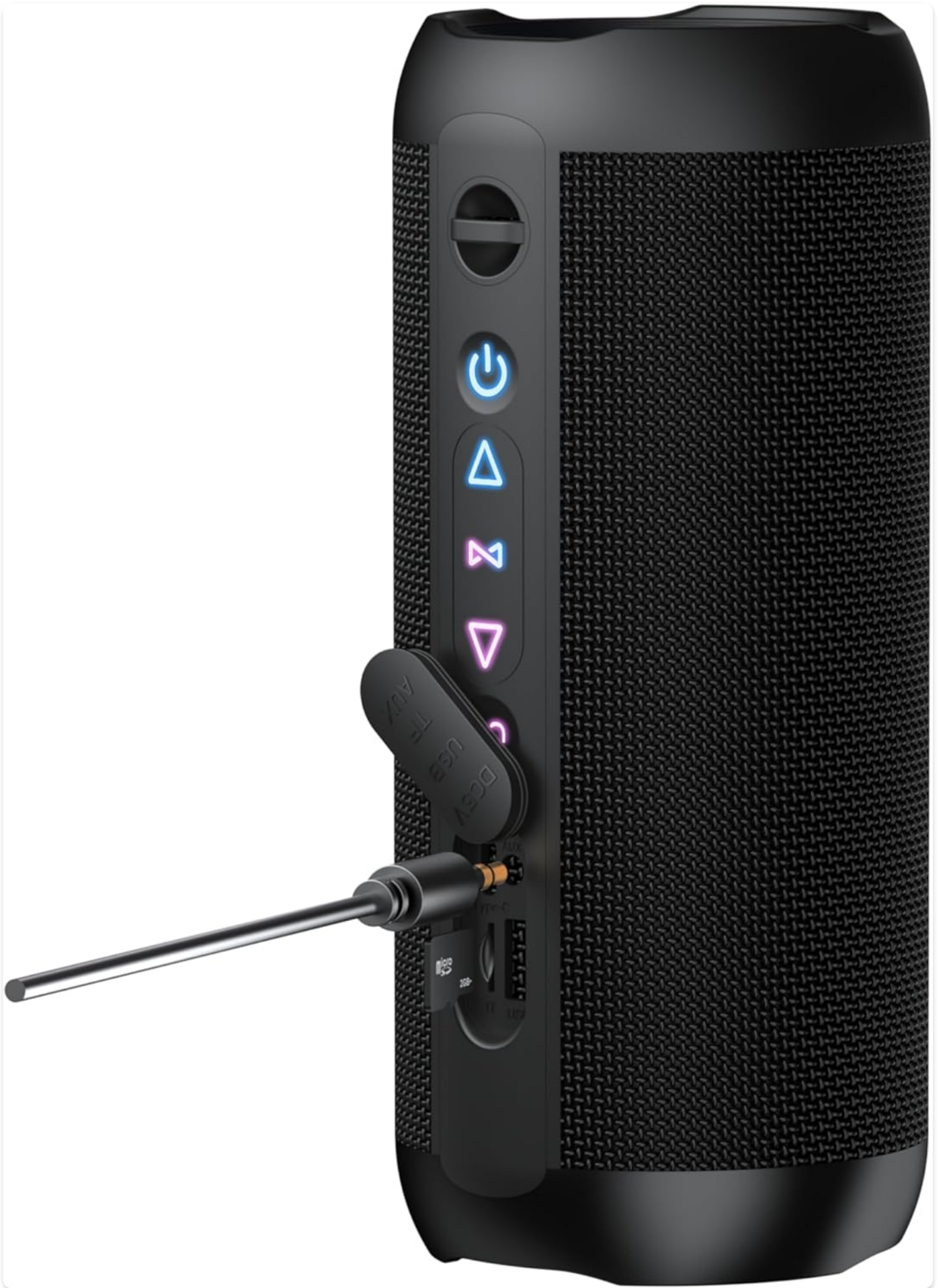
Image: Front view of the taopodo Bluetooth Speaker, showcasing its sleek design and mesh grille.