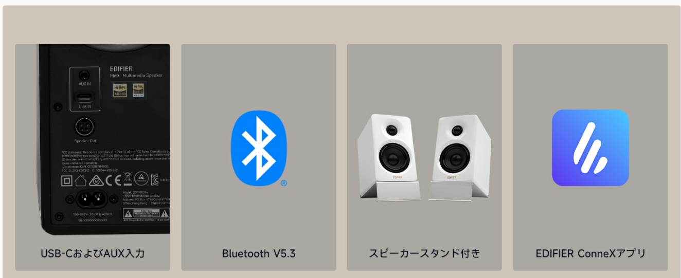
Figure 7.2: High-resolution audio processing in the M60.