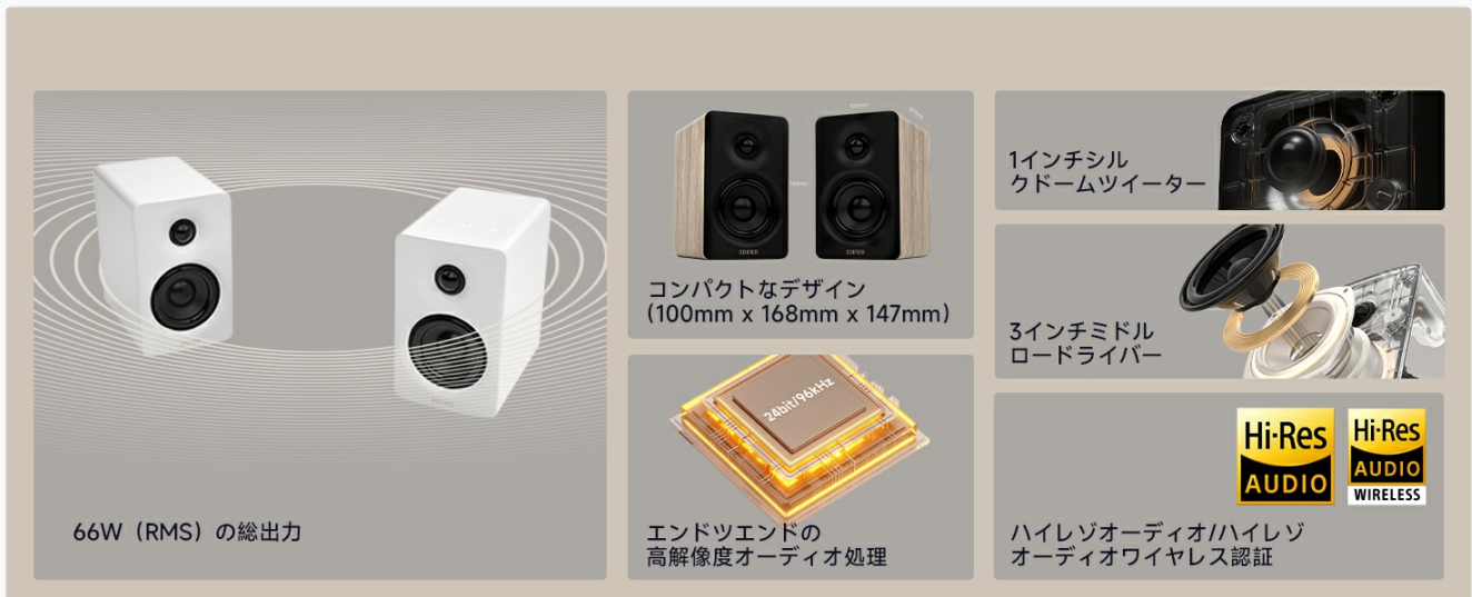
Figure 7.1: Internal components of the Edifier M60 speaker.