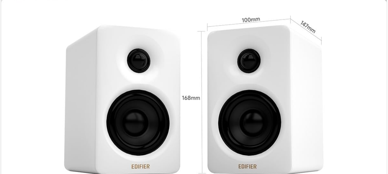
Figure 2.1: Contents of the Edifier M60 speaker package.