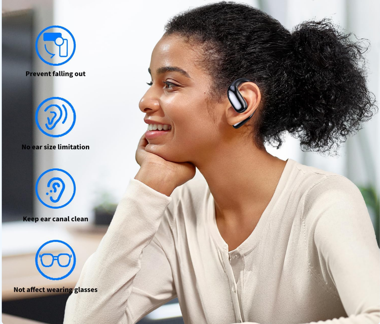
Figure 6: Ergonomic clip-on-ear design for comfort and stability.