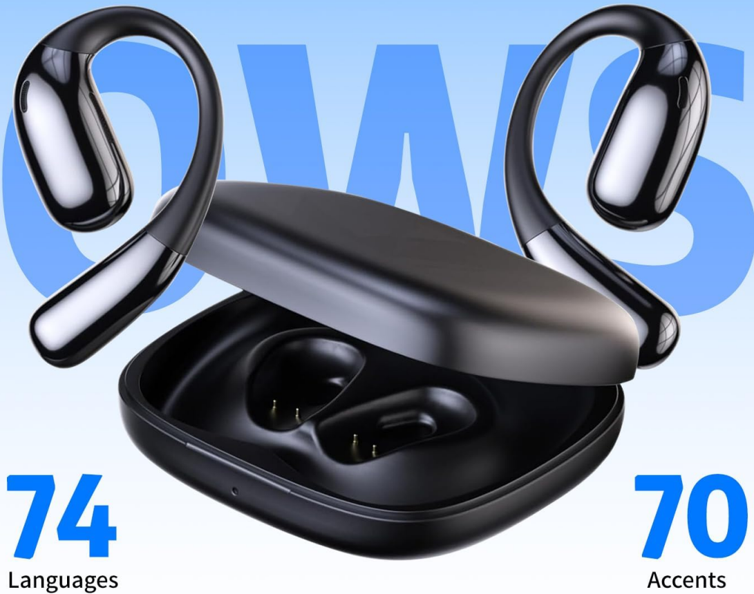
Figure 7: Real-time translation capabilities with high accuracy.

98% Accuracy Simultaneous Translation in 0.5 Sec.