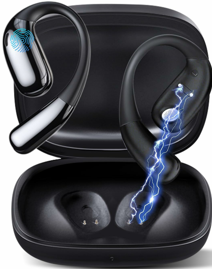
Figure 1: Ourlife AI Translation Earbuds A38 in use, highlighting key features.