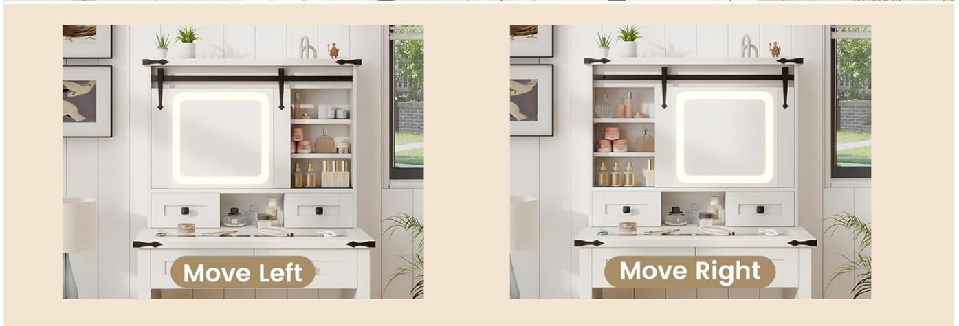
Figure 3: Detail of the barn-style sliding mirror, illustrating its smooth movement along the top rail for accessing hidden shelves.