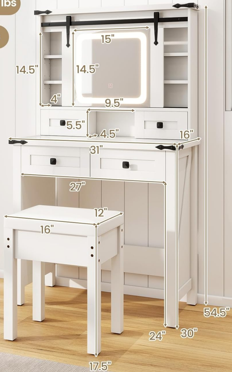
Figure 6: Detailed dimensions of the CHARMAID vanity desk and stool, including weight capacities for the tabletop and stool.