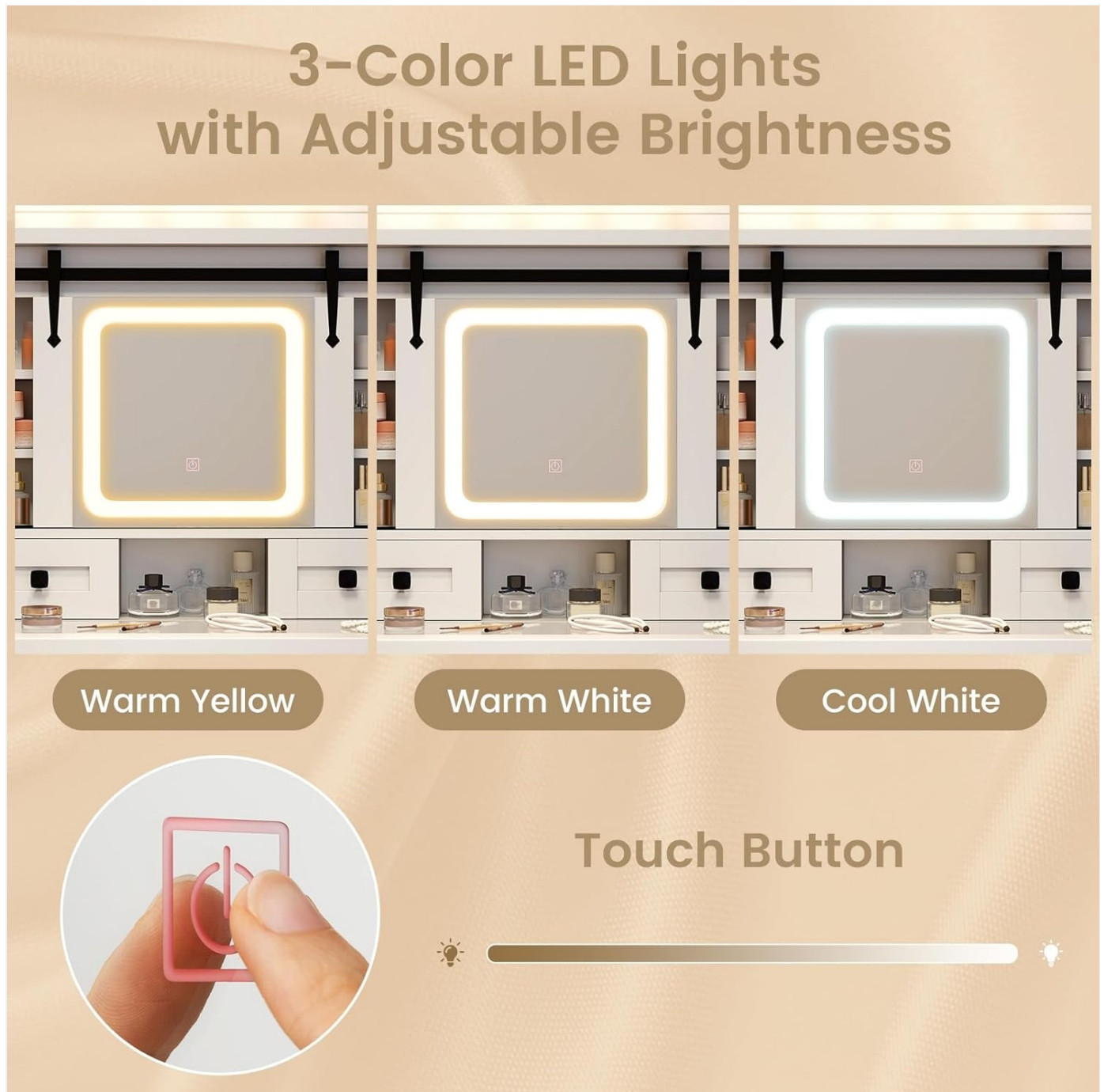
Figure 5: The three adjustable LED light settings (warm yellow, warm white, cool white) and the touch-sensitive button for control.