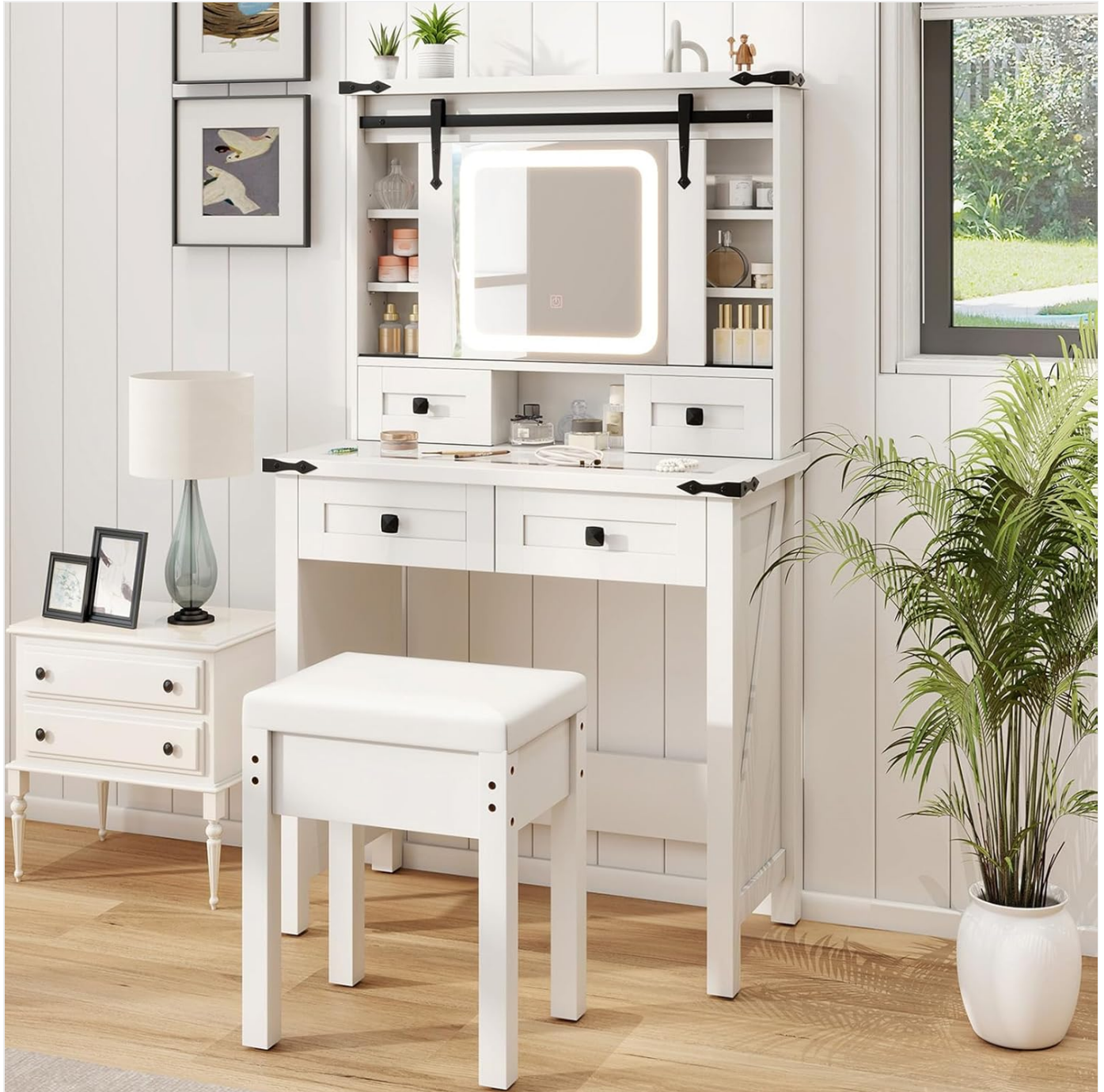
Figure 2: The fully assembled CHARMAID vanity desk and stool, showcasing its overall structure and design.

Begin by connecting the main side panels to the bottom and back support panels using the provided hardware. Ensure all connections are snug but do not overtighten.