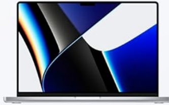
▲ For PC