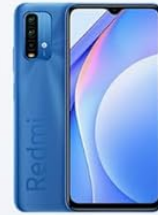
▲ For Type-c