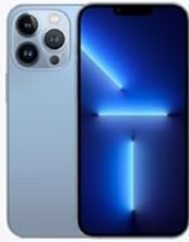
▲ For Phone/Pad

Photos/videos/files can be transferred freely between multiple devices