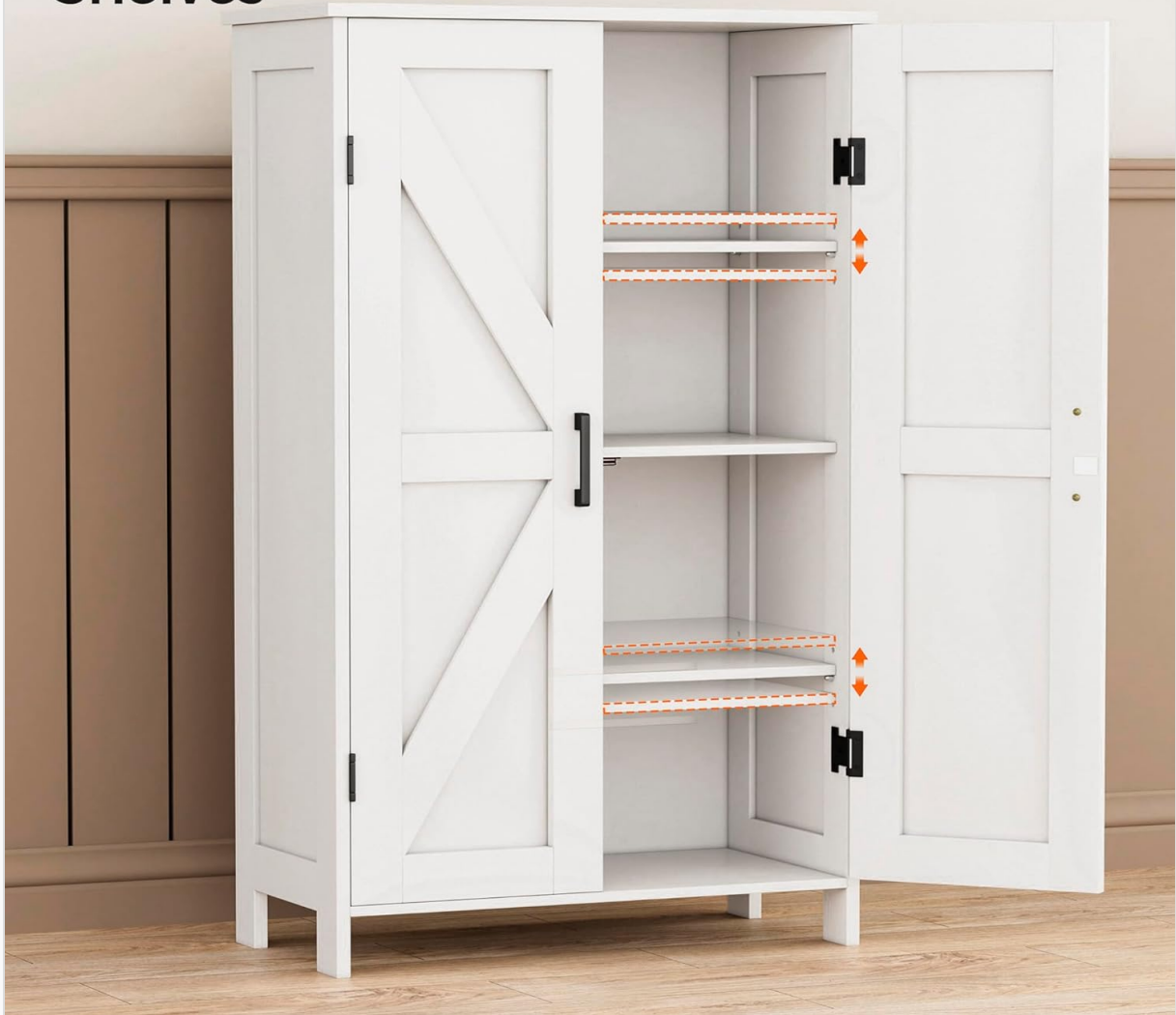
Image: Illustration demonstrating the adjustable shelf feature, highlighting how shelves can be moved up or down to customize storage space.