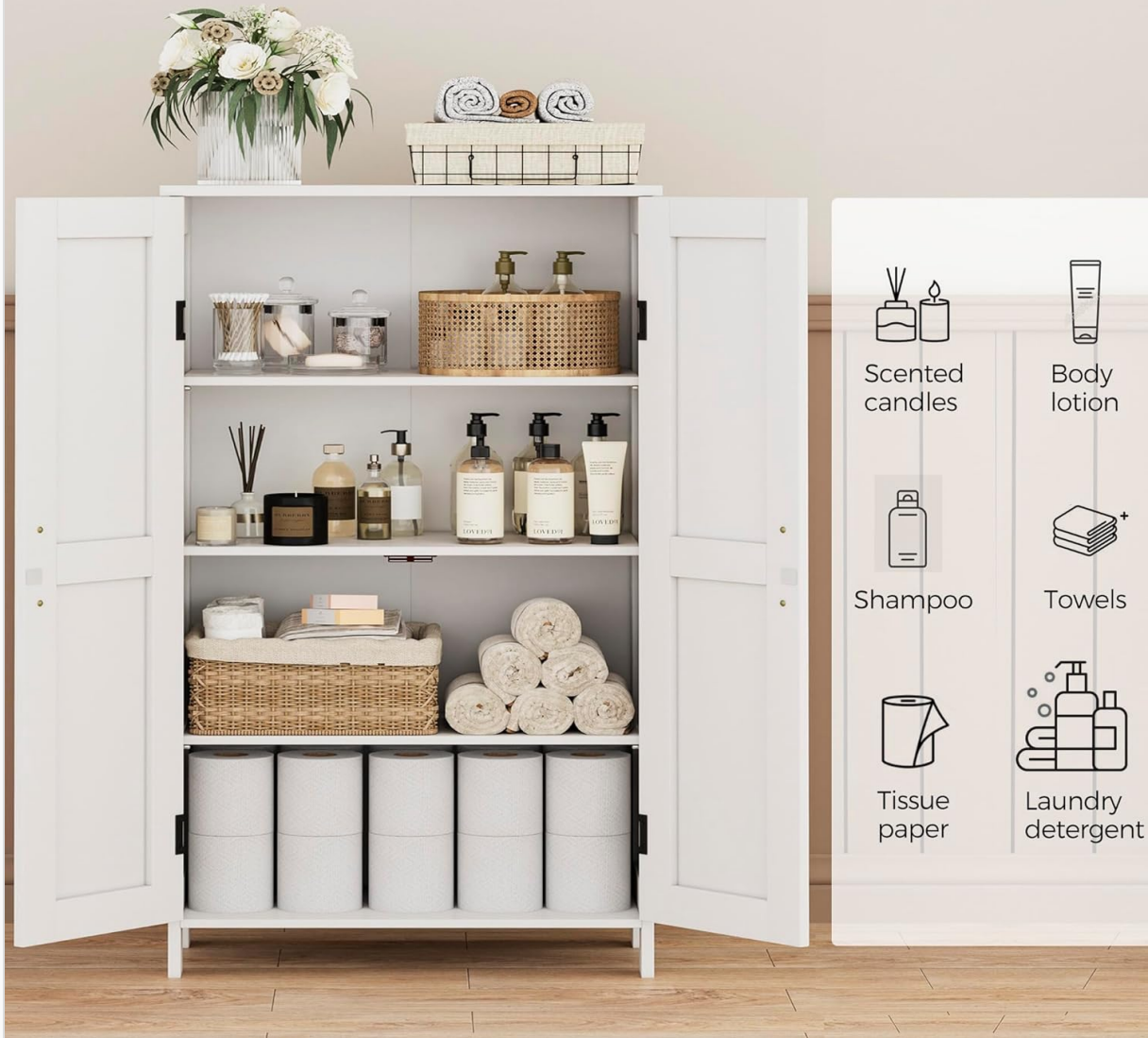
Image: The cabinet interior organized with various household items, illustrating its multi-functional storage capabilities for different room types.