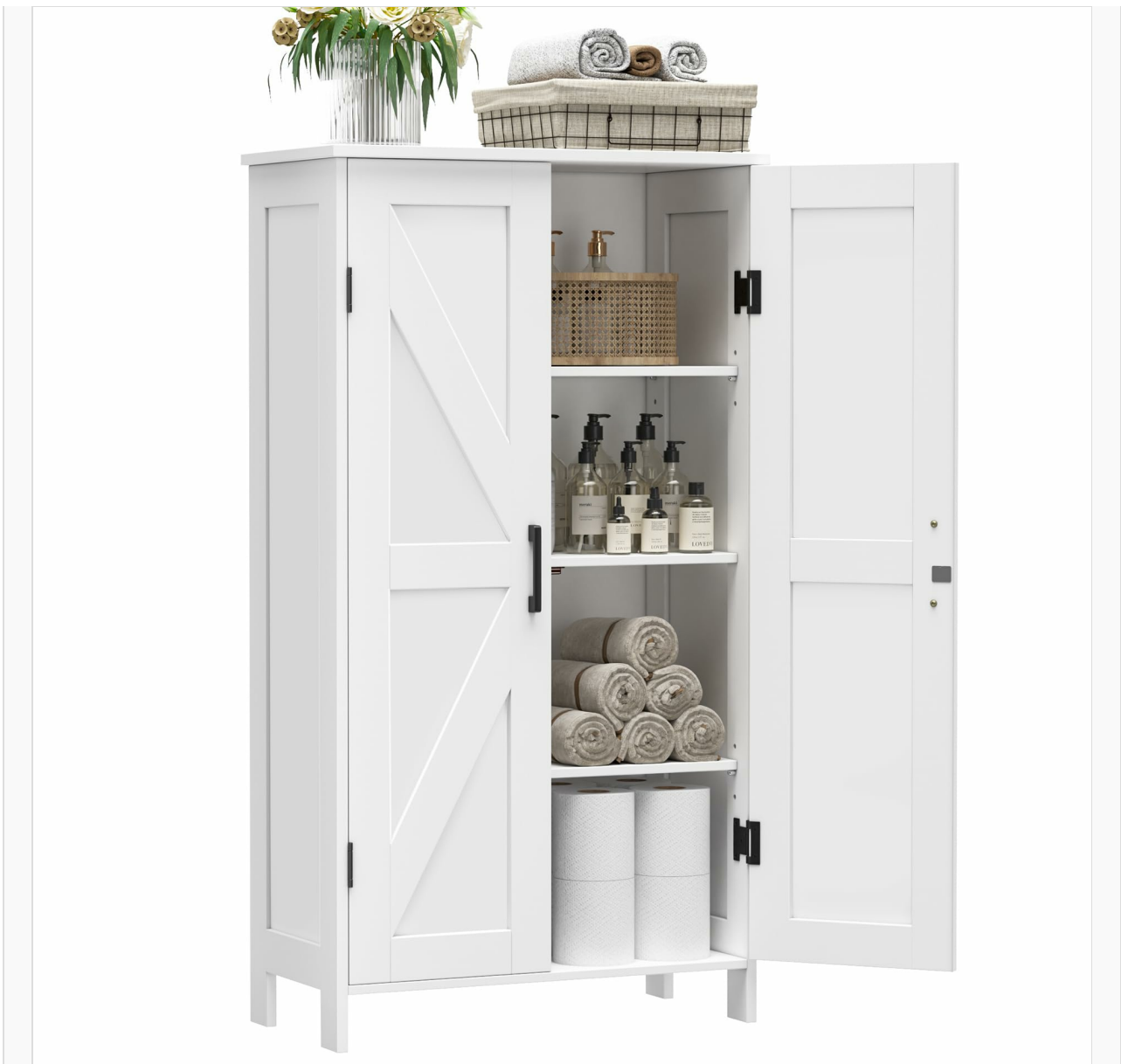
Image: The Homleke SC31W cabinet with its barn doors open, showcasing its interior storage capacity in a bathroom environment.