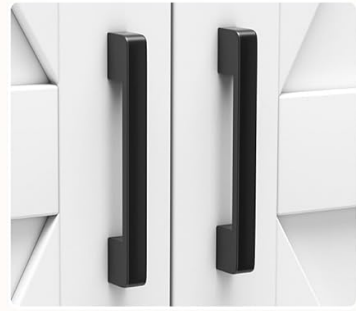
High - quality handle