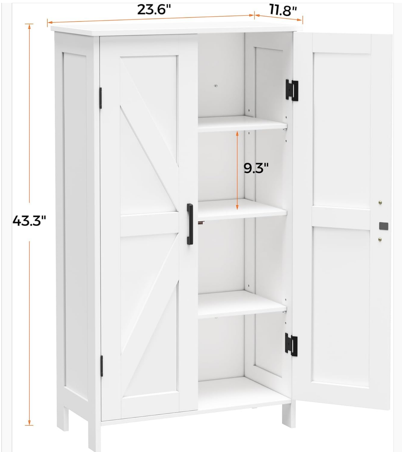
Image: Dimensional drawing of the cabinet, indicating its height, width, depth, and internal shelf spacing.