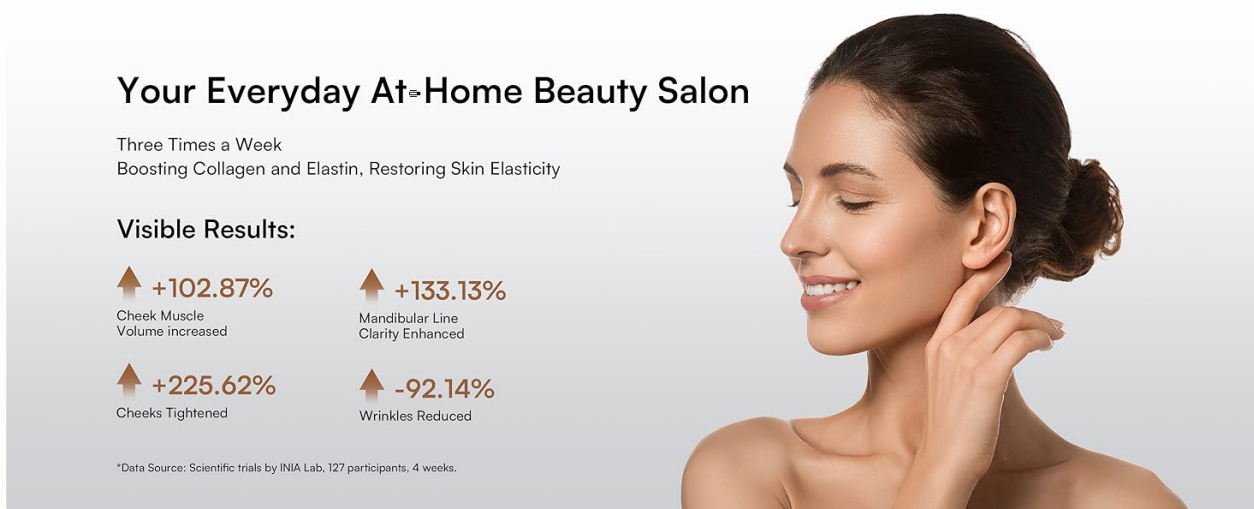
Image: A visual representation of the suggested weekly skincare routine.

Note: It is advised not to use LIFT and TIGHTEN modes on the same day to prevent dry skin.