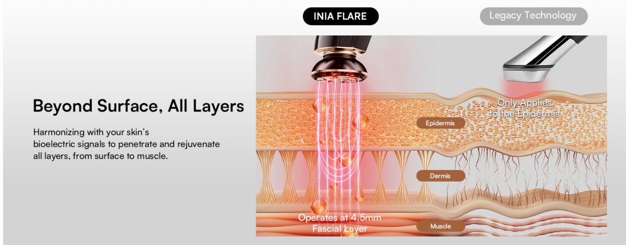
Image: Detailed illustration of TIGHTEN Mode's action on skin layers.