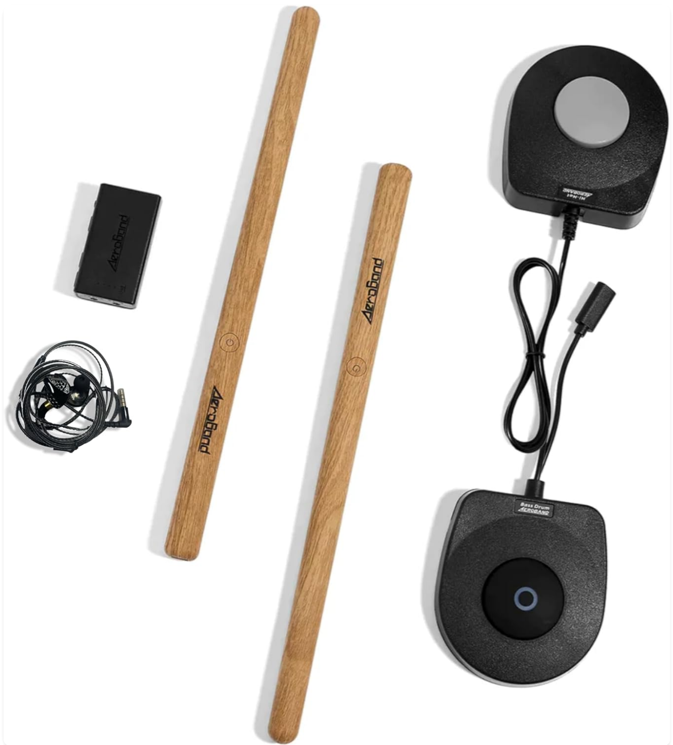
Figure 1: All components included in the PocketDrum 2 MAX package.