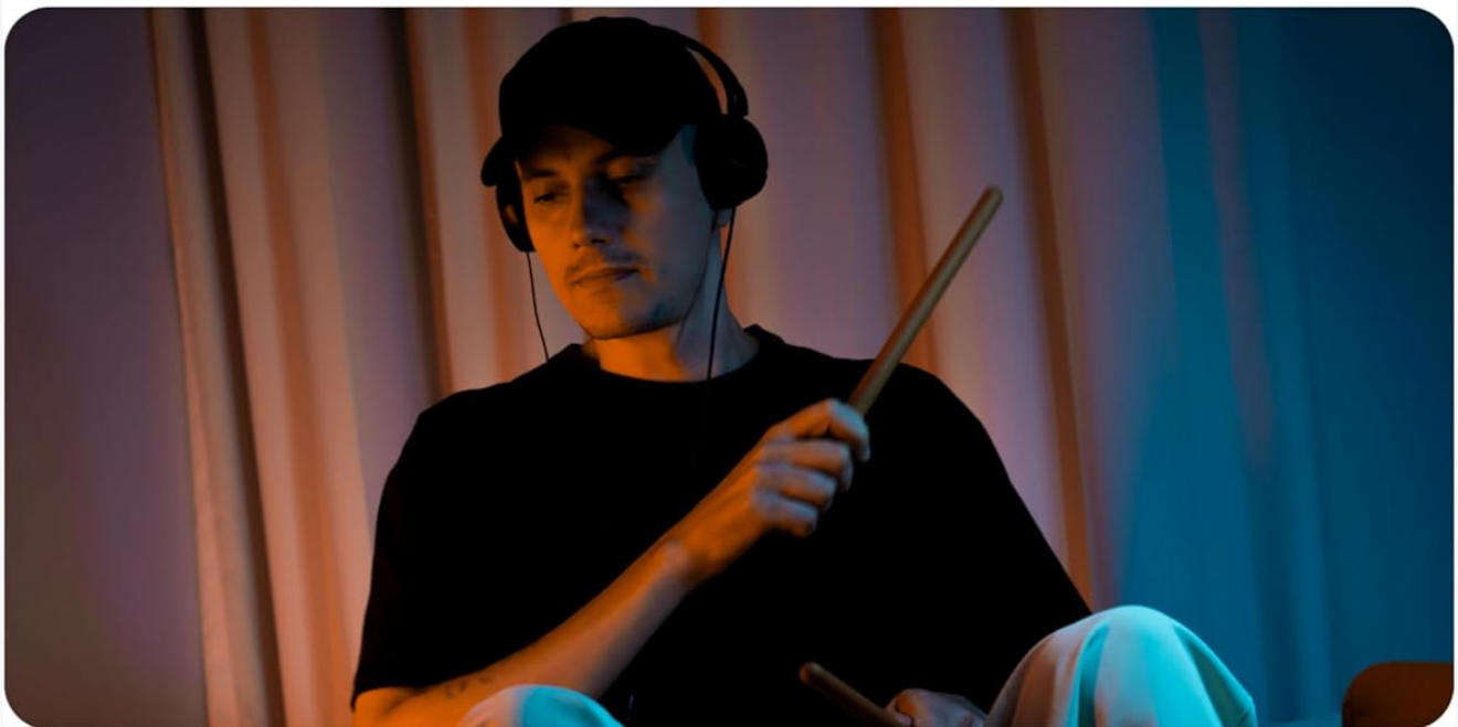
Figure 3: Play drums without limits, anywhere you go.