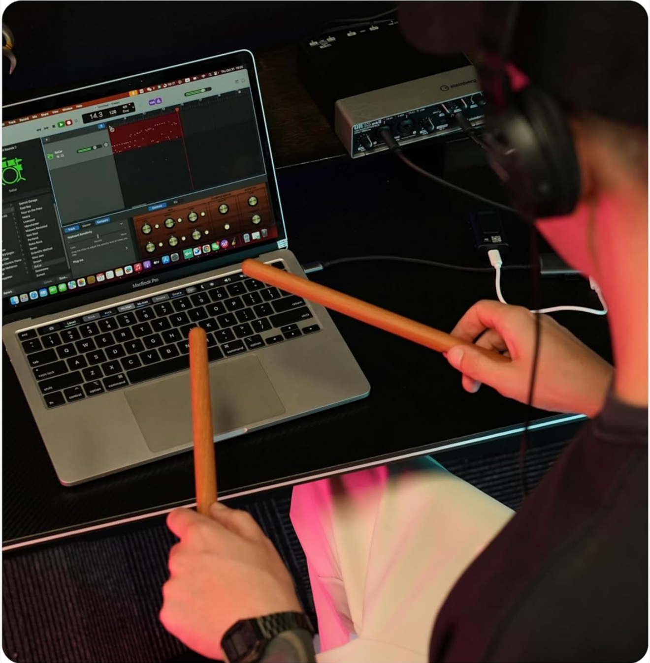
Figure 6: Utilize MIDI functionality for recording and advanced music creation.