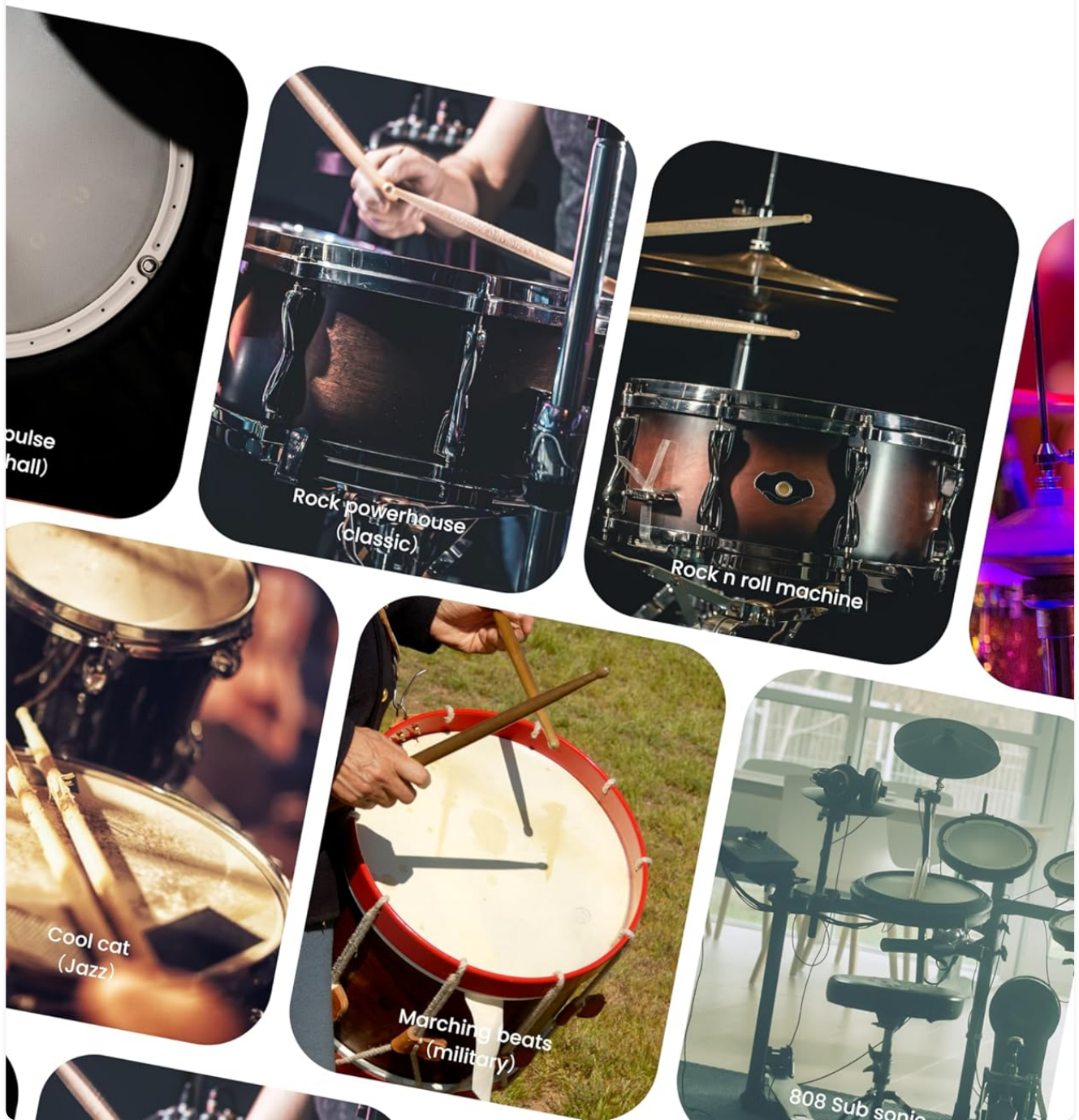
Figure 5: Explore various drum tones for different music genres.