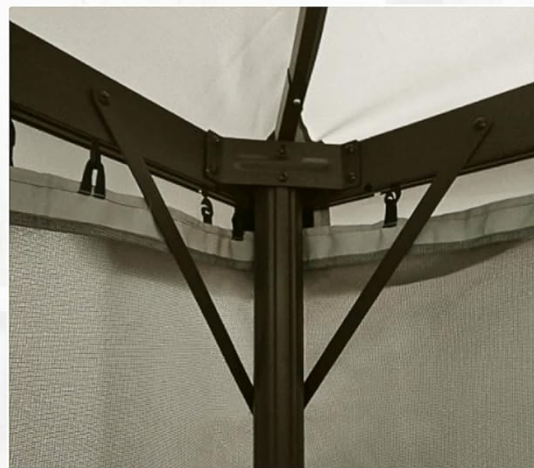
Hanging Loop Design easy for connection

Key features include double-sided zippers for easy access, hook & loop straps to tie curtains, feet with holes for ground stakes, and a hanging loop design for easy curtain connection.