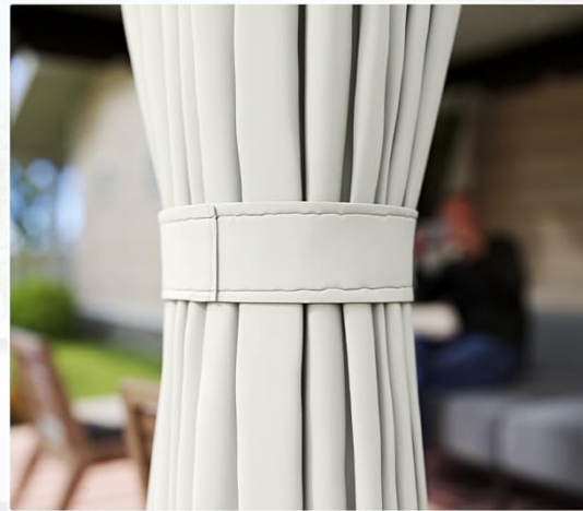
Hook & Loop Strap tie to the curtains easily