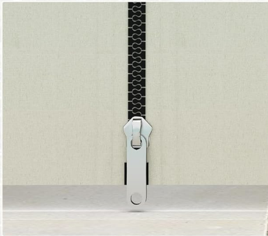
Double-Sided Zipper easy to access