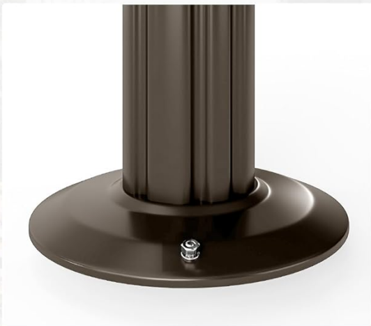
Feets with Holes to insert reinforcement accessories