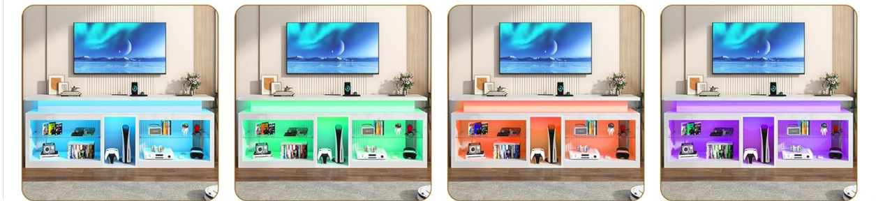
Image 5.1: LED lighting features with remote and app control options.