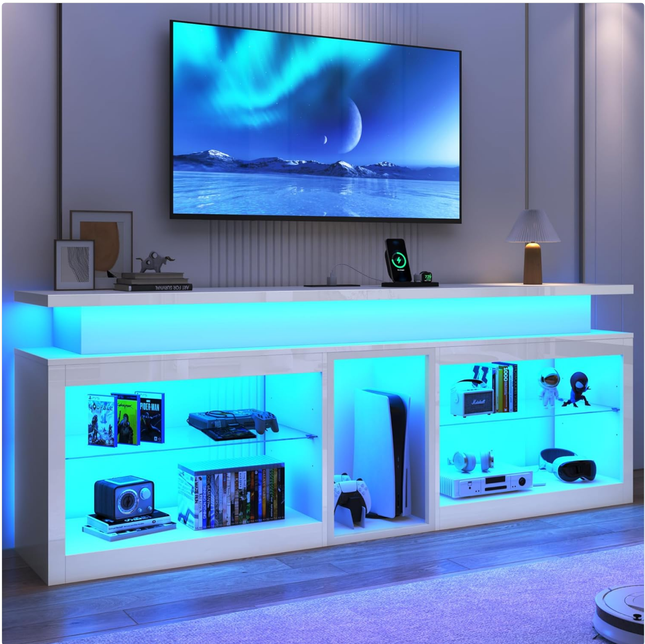
Image 1.1: Fully assembled Hlivelood 71-inch LED TV Stand with LED lights illuminated.