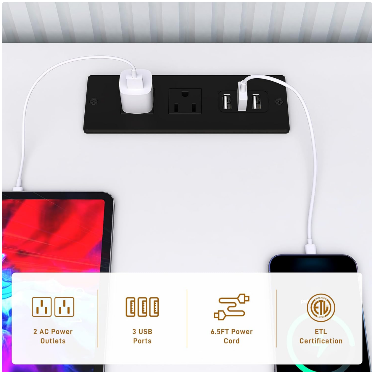
Image 5.2: Close-up of the integrated power outlet with AC sockets and USB ports.