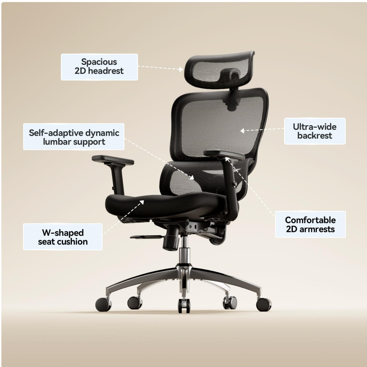
Figure 2.2: Key Features of the SIHOO M102C Chair