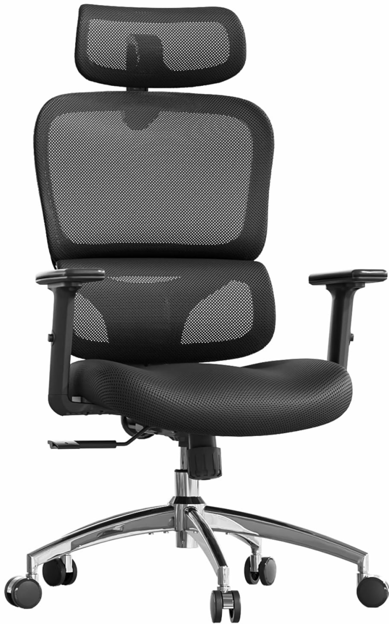
Figure 2.1: SIHOO M102C Ergonomic Office Chair