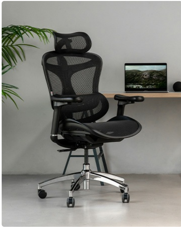
Figure 8.1: SIHOO Customer Support Information