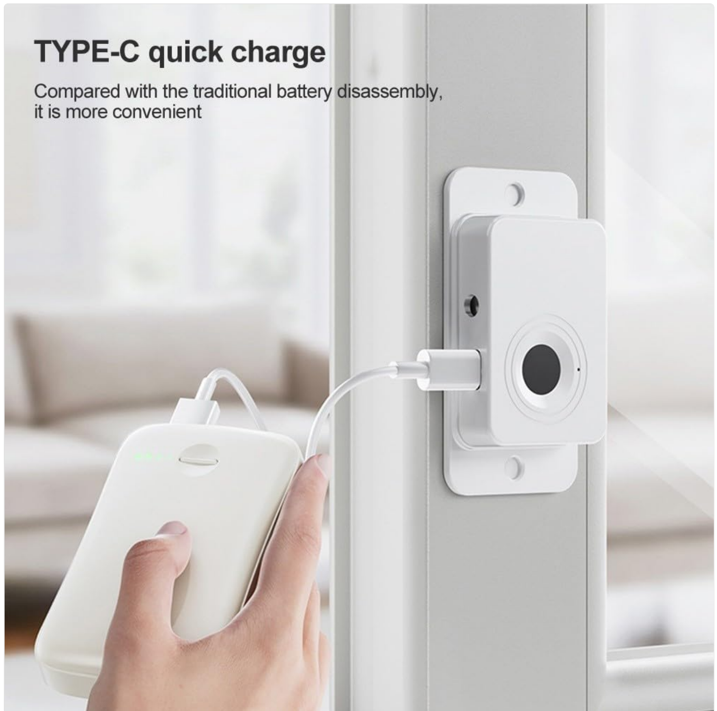
Image: Charging the lock via USB Type-C.

Before first use, fully charge the lock. Connect the provided USB Type-C cable to the charging port on the fingerprint unit and to a standard USB power adapter (not included).