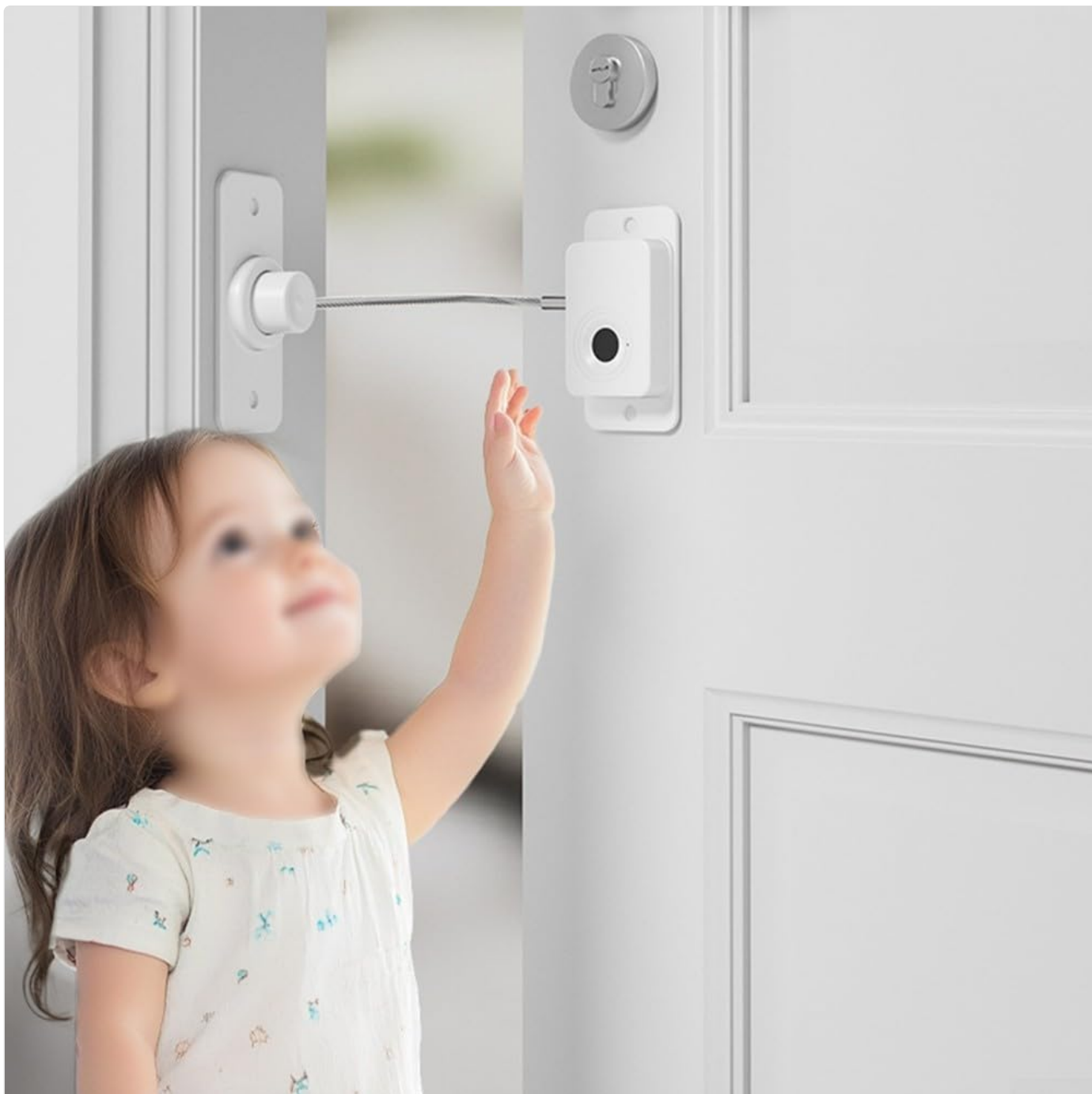
Image: Child-friendly operation.