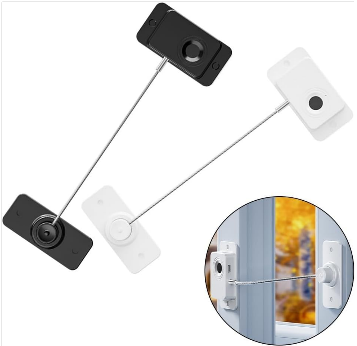
Image: Example installation on a cabinet.

The lock features adjustable ventilation spacing, allowing you to customize the installation to fit various window or door gaps. Ensure the cable is taut but not overly stressed when the lock is engaged.