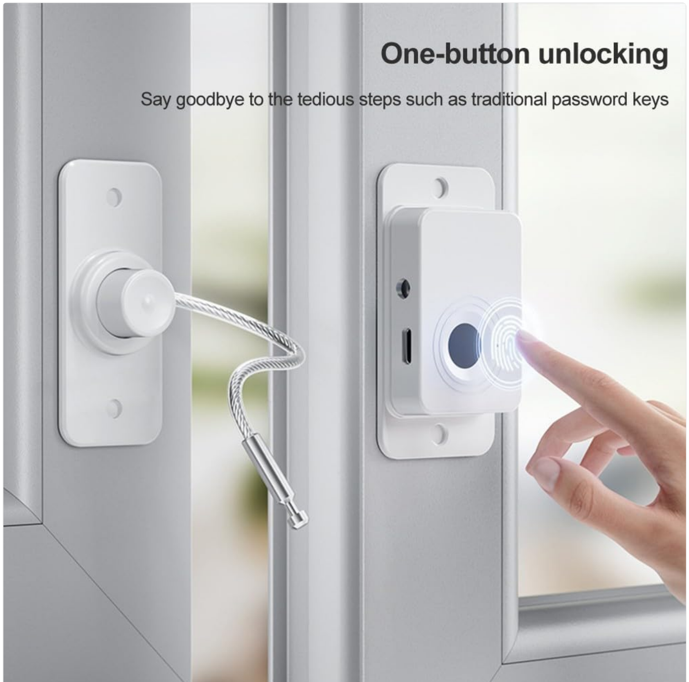
Image: Registering a fingerprint for one-button unlocking.