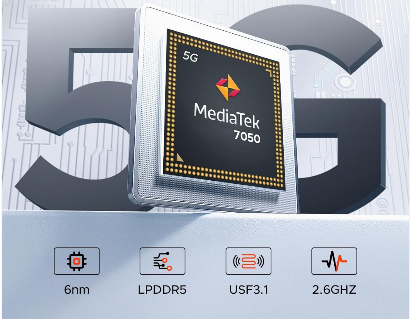
Figure 8: Illustration of the Dimensity 7050 5G Octa-core Processor.

Boosted Performance, Reduced Consumption