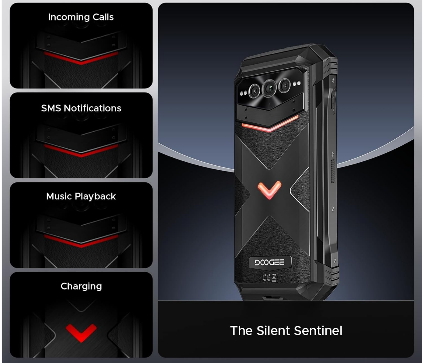
Figure 7: Examples of smart interaction light indications.