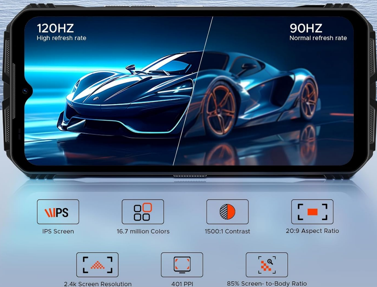
Figure 4: Visual representation of the 120Hz display and its specifications.