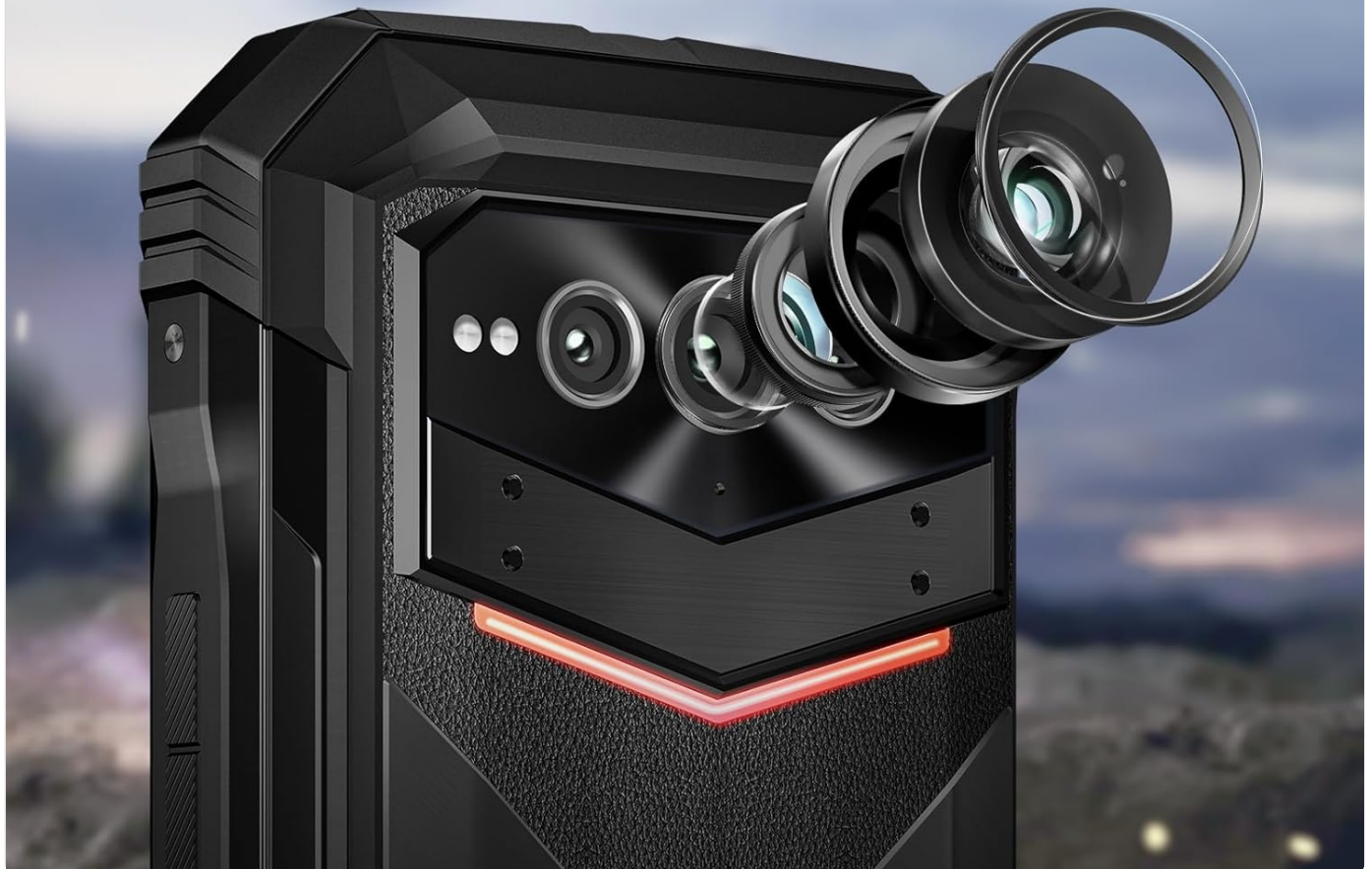
Figure 5: Overview of the phone's multi-camera system.