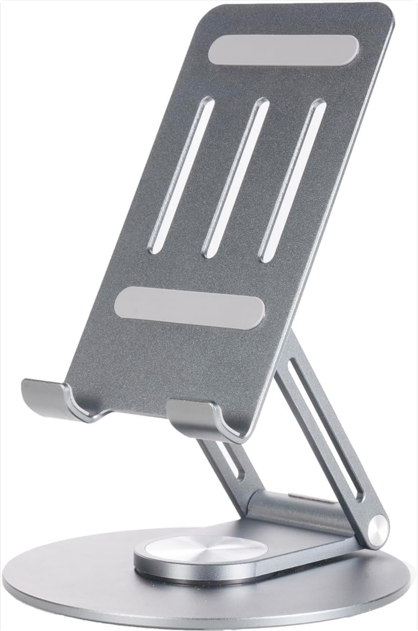
Figure 2: The adjustable tablet stand.