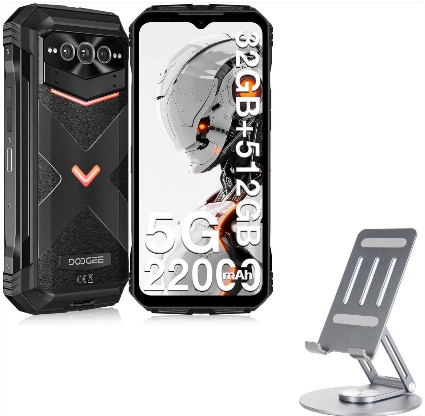
Figure 1: DOOGEE V Max Pro Rugged Phone and included Tablet Stand.