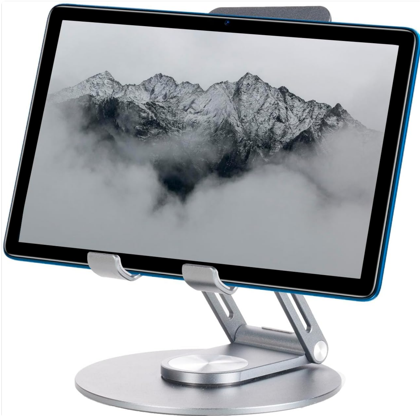
Figure 3: Tablet stand in use with a device.