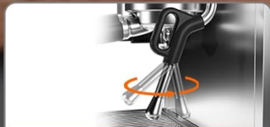
360°Rotating steam wand