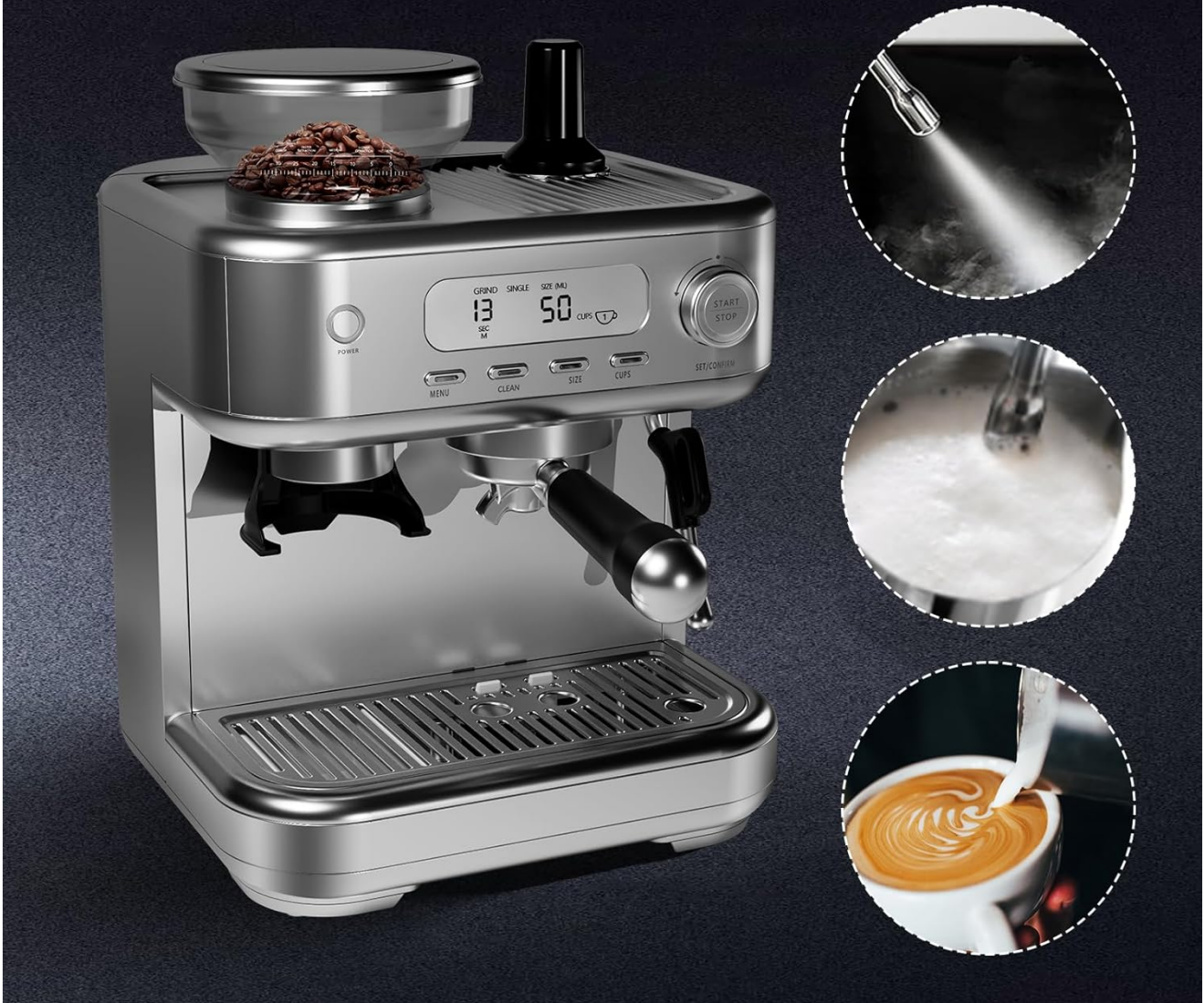
Image demonstrating the creation of latte art using the professional milk frothing wand.

More smooth milk froth, easier to latte art