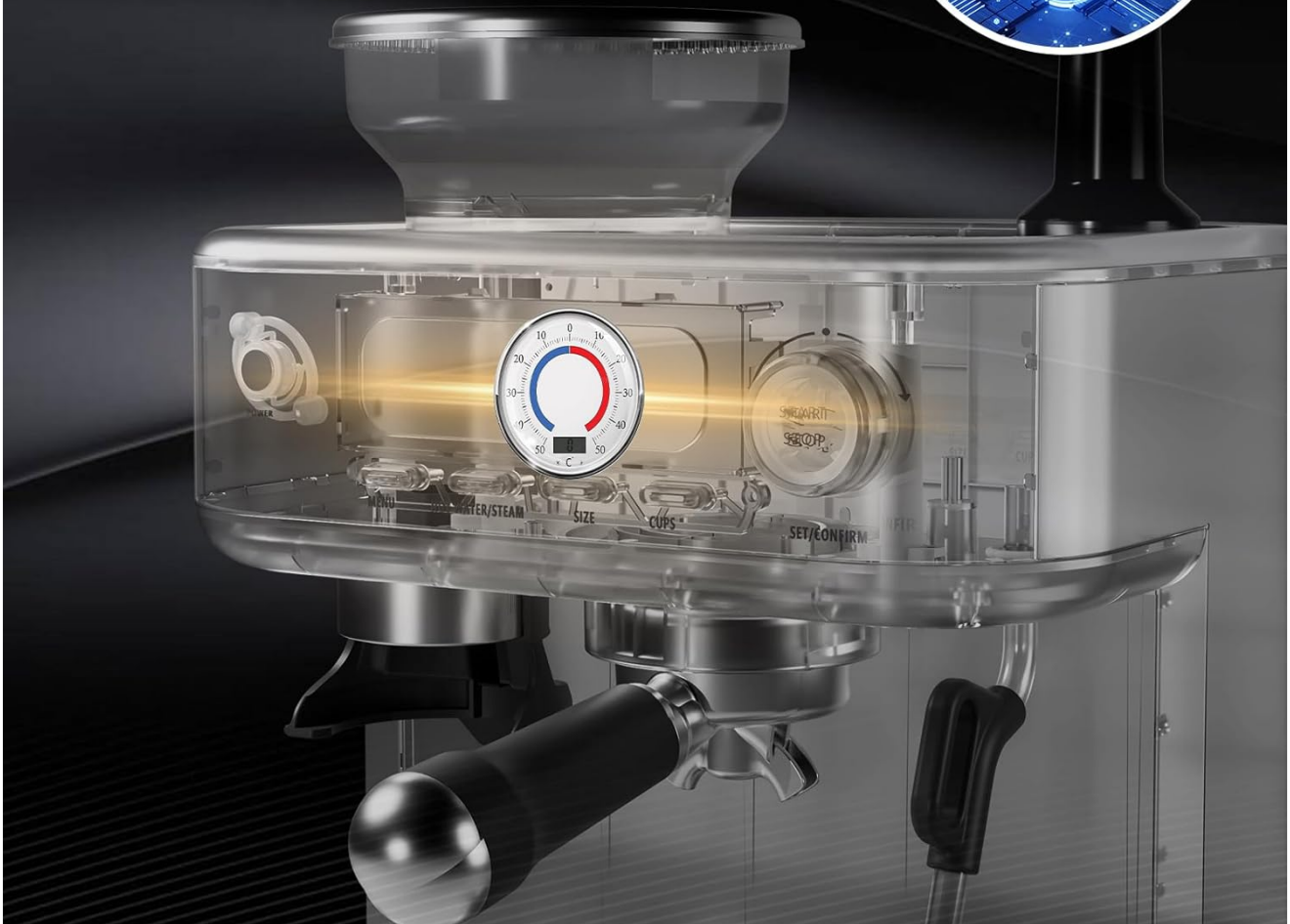
Top view of the espresso machine showing the grinder hopper and PID intelligent temperature control system.