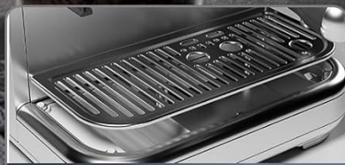
Detachable drip tray