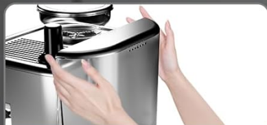
Removable water tank