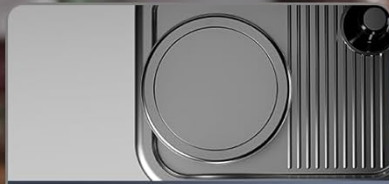
Top cup holder