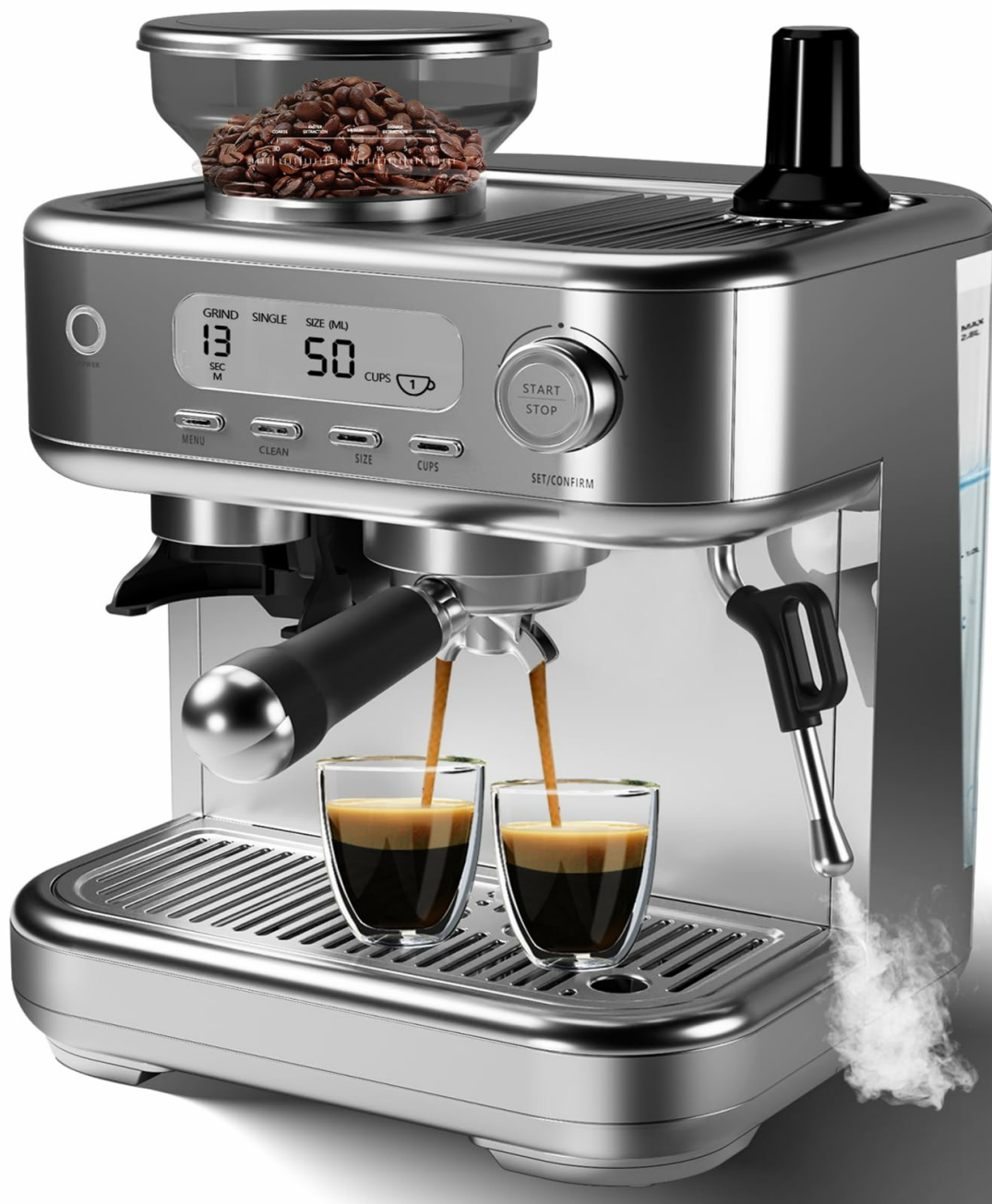
Front view of the Euker 15-Bar Espresso Machine with grinder, showing the LCD display and controls.