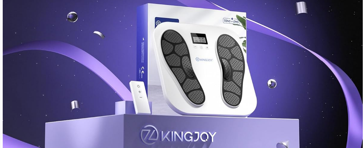
Image: The KINGJOY Foot Massager unit, remote control, electrode pads, charging cable, power adapter, and product