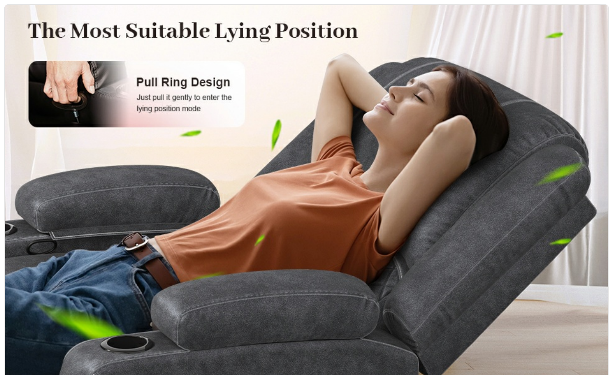
Image: The Yolsali Loveseat Recliner Sofa Set, consisting of a loveseat and two single recliners, arranged in a living room setting. People are shown relaxing on the furniture, highlighting its comfort and versatility.

Thank you for choosing the Yolsali Loveseat Recliner Sofa Set. This set includes one loveseat and two individual recliner chairs, designed for comfort and functionality in your living space. It features double-layer seat cushions, a removable console with cup holders and USB charging ports, hidden armrest storage, and a smooth manual recline function. This manual provides essential information for assembly, operation, maintenance, and troubleshooting to ensure a long-lasting and enjoyable experience with your new furniture.