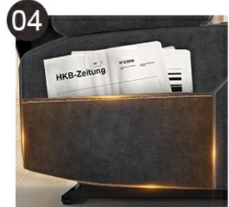
04 Side Pockets

Image: A detailed view of the hidden storage space located within the armrest, accessible via a flip-open top and zippered compartments, ideal for keeping small items organized.