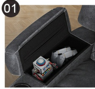
01 Hidden Storage Space