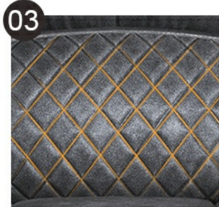
03 Fashion Design