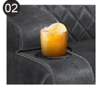
02 Cup Holders