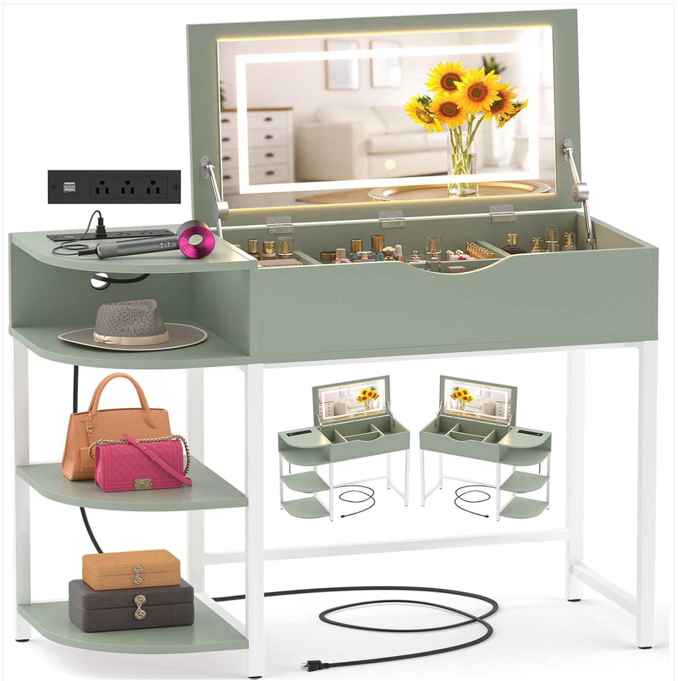
Figure 1: Cyclysio YHDT-013 Vanity Desk (Green)

This image displays the complete Cyclysio YHDT-013 vanity desk in green, showcasing its flip-top mirror, side storage shelves, and integrated charging station.