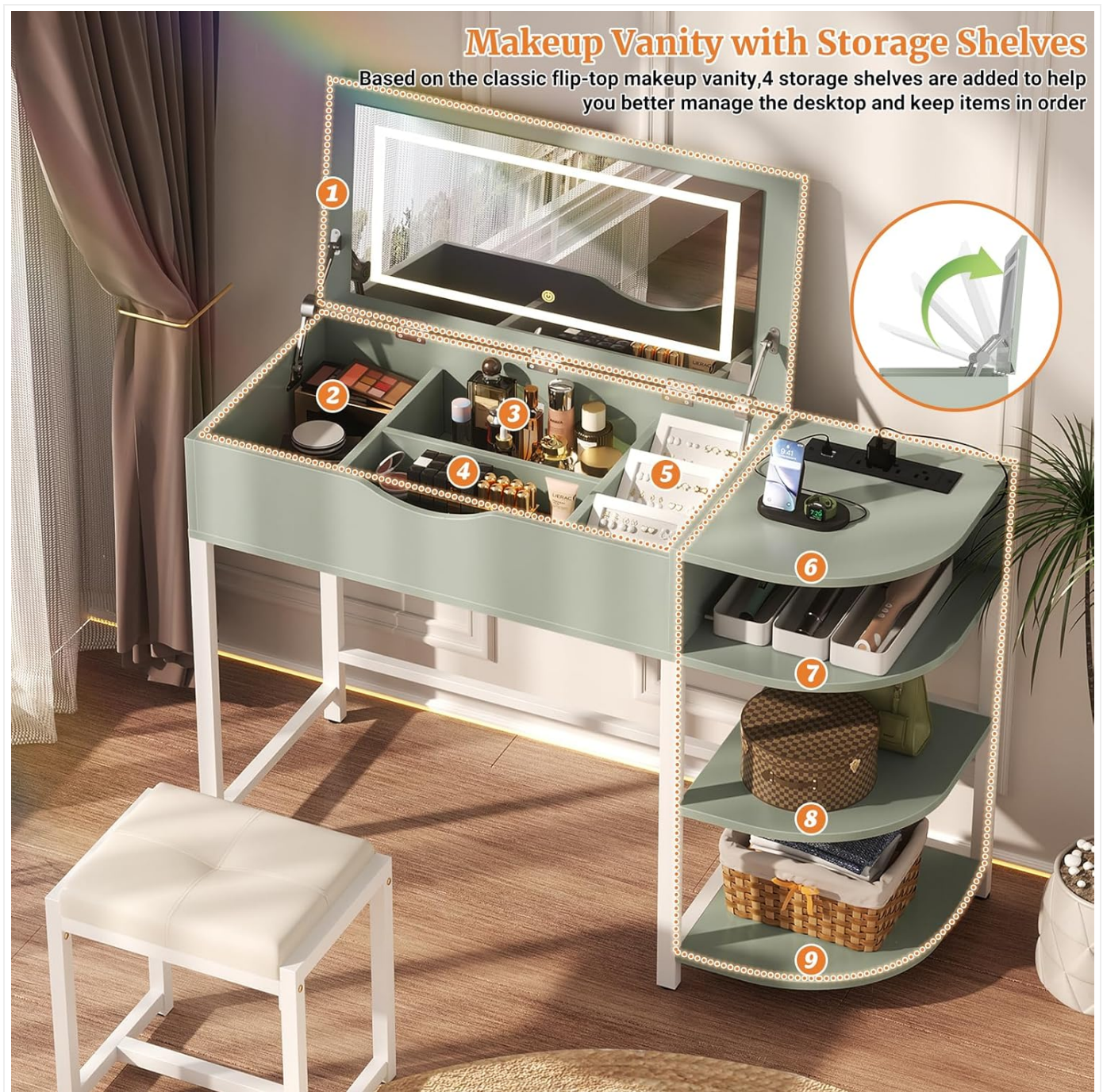
Figure 8: Overview of the vanity desk's storage capabilities.

This image details the various storage compartments, including the divided sections under the mirror and the multi-tier side shelves, with numbered callouts for different storage areas.