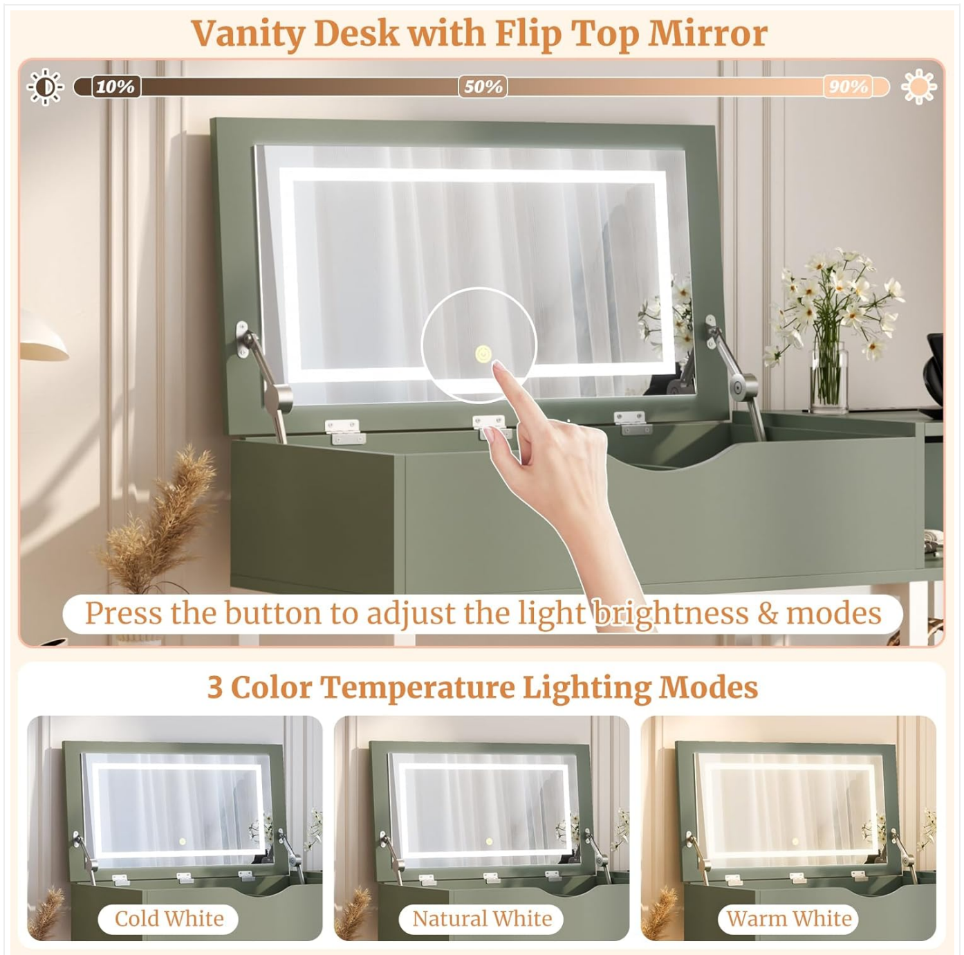
Figure 4: Demonstrating the touch control for mirror light brightness and modes.

This image shows a hand interacting with the touch sensor on the mirror to adjust light settings, with indicators for brightness levels.