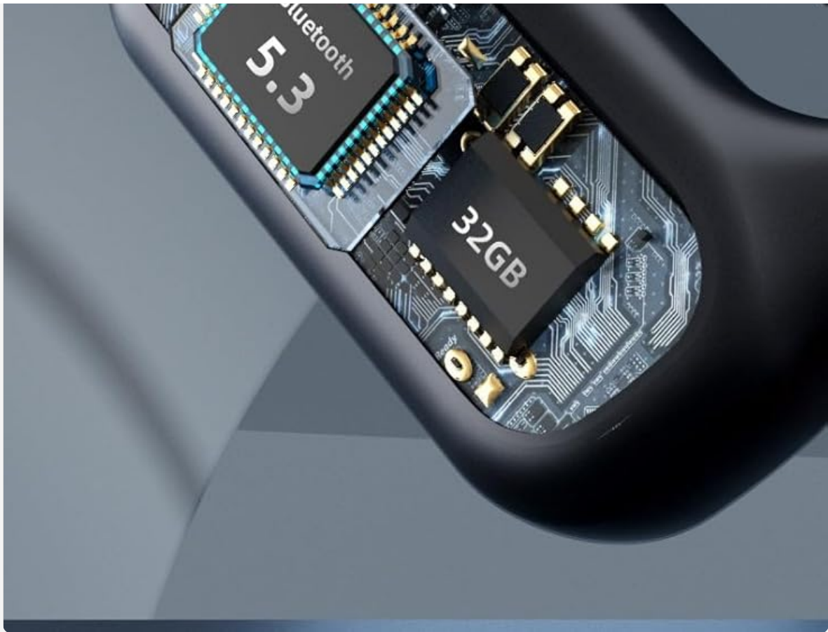
Image: An internal diagram of the X10 headphones highlighting the Bluetooth 5.3 chip and 32GB memory, emphasizing fast and stable connectivity.