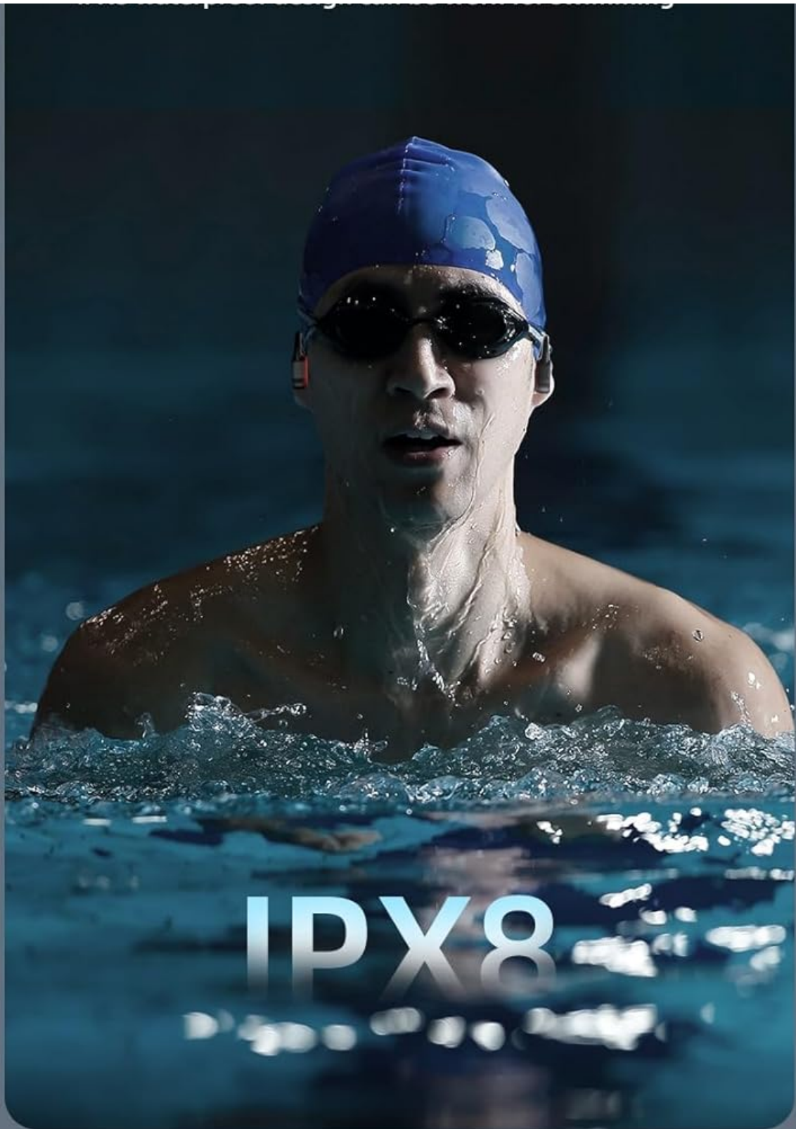
Image: A man wearing the X10 headphones while swimming, demonstrating their waterproof capability. The text "Take it for a swim No problem! IPX8 waterproof design can be worn for swimming" is overlaid.