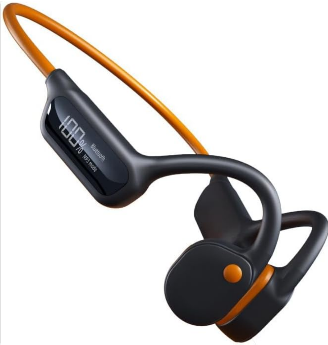
Image: The X10 Bone Conduction Swimming Headphones, featuring a black body with an orange neckband and ear hooks, showcasing the digital display.