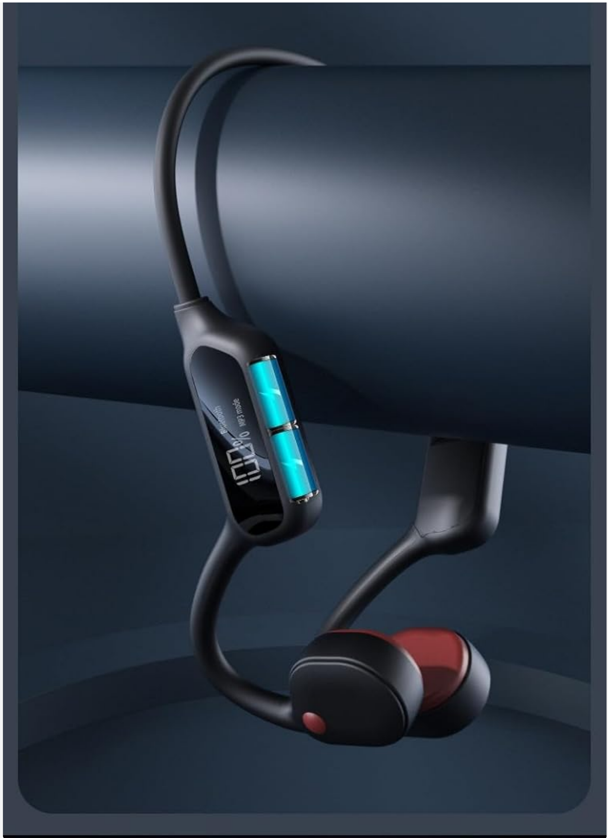
Image: A visual representation of the X10 headphones emphasizing the 32GB built-in memory, capable of storing thousands of songs.