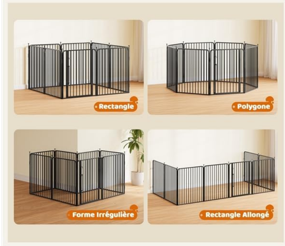
Figure 2: The playpen can be configured into various shapes such as a rectangle, polygon, irregular shape, or an elongated rectangle, offering flexibility without the need for tools.