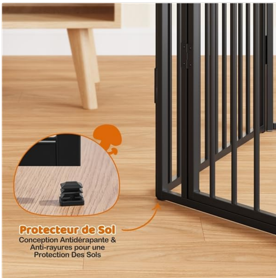
Figure 7: A detailed view of the floor protector, emphasizing its anti-slip design and ability to protect floors from scratches and wear.