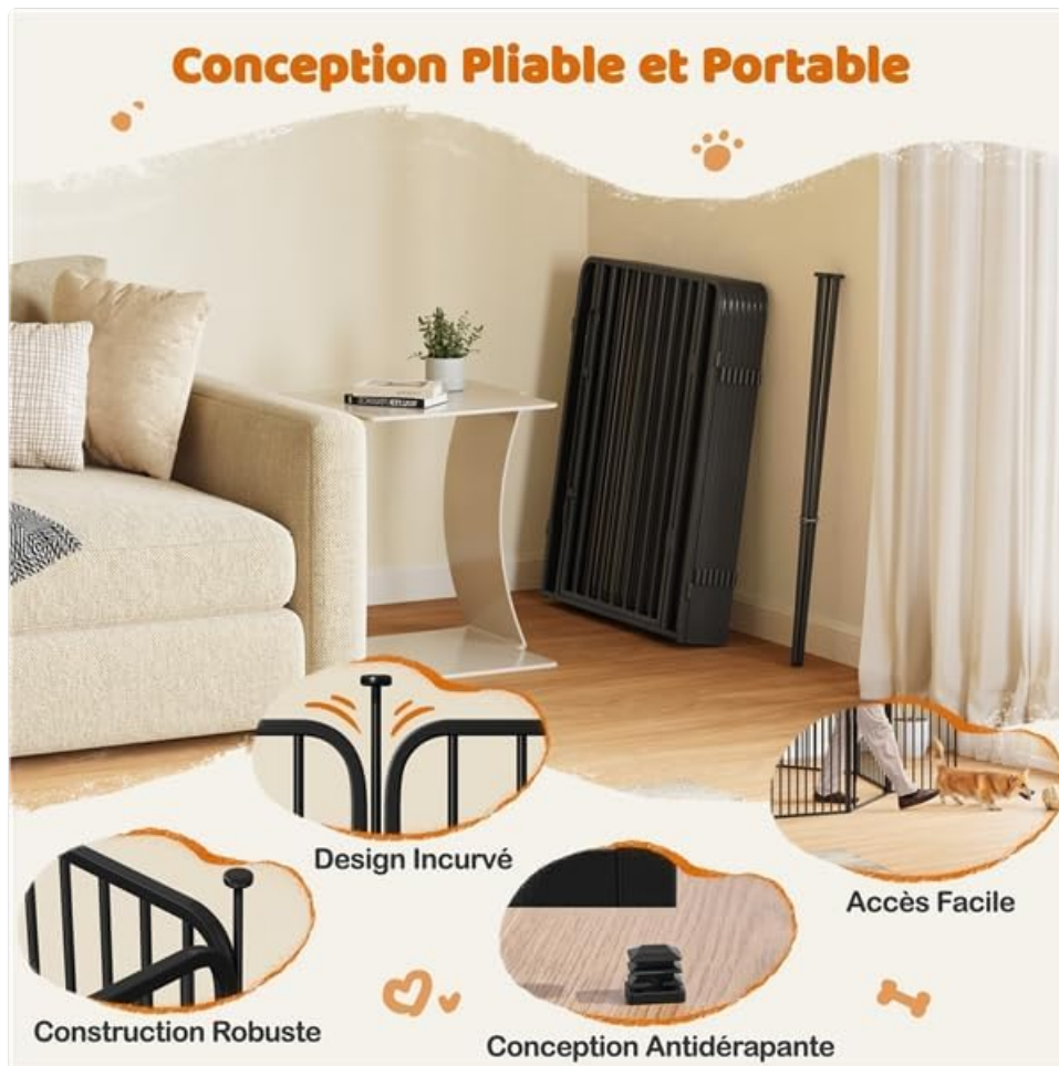
Figure 5: The playpen features a foldable and portable design, making it easy to store and transport. It also highlights robust construction, curved design for safety, anti-slip features, and easy access.