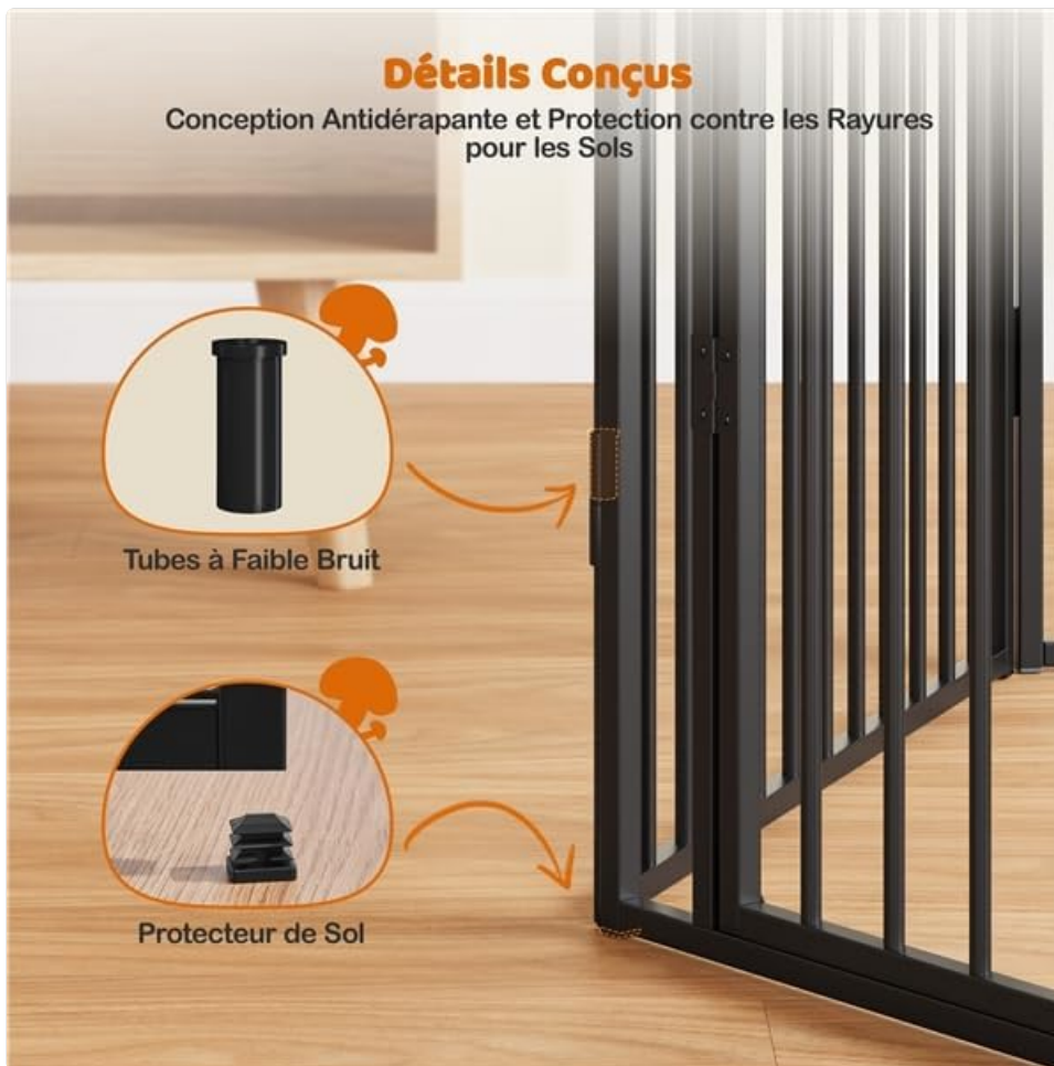
Figure 6: The playpen is designed with low-noise tubes and floor protectors to ensure quiet operation and prevent scratches on your floors.