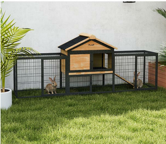
Image 8.1: Detail showing the robust construction with an asphalt roof for weather protection and a steel run box for security.