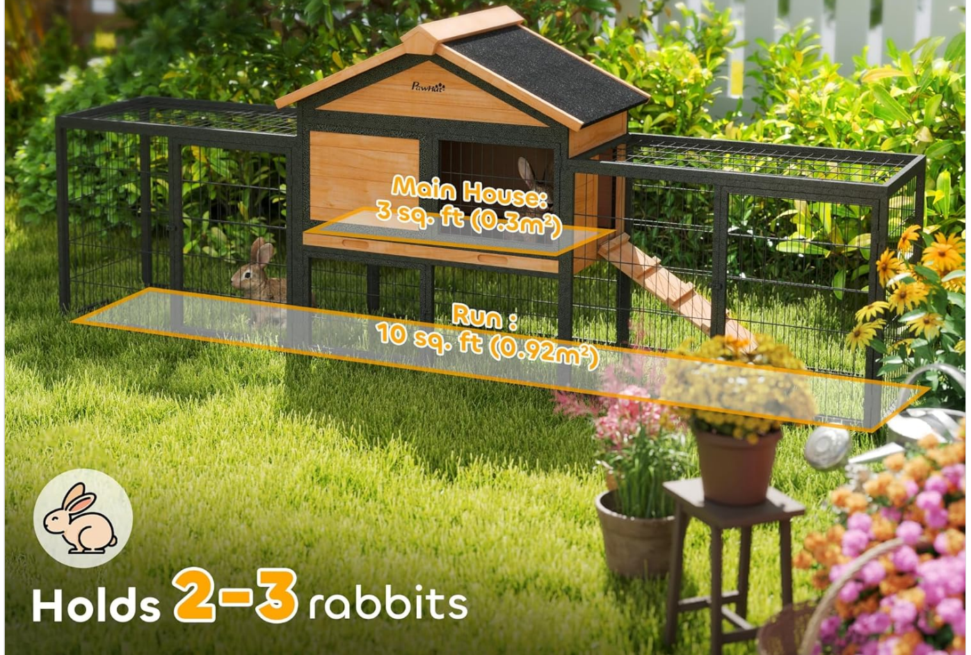
Image 4.2: Illustration of the spacious living area, indicating a 3 sq. ft. main house and a 10 sq. ft. run, suitable for 2-3 rabbits.

Large run for your pets to move freely and casually