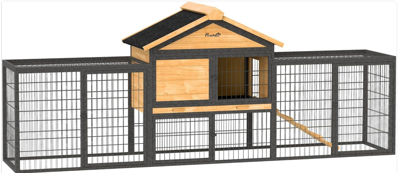
Image 1.1: Overall view of the PawHut 85-inch Outdoor Rabbit Hutch. This large wooden bunny cage features a main house and an extended steel run, designed for outdoor use.

Thank you for choosing the PawHut 85-inch Outdoor Rabbit Hutch. This manual provides essential information for the safe assembly, operation, and maintenance of your new pet enclosure. Please read these instructions carefully before use and retain them for future reference.