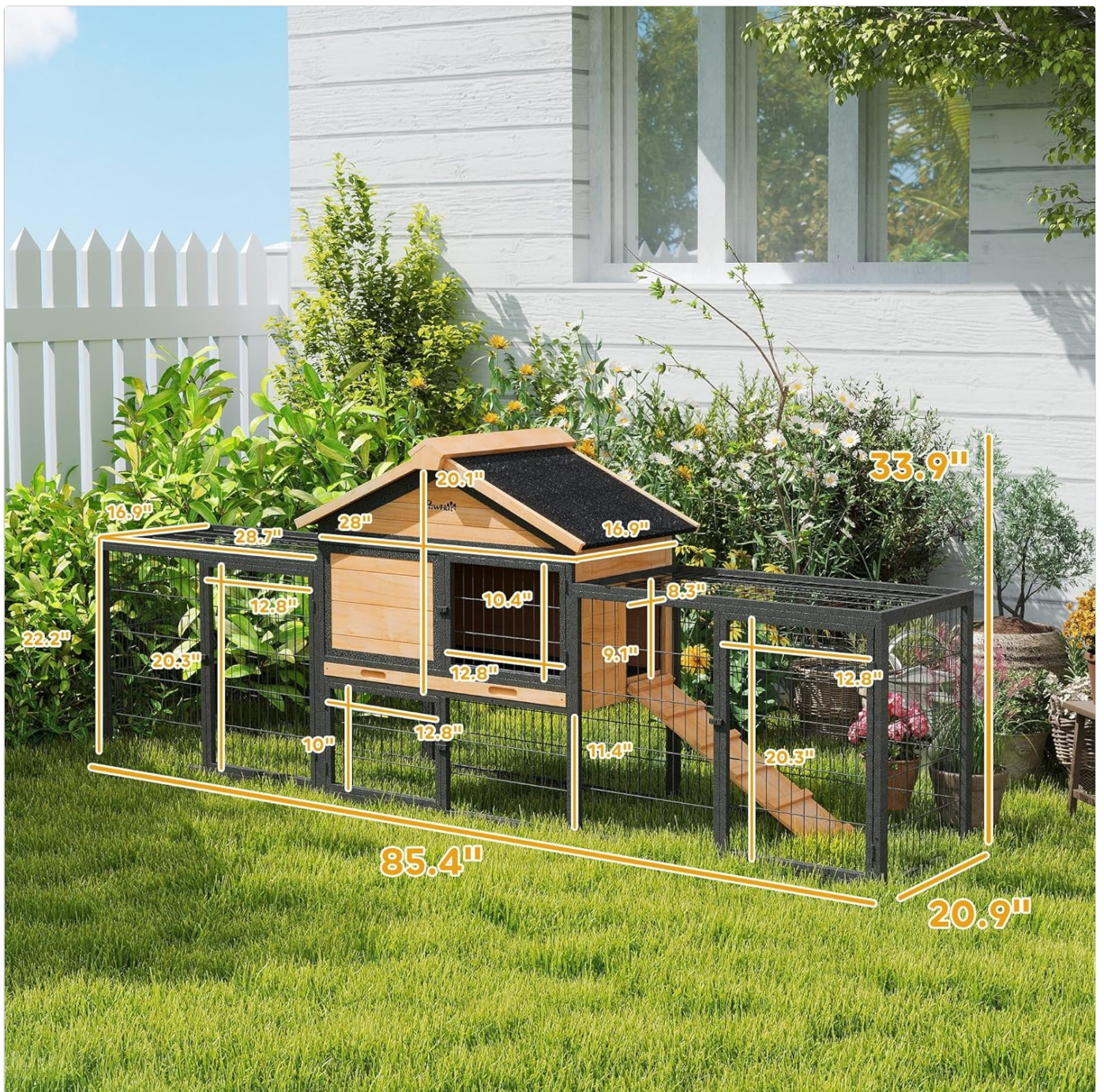
Image 4.1: Detailed dimensions of the hutch, showing overall length of 85.4 inches, width of 20.9 inches, and height of 33.9 inches.