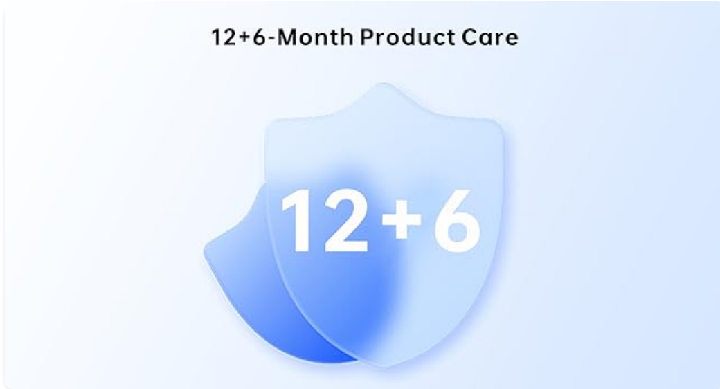
Image 8.1: Overview of ATOTOEXCEL product care and support options.

For support, please refer to the contact information provided with your product or visit the official ATOTOEXCEL website.