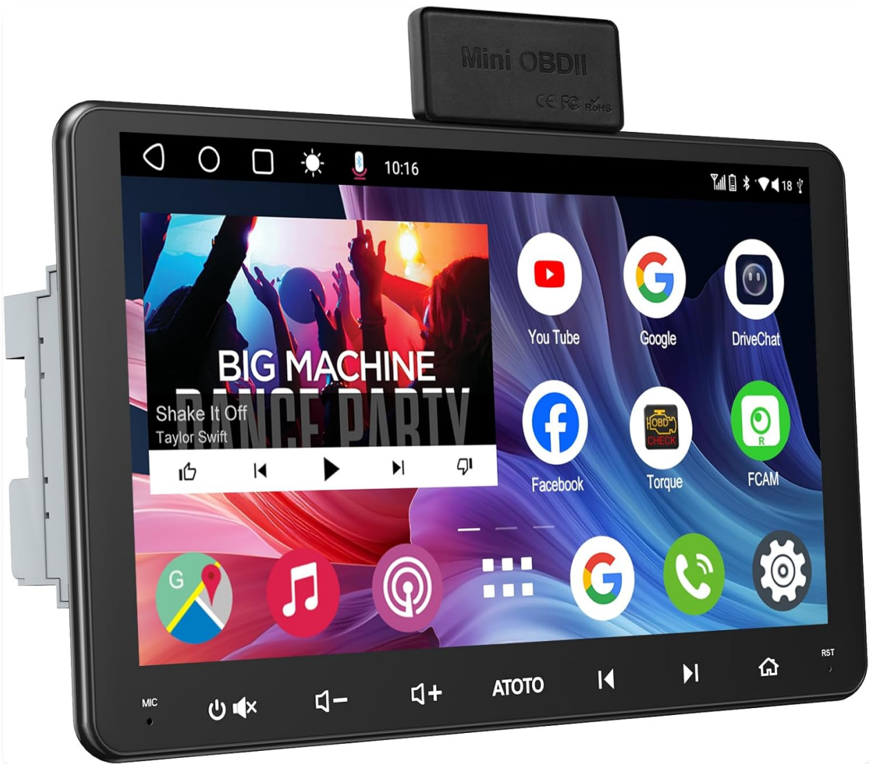
Image 1.1: Front view of the ATOTOEXCEL A6PF car stereo with its 9-inch display and included OBDII scanner.