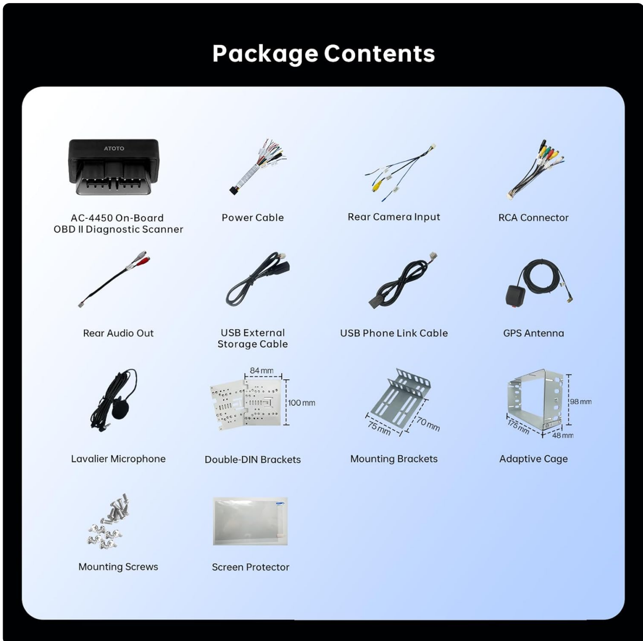
Image 2.1: Visual representation of the ATOTOEXCEL A6PF package contents.