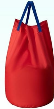
1 x Carrying Bag