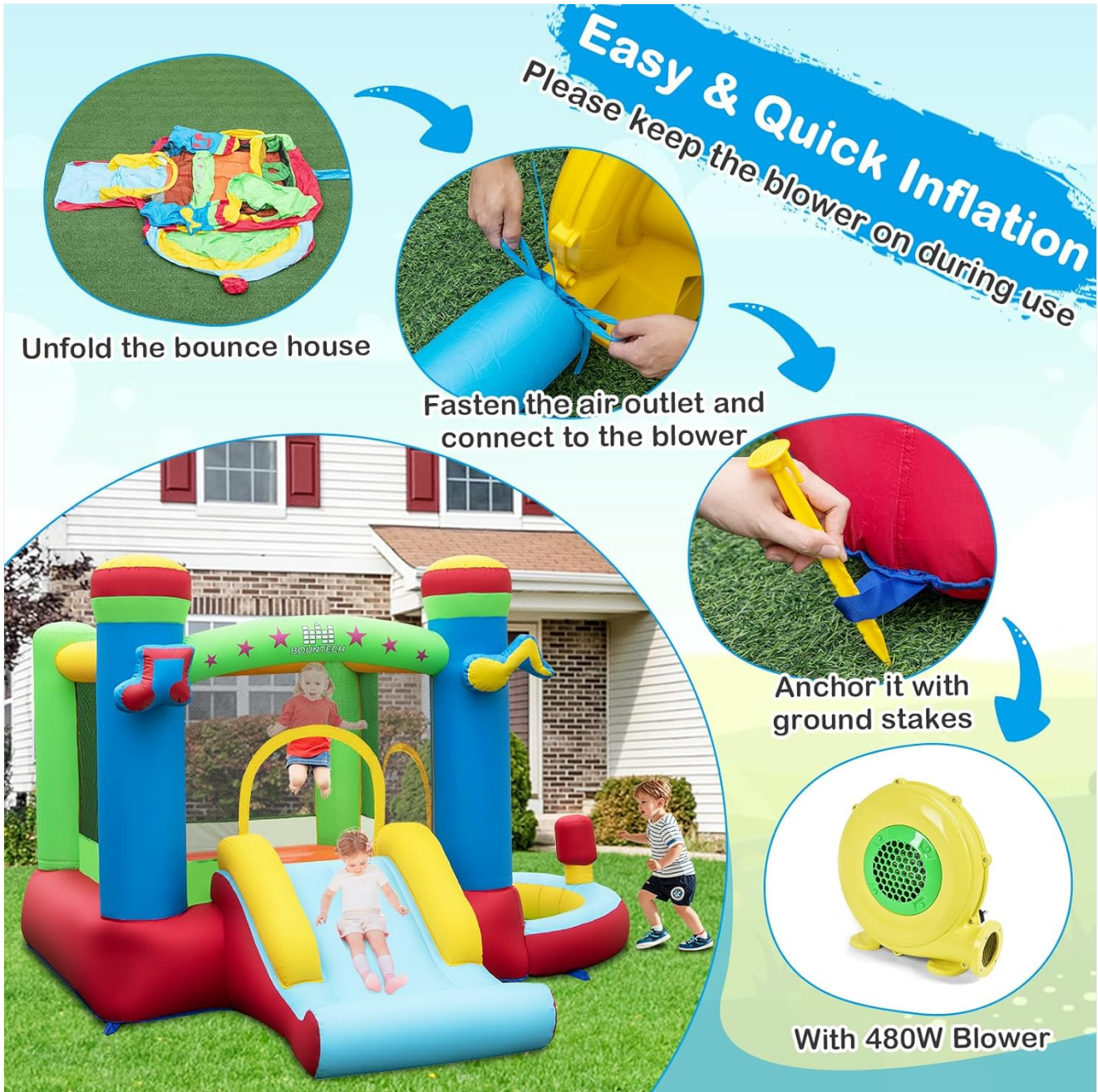
Image 3.1: Illustrated steps for setting up the bounce house, including unfolding, connecting the blower, and anchoring with ground stakes.

6. Once fully inflated, use the provided ground stakes to anchor the bounce house firmly to the ground. Use additional blower stakes for the blower if necessary.