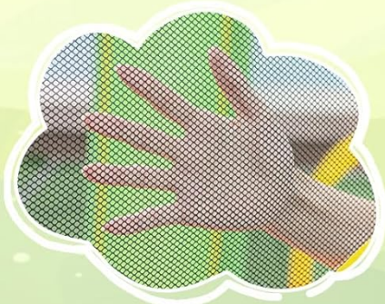
Mesh Protective Wall