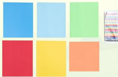
1 x Repair Kit