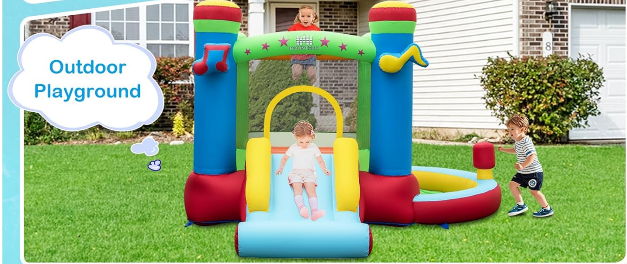
Image 1.1: The BOUNTECH Inflatable Music Castle Bounce House set up for play both indoors and outdoors.