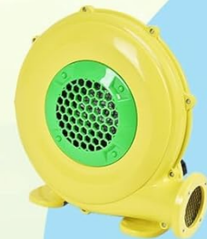
1 x 480W Air Blower