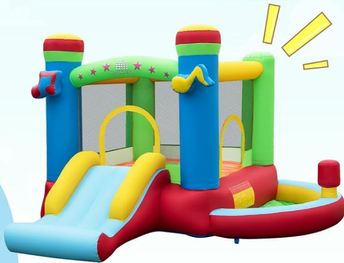
1 x Inflatable Bounce House