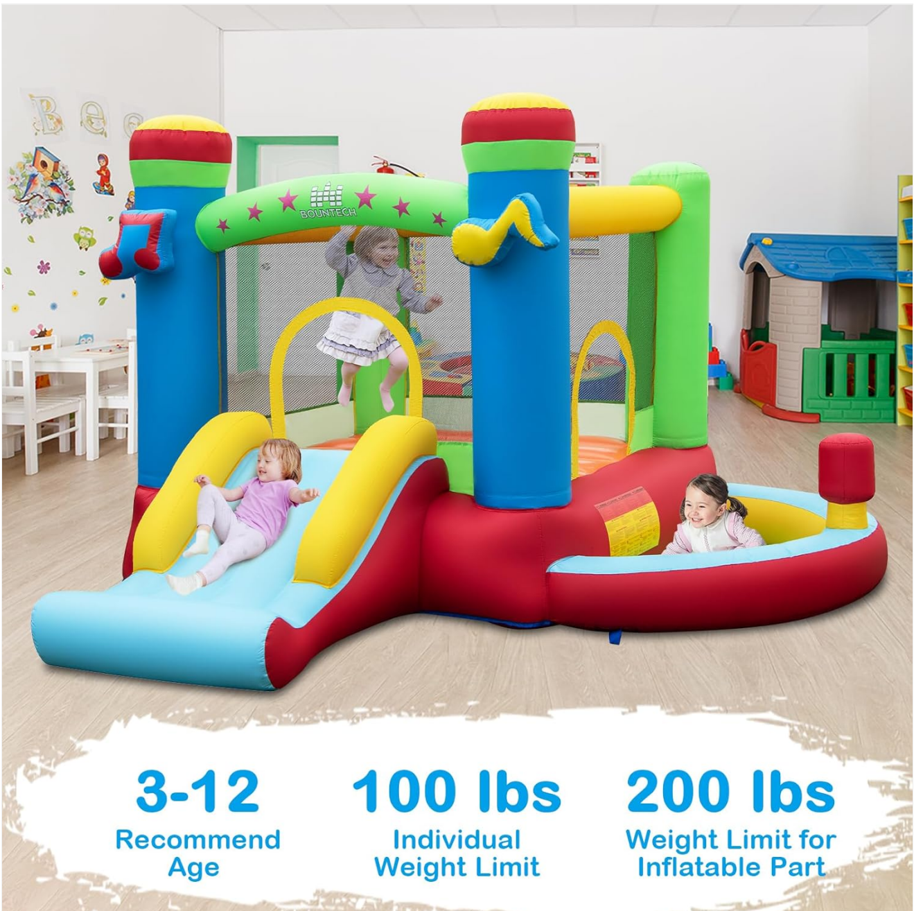
Image 2.1: Visual representation of recommended age (3-12 years), individual weight limit (100 lbs), and total weight limit (200 lbs) for the inflatable structure.