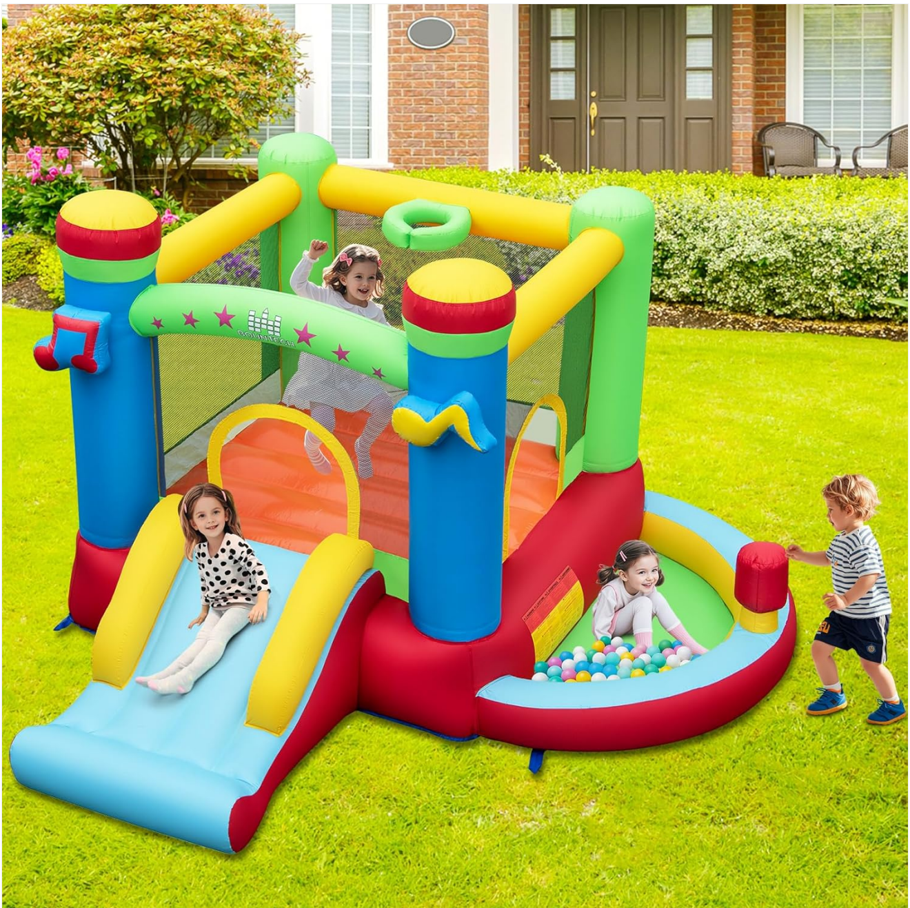
Image 1.2: Children enjoying the various features of the bounce house, including the slide, jumping area, and ball pit, in an outdoor setting.