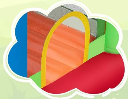
Accessible Climbing Door