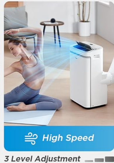
Figure 6: Tailor your cool with 3 fan speeds and modes.