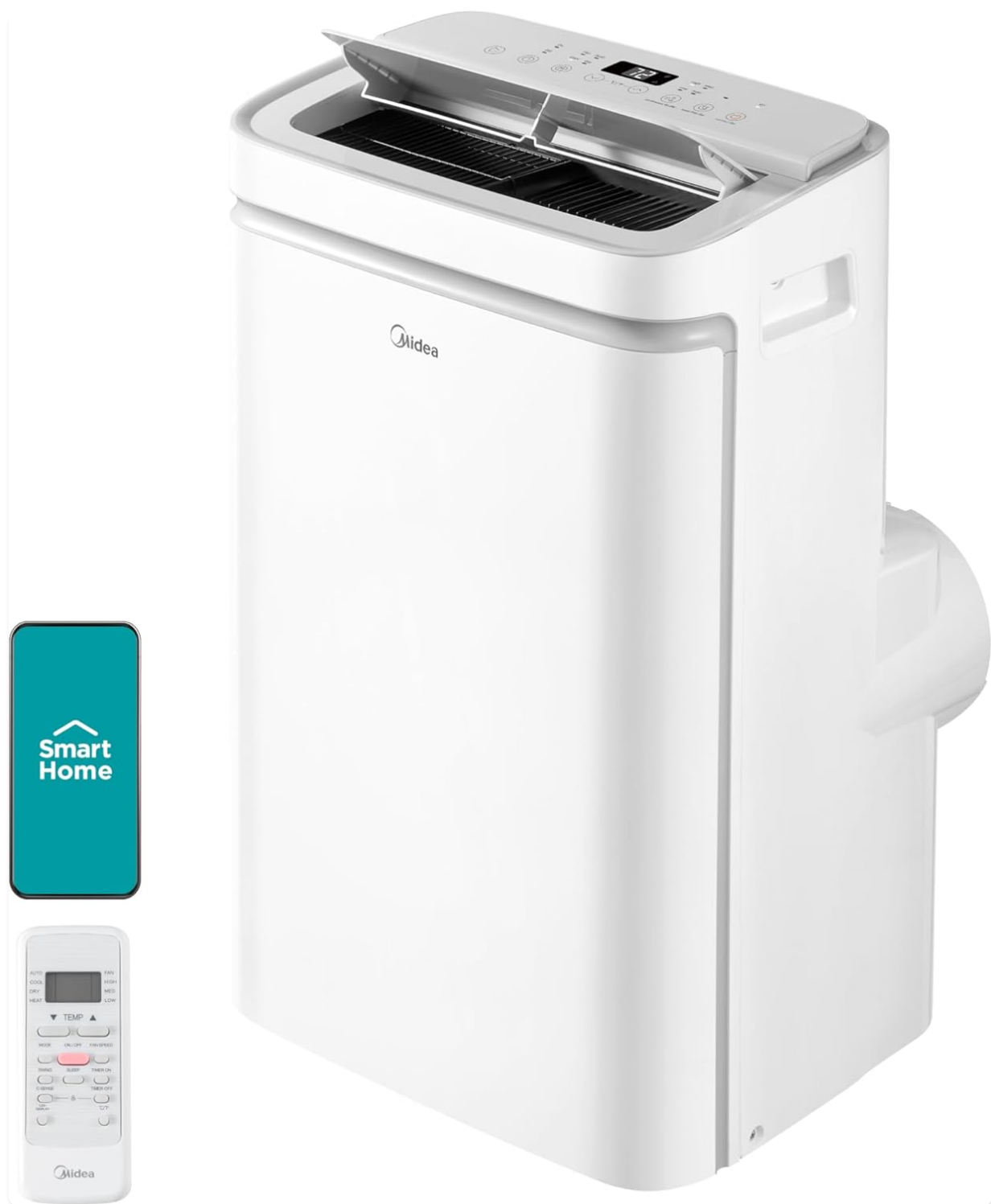
Figure 1: Midea 12,000 BTU Portable Air Conditioner with remote and app interface.