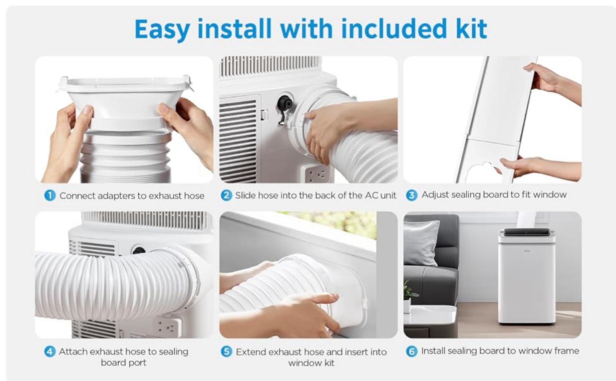
Figure 2: Step-by-step guide for window kit installation.

The unit is equipped with wheels for easy portability, allowing you to move it between rooms as needed. Ensure the unit is placed on a stable, level surface.