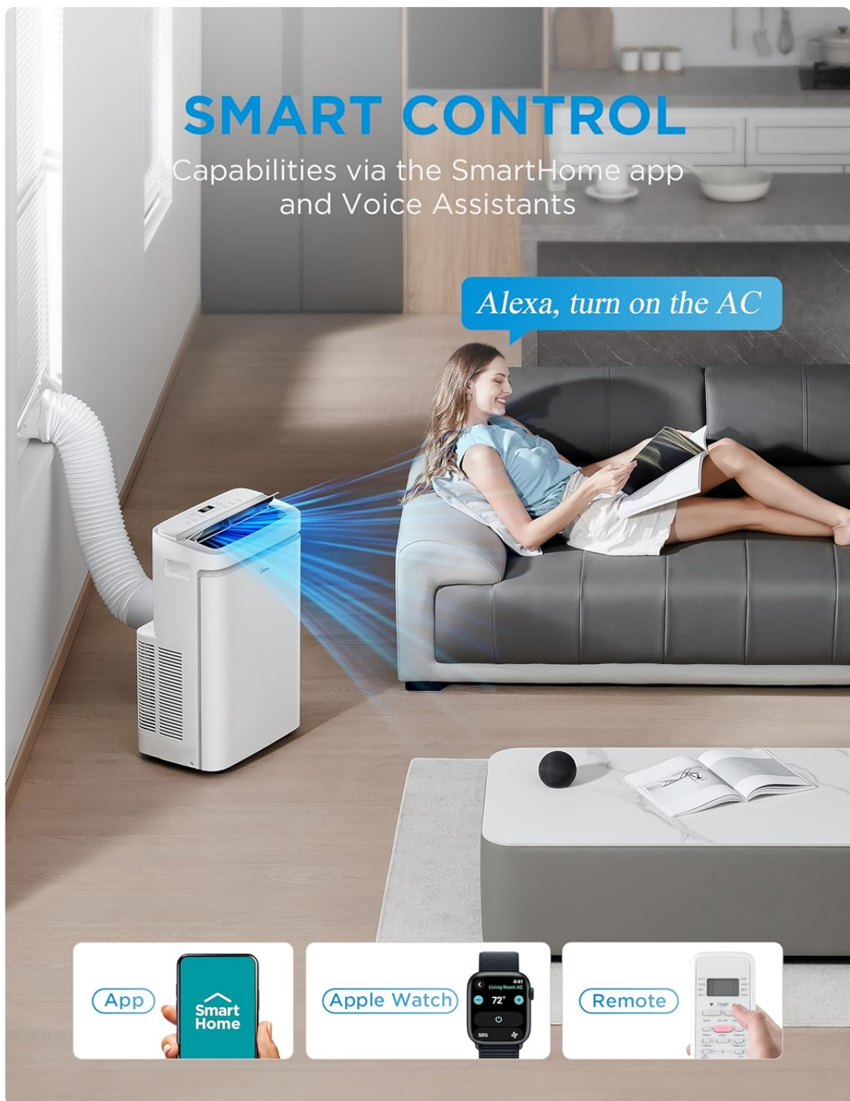
Figure 5: Smart control capabilities via the SmartHome app and voice assistants.