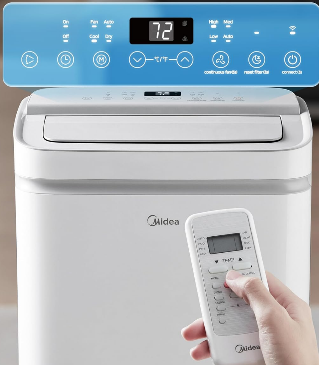
Figure 4: Digital control panel and remote for the unit.