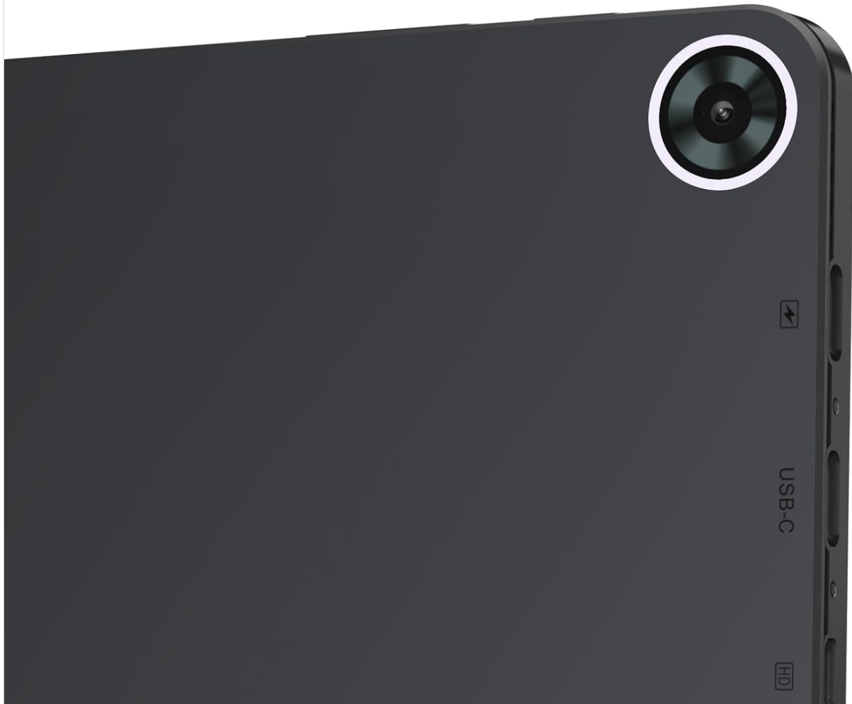
Figure 5: Detail of the 8MP AF rear camera.

フロントカメラ5MP、リアカメラ8MP、さらにAFモーターを搭載し、撮影時に自動的にフォーカスを調整し、鮮明で美しい画像を映し出します。