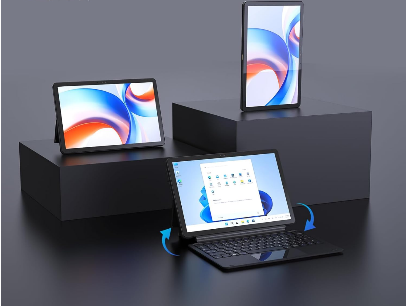
Figure 4: Automatic screen rotation and multi-mode usage enabled by gravity and magnetic sensors.

画面を回転させると360度自動的に調整され、ケースを閉じると画面がオフになります。