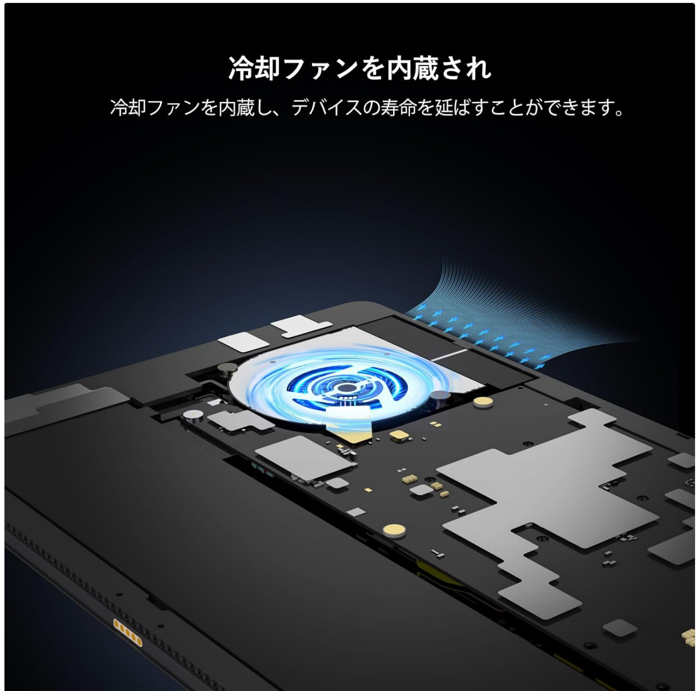
Figure 6: Internal cooling fan for optimal thermal management.

The Zwide SA11 features an internal cooling fan to manage heat and extend the device's lifespan. Ensure that the ventilation openings are not obstructed during use to allow for proper airflow.