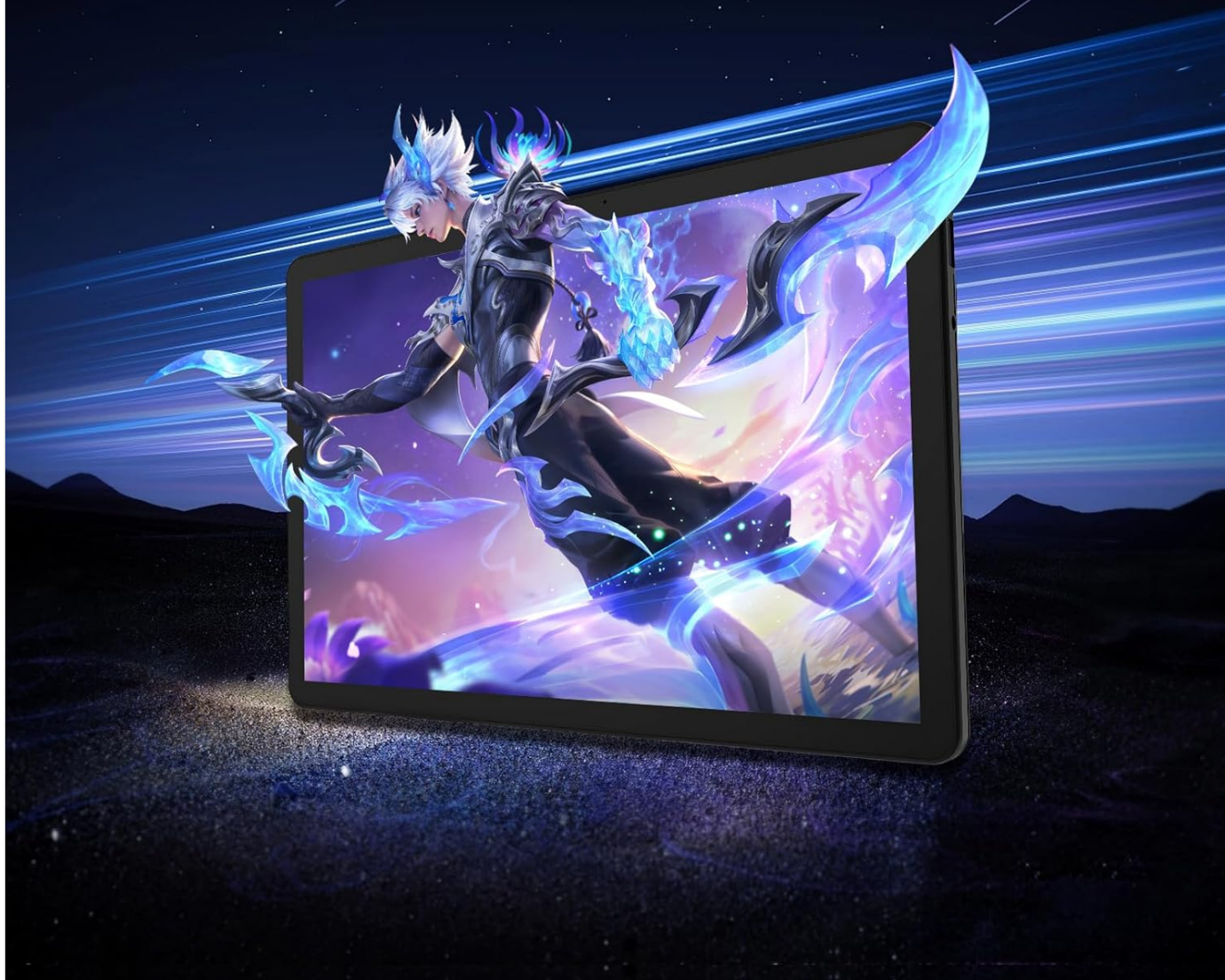
Figure 8: High-resolution display for immersive viewing and multitasking.