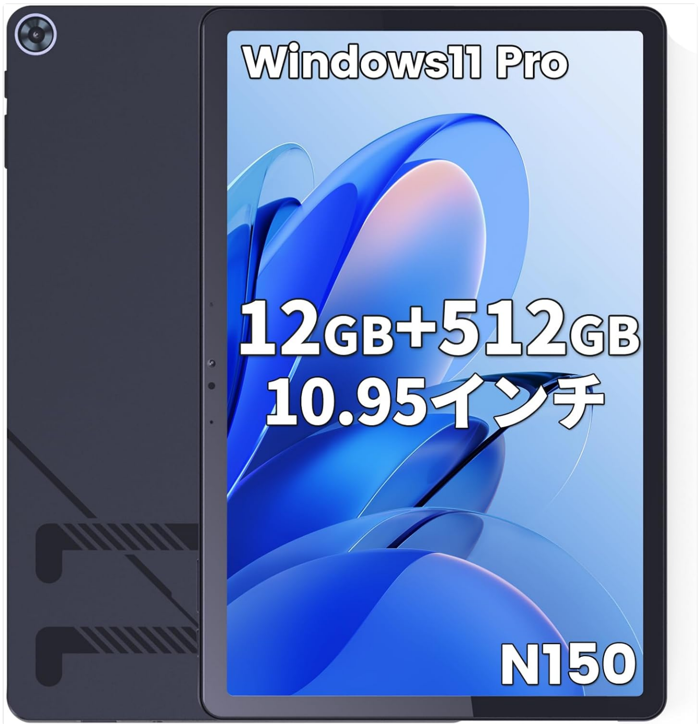
Figure 1: Zwide SA11 Tablet PC showcasing its key specifications on the screen.