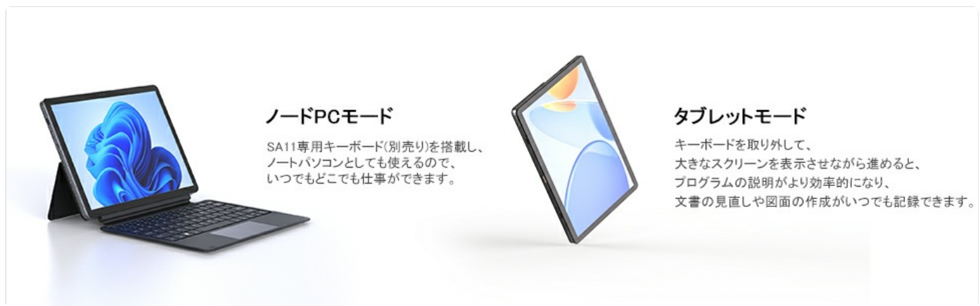
Figure 3: Zwide SA11 in PC Mode (left) and Tablet Mode (right).