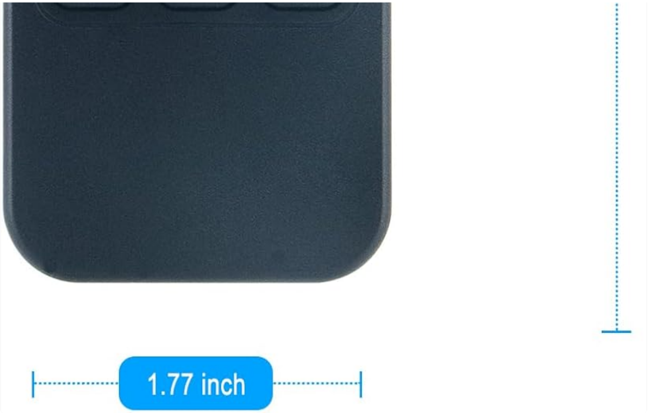
Figure 7.1: Remote control dimensions.