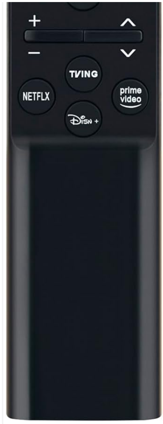
Image: Front view of the ZdalaMit replacement remote control, featuring a sleek black design with clearly labeled buttons for power, settings, navigation, volume, channel, and dedicated streaming service access.