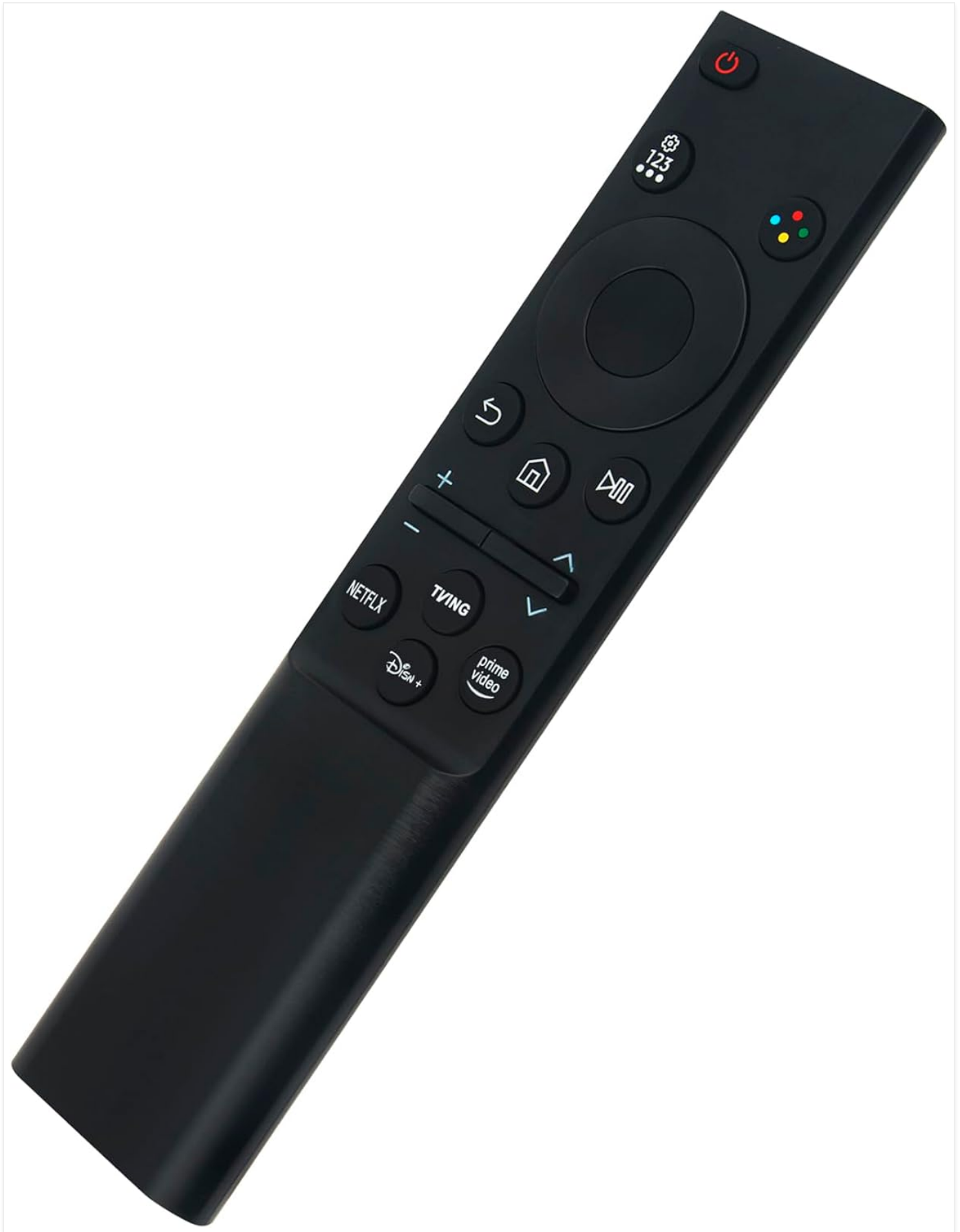
Image: An angled view of the ZdalaMit replacement remote control, highlighting its ergonomic design and the placement of the battery compartment on the underside.

Note: Batteries are not included with the remote control.