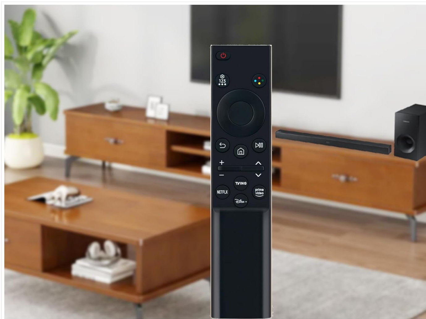
Image: The ZdalaMit replacement remote control displayed prominently in a modern living room setting, positioned in front of a television and entertainment console, illustrating its intended use environment.