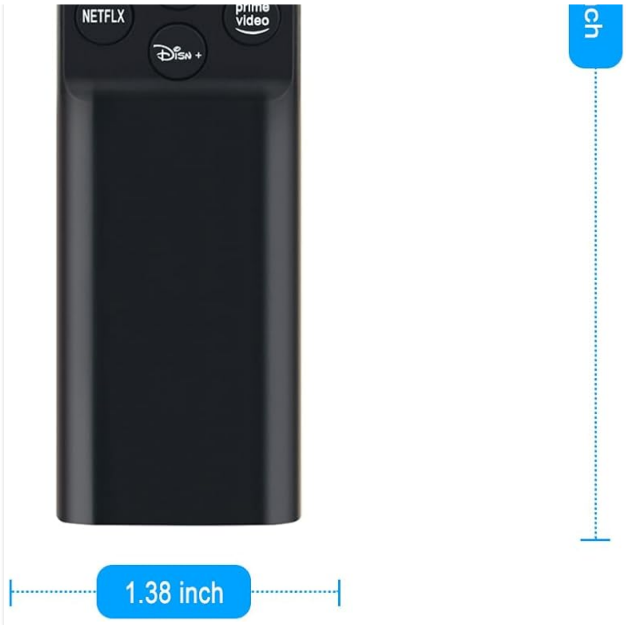
Image: The ZdalaMit replacement remote control shown with its approximate dimensions: 6.3 inches in length and 1.38 inches in width, providing a clear visual reference for its size.