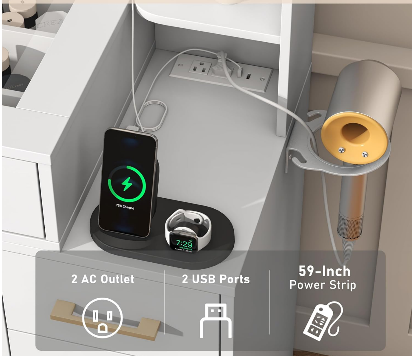
Figure 3: The integrated charging station provides convenient power access for electronic devices and styling tools.

Conveniently provide power for phones and hair dryers