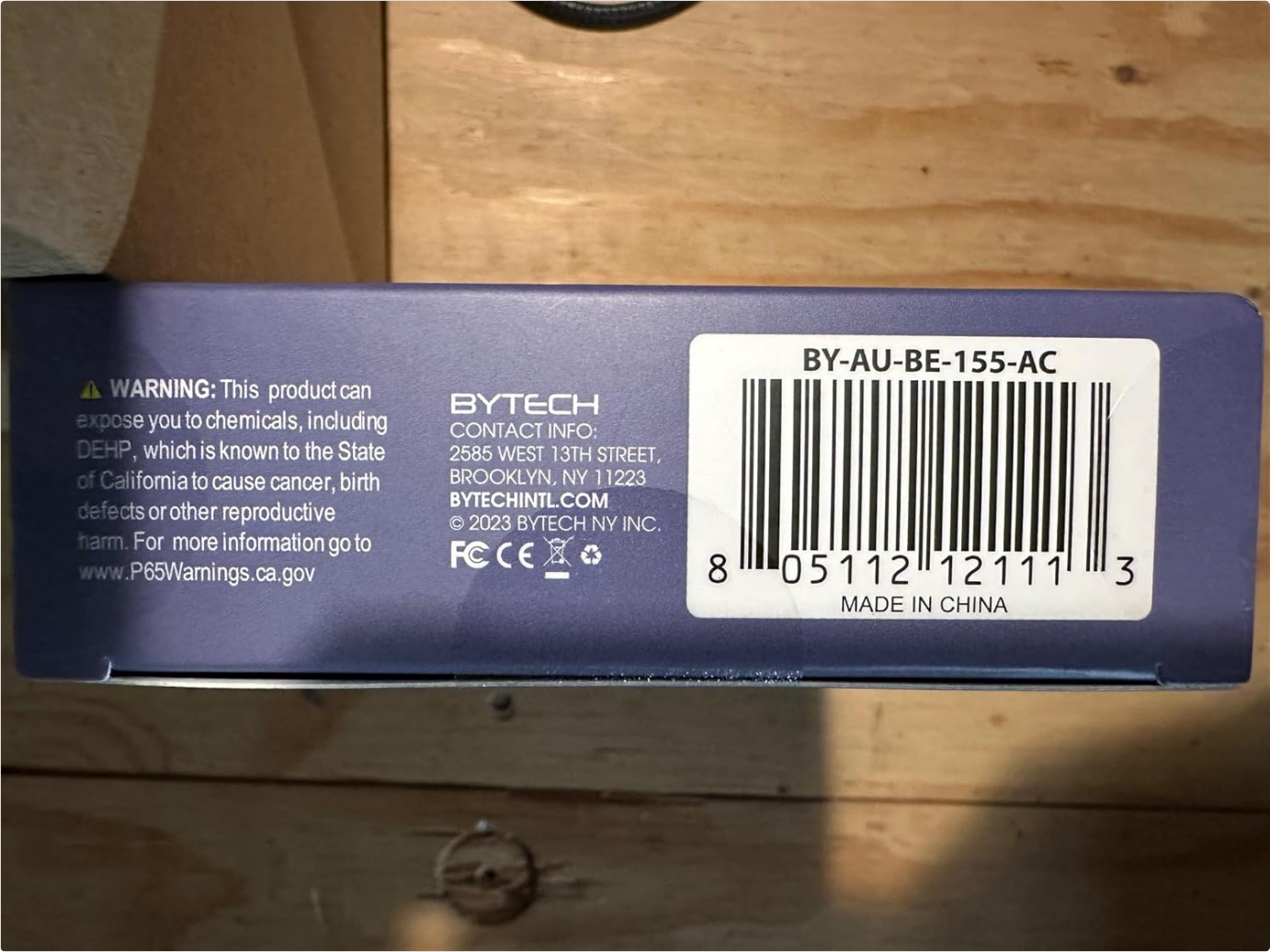
Image: The side of the BYTECH True Wireless Earbuds packaging, displaying the model number BY-AU-BE-155-AC, UPC 0805112121113, and manufacturer contact information.