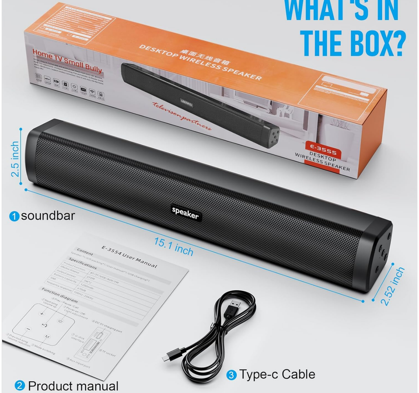
Image: The product box contents laid out, showing the soundbar, a product manual, and a Type-C charging cable.