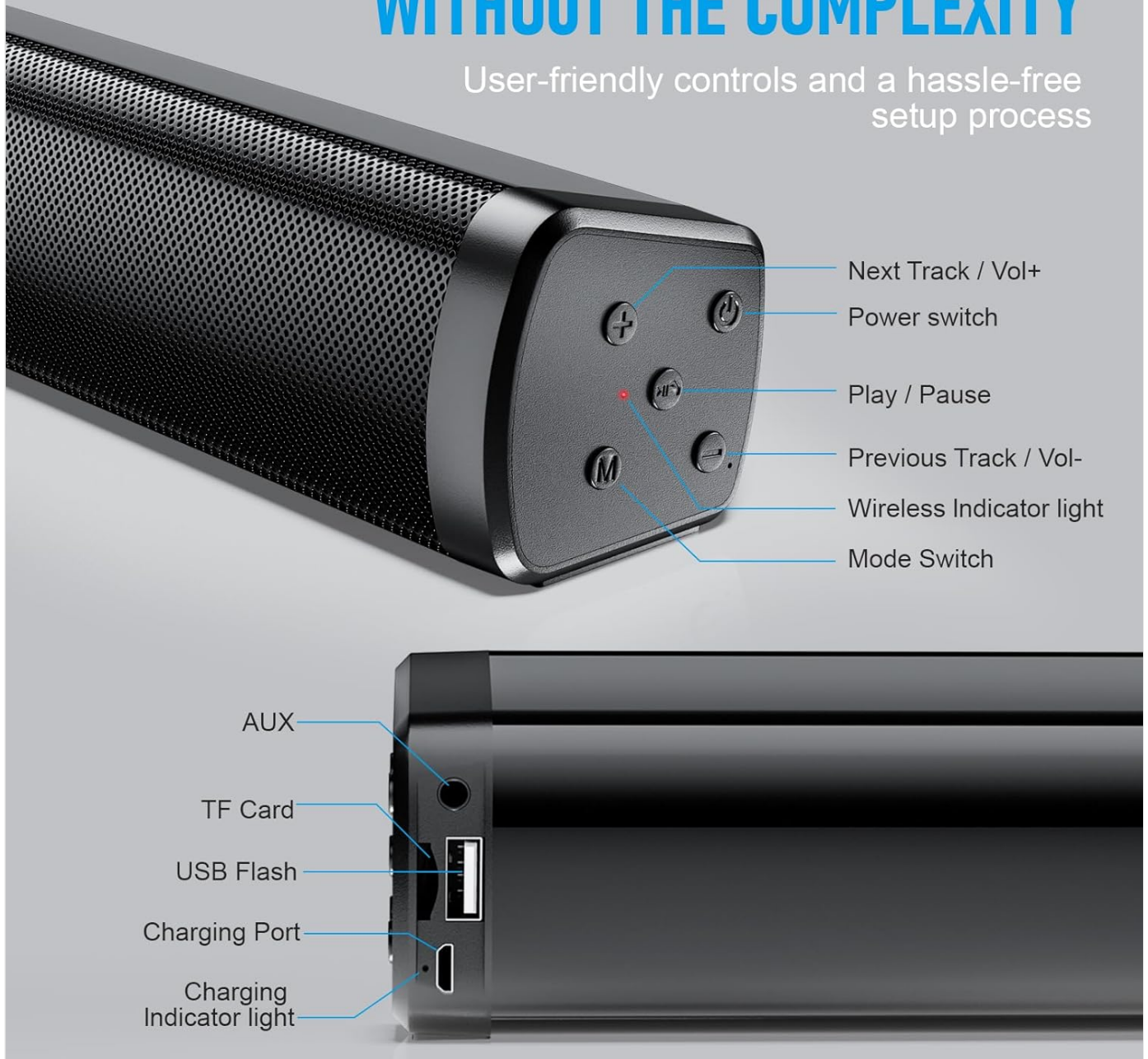
Image: Close-up of the speaker's right side showing control buttons (Next Track/Vol+, Power switch, Play/Pause, Previous Track/Vol-, Wireless Indicator light, Mode Switch) and the left side showing input ports (AUX, TF Card, USB Flash, Charging Port, Charging Indicator light).

User-friendly controls and a hassle-free setup process