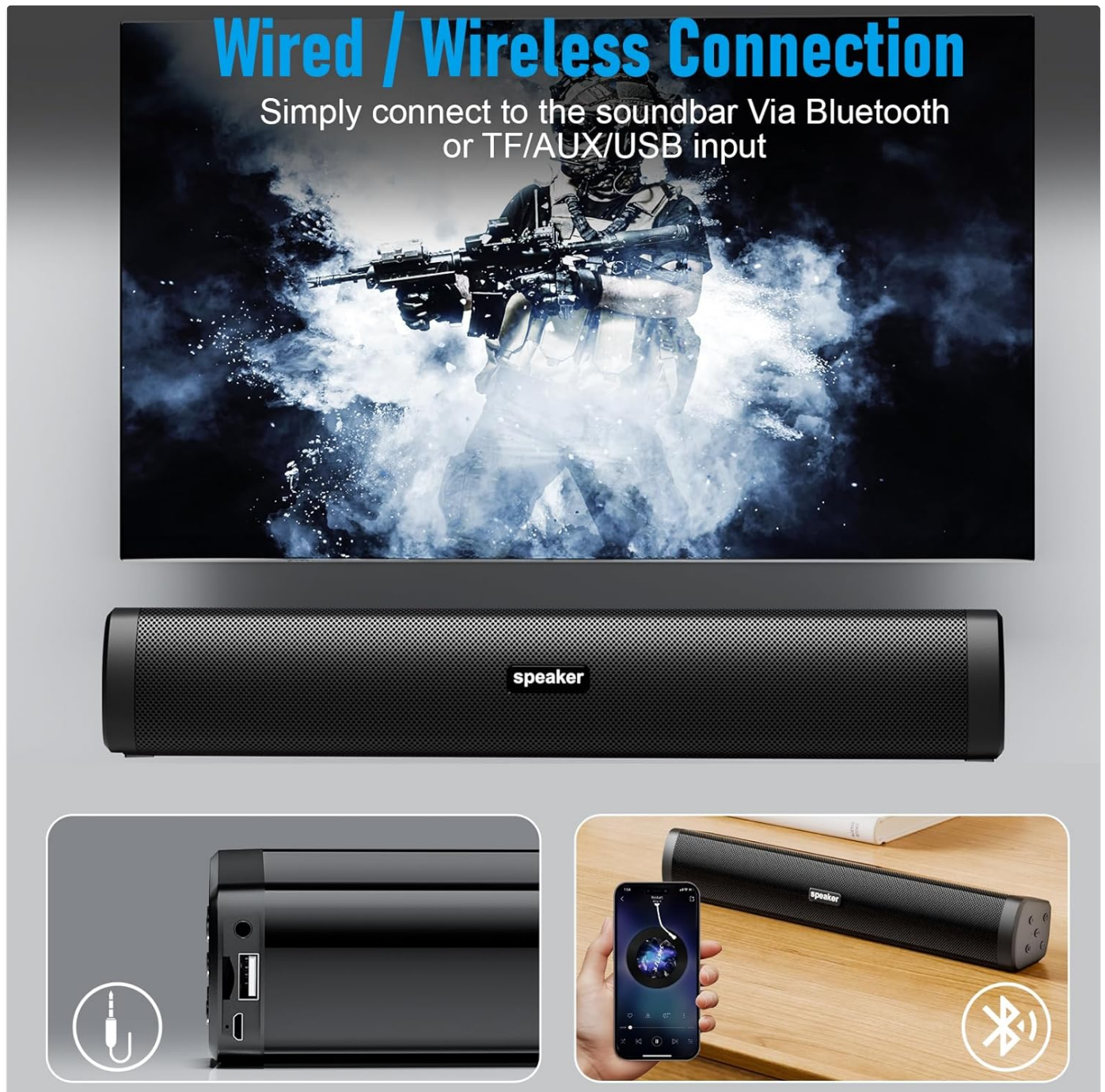
Image: Illustration demonstrating how to connect the soundbar via Bluetooth or wired inputs like AUX and USB.