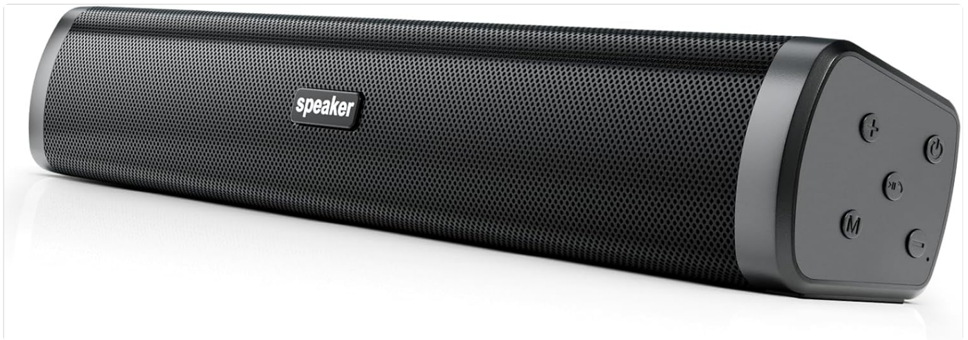
Image: Front view of the OOYY Portable Bluetooth Speaker, showcasing its sleek black design and speaker grille.

Thank you for purchasing the OOYY Portable Bluetooth Speaker. This device is designed to provide high-quality audio for various applications, including home entertainment, parties, and outdoor activities. With its versatile connectivity options and powerful sound output, it enhances your audio experience. This manual provides detailed instructions on setting up, operating, maintaining, and troubleshooting your speaker.