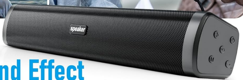
Image: Visual representation of four distinct sound modes: Music, 3D, Movie, and News, each optimized for specific audio content. Refer to the product's specific controls or remote (if applicable) to switch between these modes for the best listening experience.