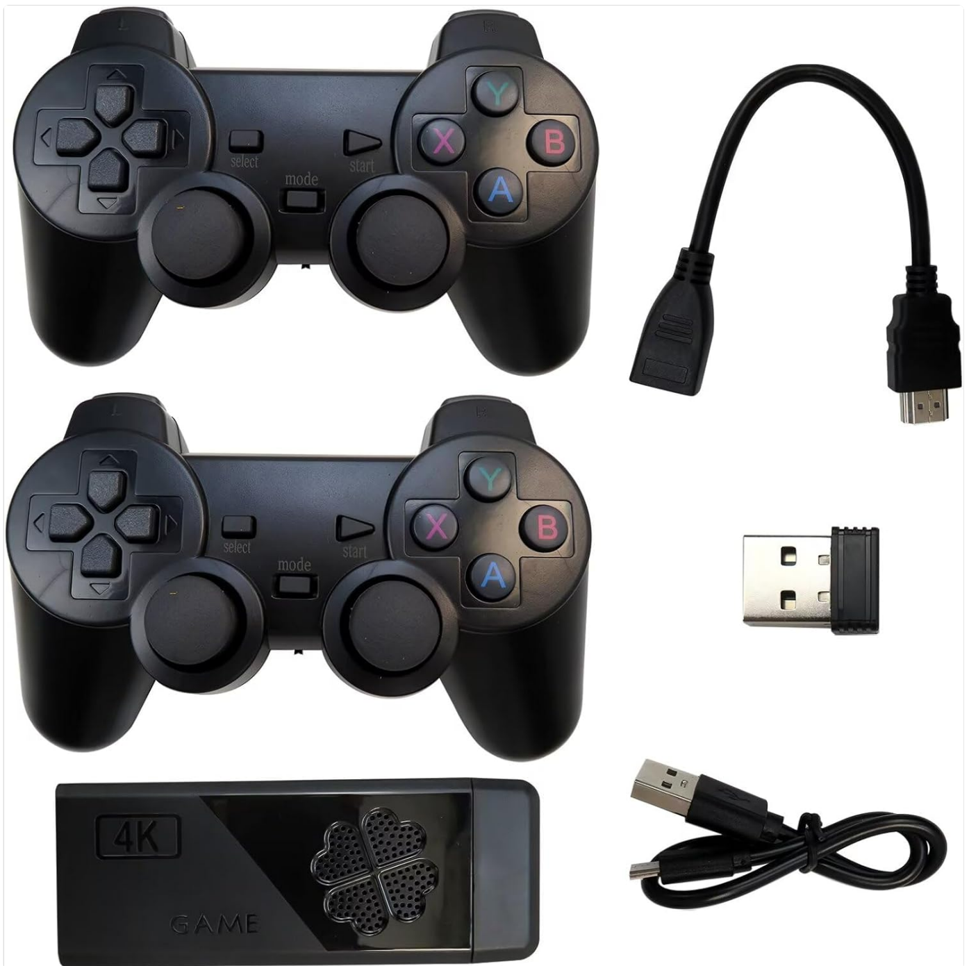
Figure 1: All components included in the package.