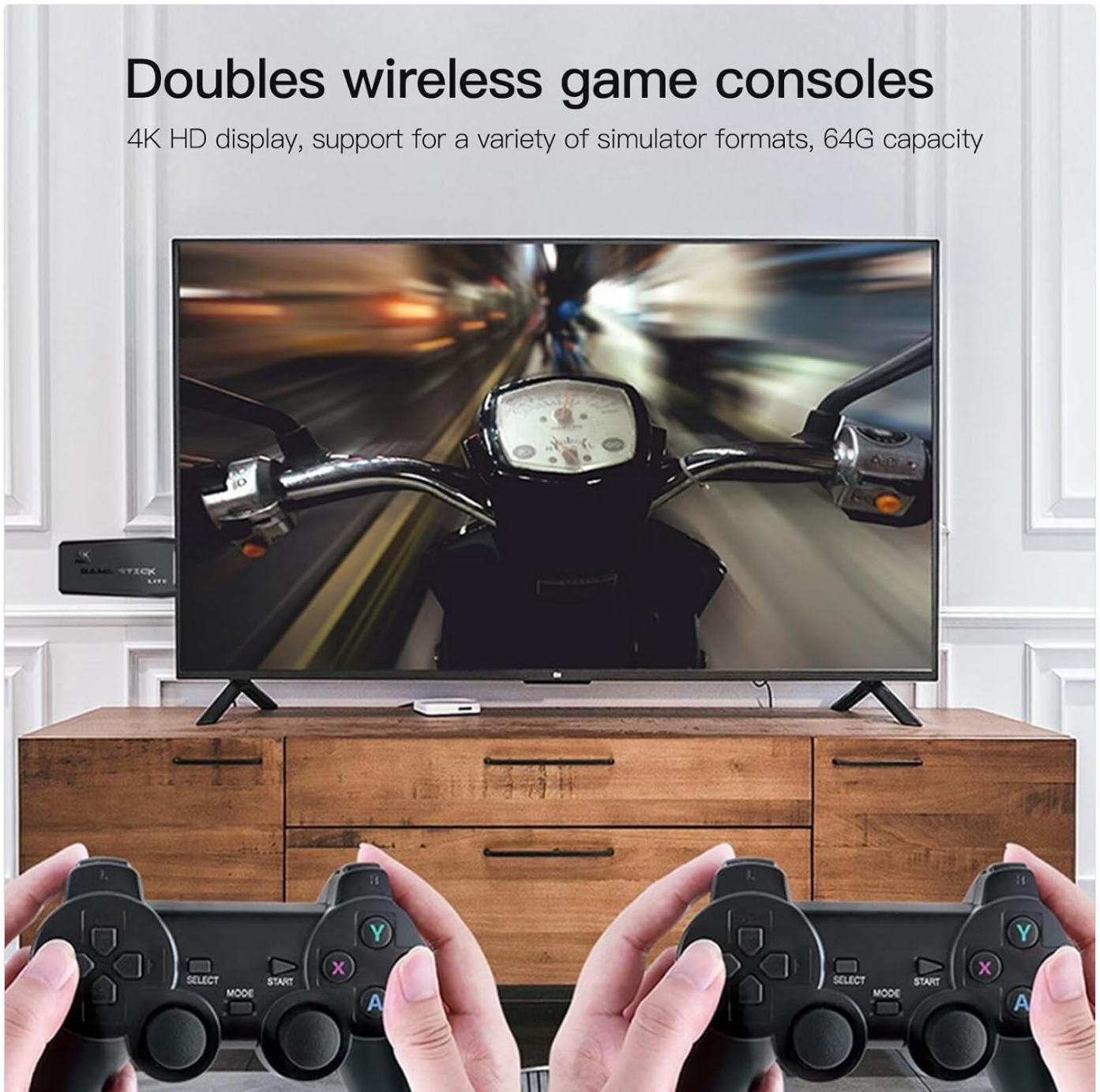
Figure 4: Console connected to TV with wireless controllers.