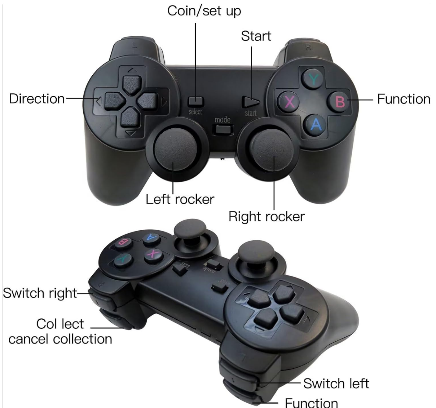
Figure 3: Wireless Controller Layout.

Directional Pad: For movement and menu navigation.