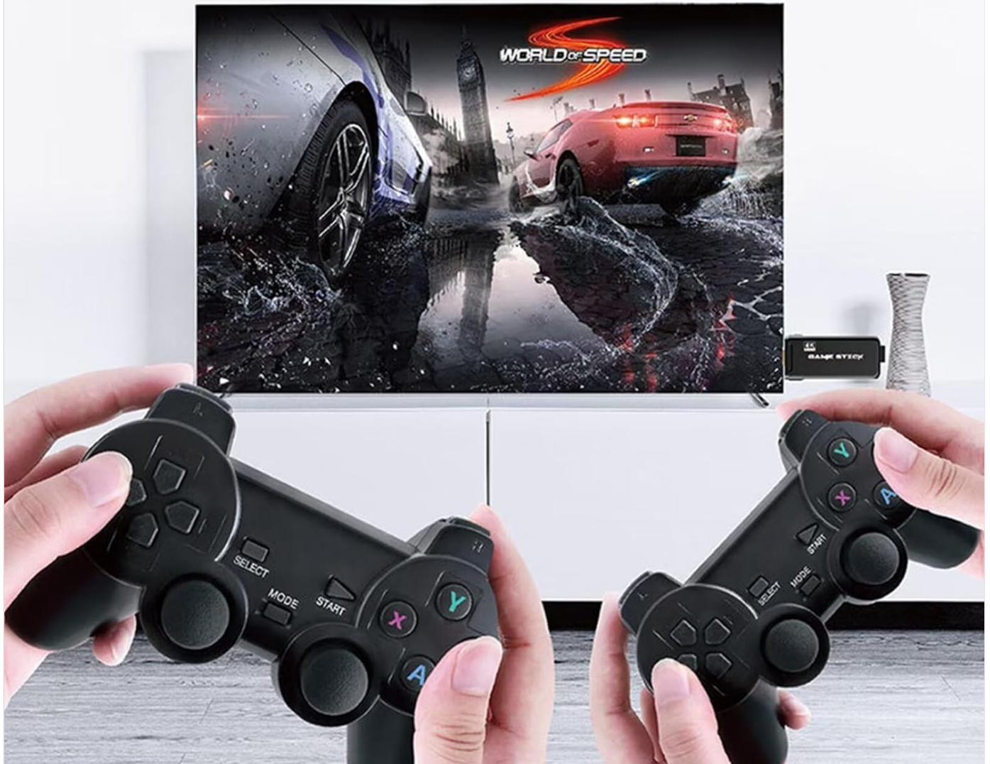
Figure 5: Enjoying multiplayer gaming with the console.

Double battle, double happiness, can with children, friends, family, together through customs, memories of a beautiful childhood