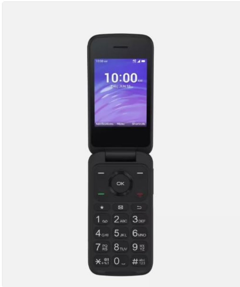
Image: TCL Classic 4058W Flip Phone, open view, displaying the main screen and physical keypad.