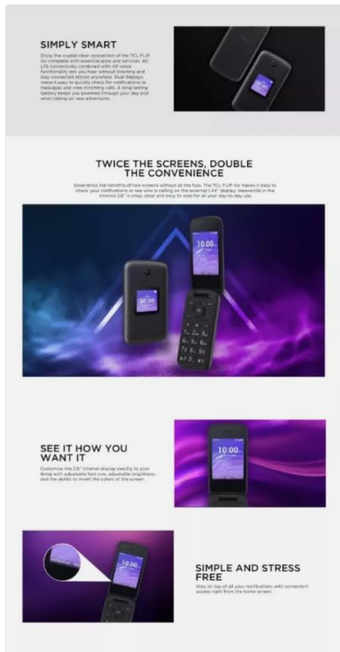
Image: The back of the TCL Classic 4058W flip phone, featuring a textured finish and the TCL brand logo.