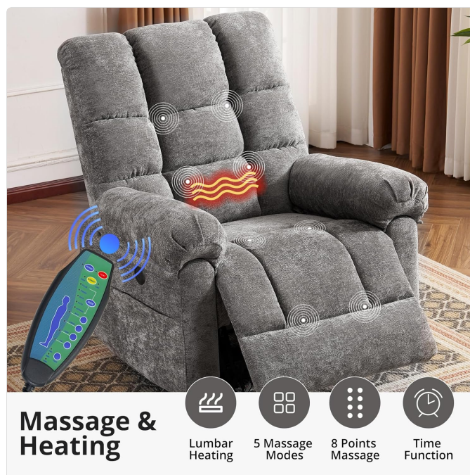
Figure 5.1: The remote control for activating and adjusting the massage and heating functions, along with power and intensity settings.

Your browser does not support the video tag.