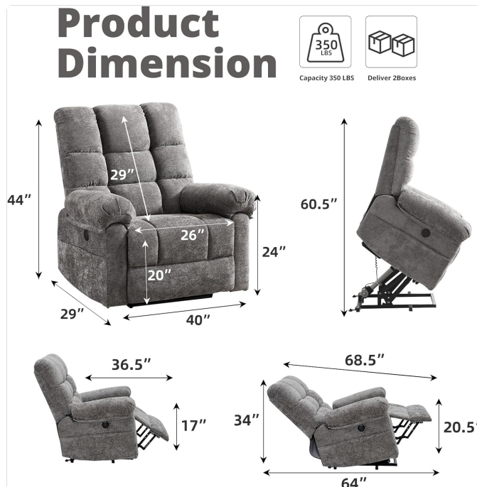
Figure 8.1: Detailed product dimensions of the Rhevoy Power Lift Recliner Chair.