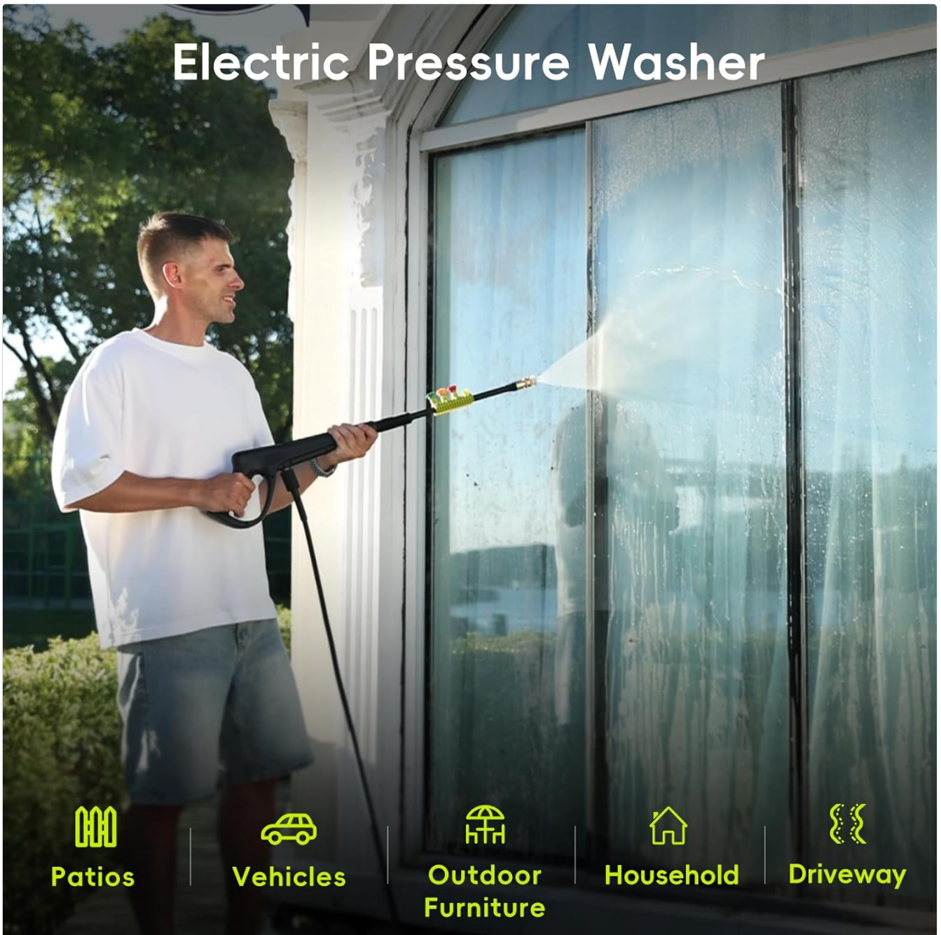
Image: A man using the pressure washer to clean a large glass door, demonstrating its use for household and patio cleaning.