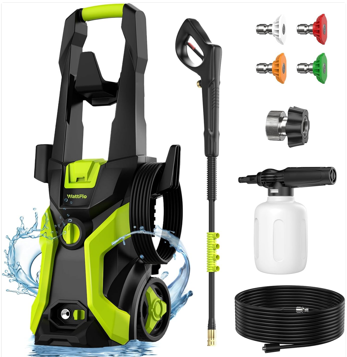
Image: The WattFlo Electric Pressure Washer unit shown with its main accessories, including the spray gun, high-pressure hose, foam