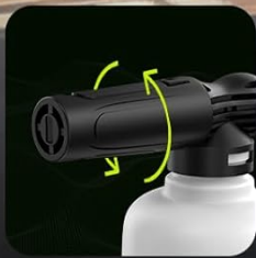
Adjustable Spray Angle