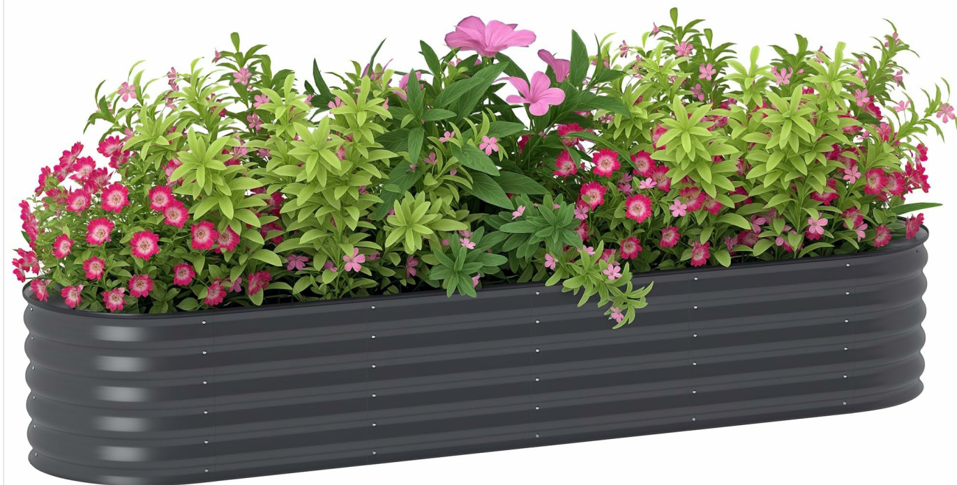
Image 1.1: Fully assembled Outsunny Galvanized Raised Garden Bed Kit.