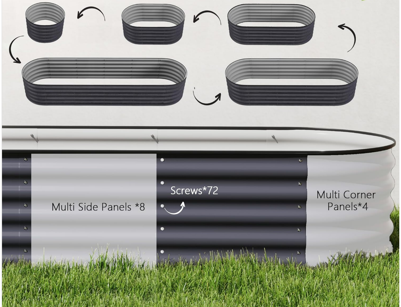
Image 3.1: Illustration of modular panels and included screws for assembly.

You can assemble different shape based on your need.