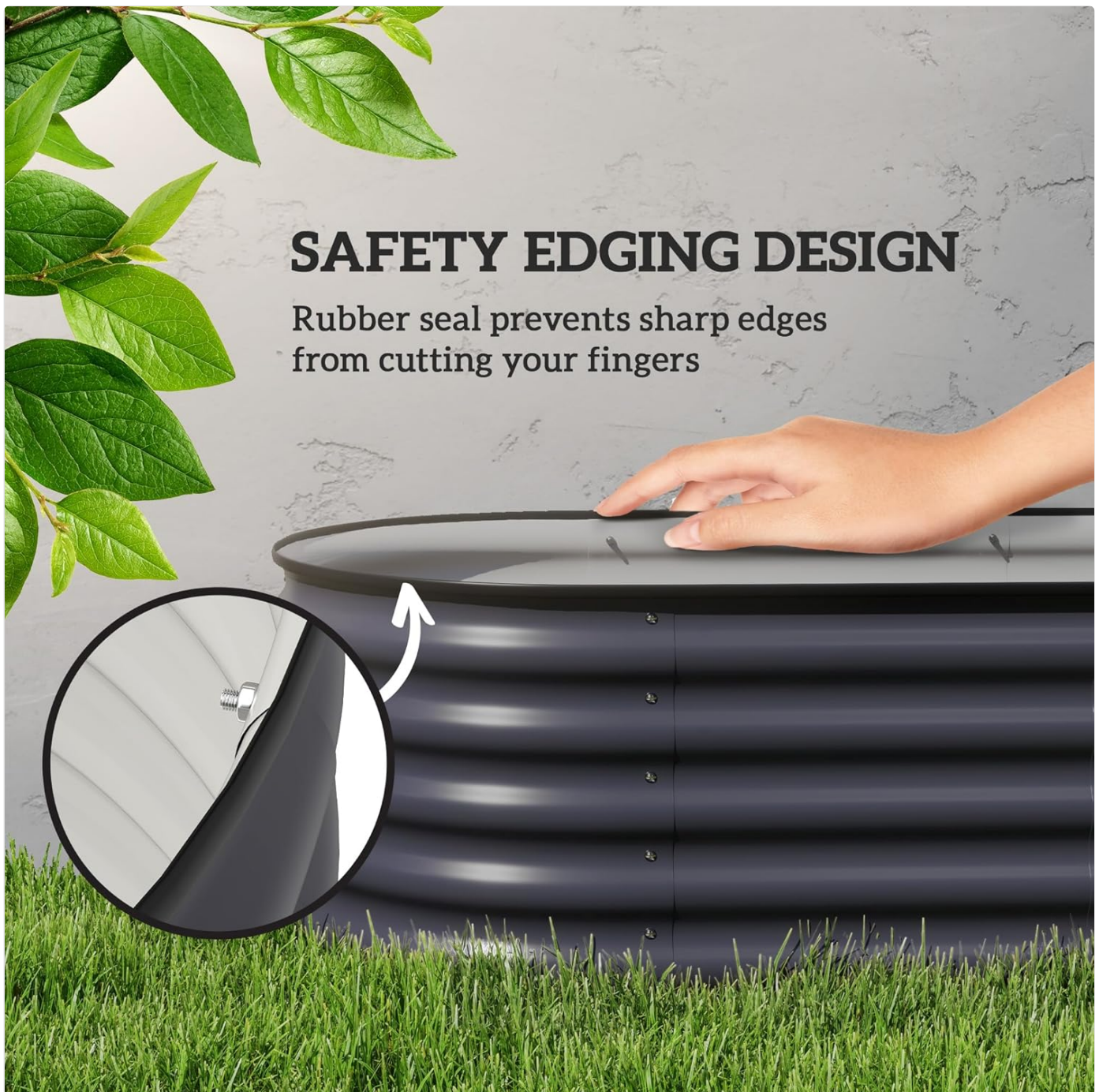
Image 2.1: Detail of the protective rubber seal on the top edge for safety.