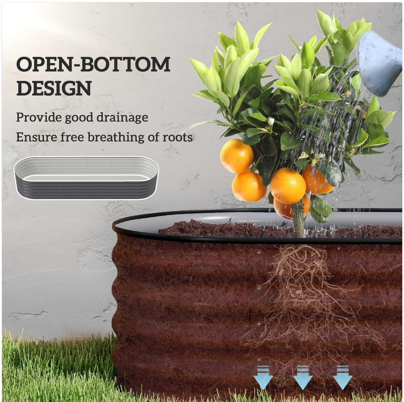
Image 5.1: The open-bottom design ensures good drainage and root growth.

5. Watering: Water regularly, especially during dry periods. The open-bottom design aids in preventing waterlogging.