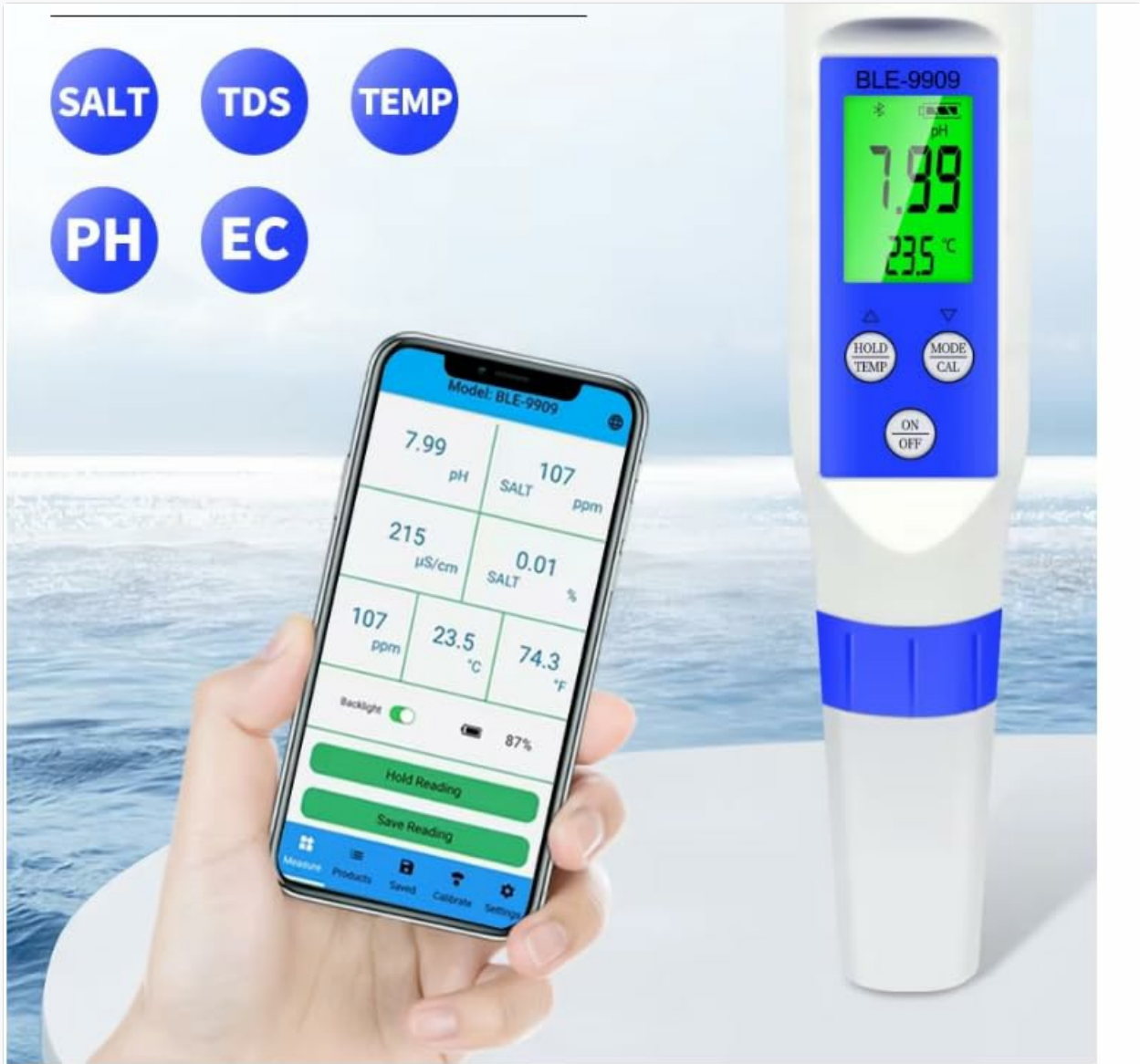
Figure 5: The BLE-9909 meter connected to its mobile application, showing real-time data.