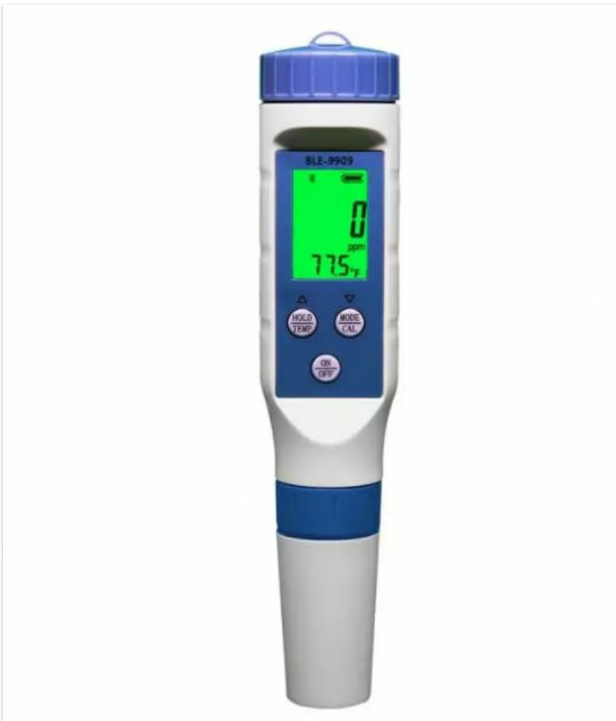
Figure 1: Front view of the VIHELM BLE-9909 PH Meter, displaying its screen and control buttons.