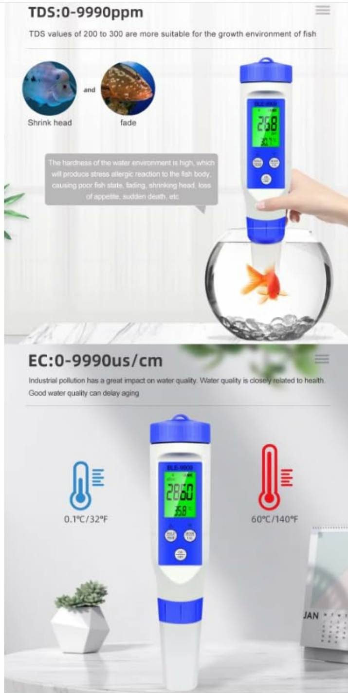
Figure 8: Examples of suitable applications for the BLE-9909 meter.