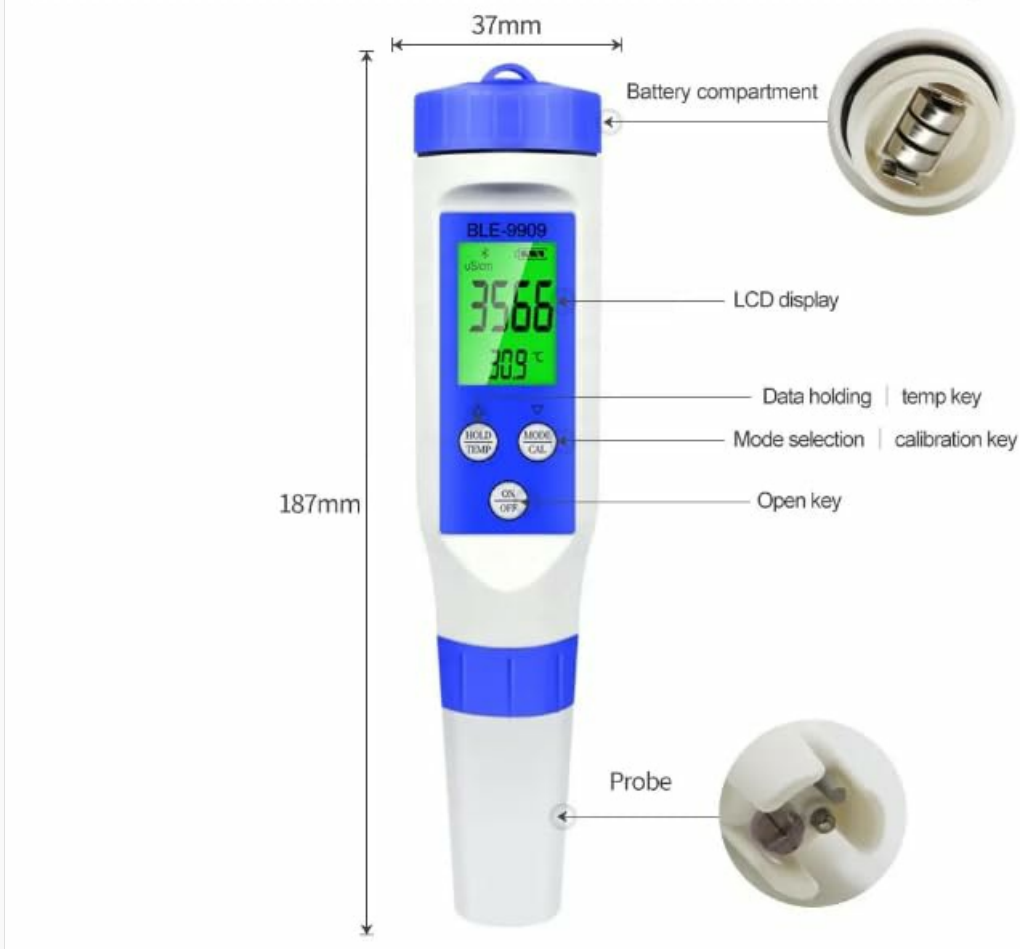
Figure 2: Labeled diagram of the BLE-9909 PH Meter, showing its dimensions and main parts.