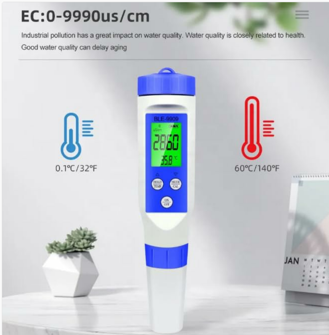
Figure 4: Visual representation of EC and Temperature measurement ranges.