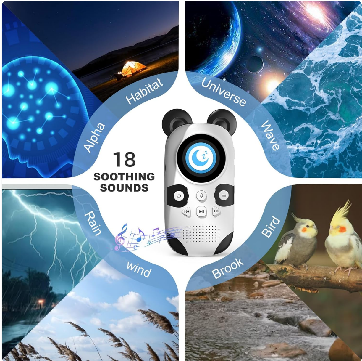
Figure 5: The ODEJOI X30 MP3 Player includes 18 soothing sounds, such as rain, wind, brook, and bird songs, designed to promote relaxation and better sleep.

Select the 'Sleep Music' or 'White Noise' option from the main menu to access 18 built-in soothing sounds. These sounds are designed to aid relaxation and sleep.