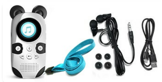
Figure 1: Contents of the ODEJOI X30 MP3 Player box. Includes the panda-themed MP3 player, a USB-C charging and data transfer cable, a blue lanyard, and the user manual.