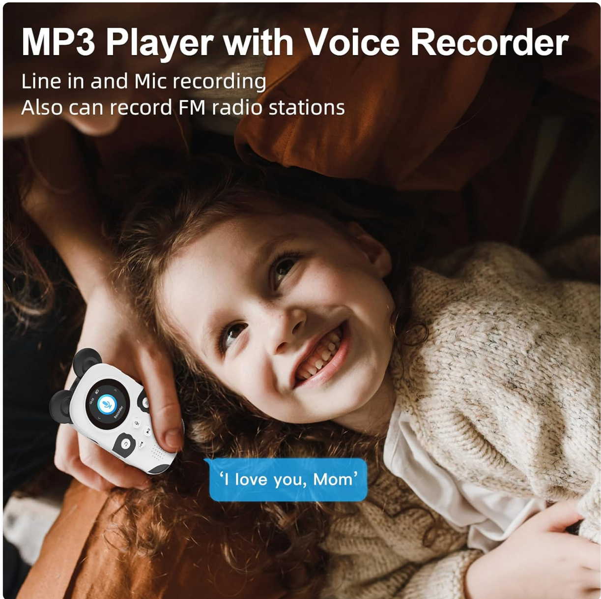
Figure 6: The ODEJOI X30 MP3 Player features a voice recorder function, capable of line-in and microphone recording, including FM radio stations.

Line in and Mic recording Also can record FM radio stations