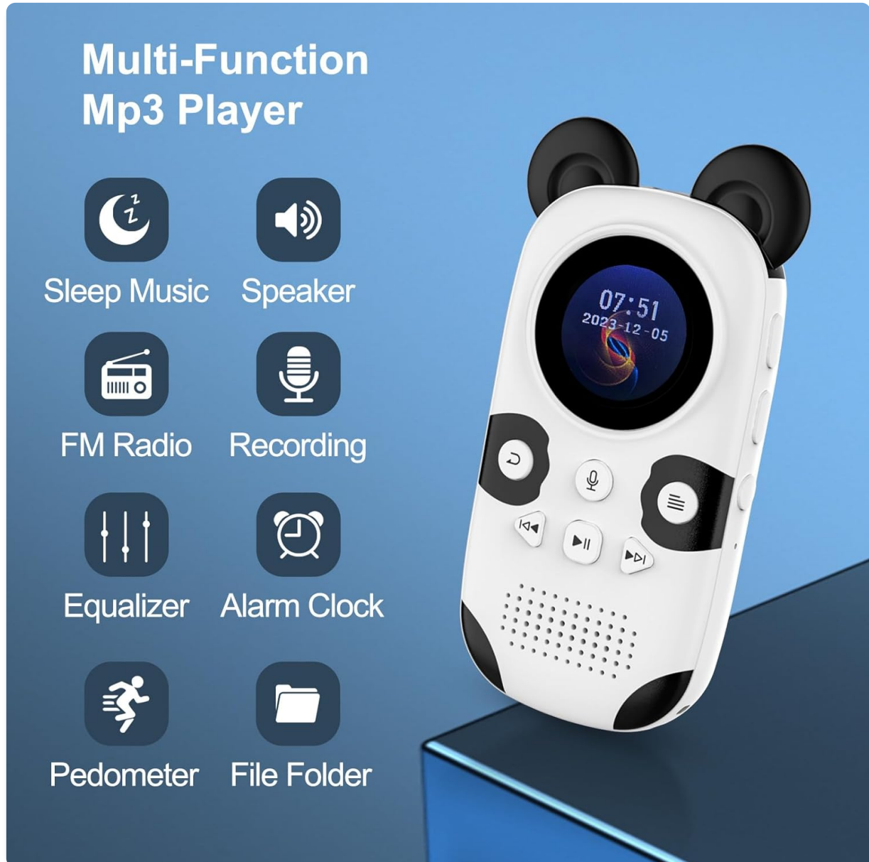
Figure 2: The ODEJOI X30 MP3 Player offers multiple functions such as sleep music, a built-in speaker, FM radio, voice recording, an equalizer, alarm clock, pedometer, and file management.