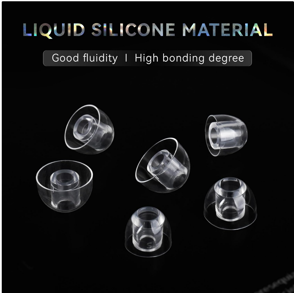
Image: Close-up of KBEAR KT01 ear tips highlighting the liquid silicone material and its properties of good fluidity and high bonding degree.