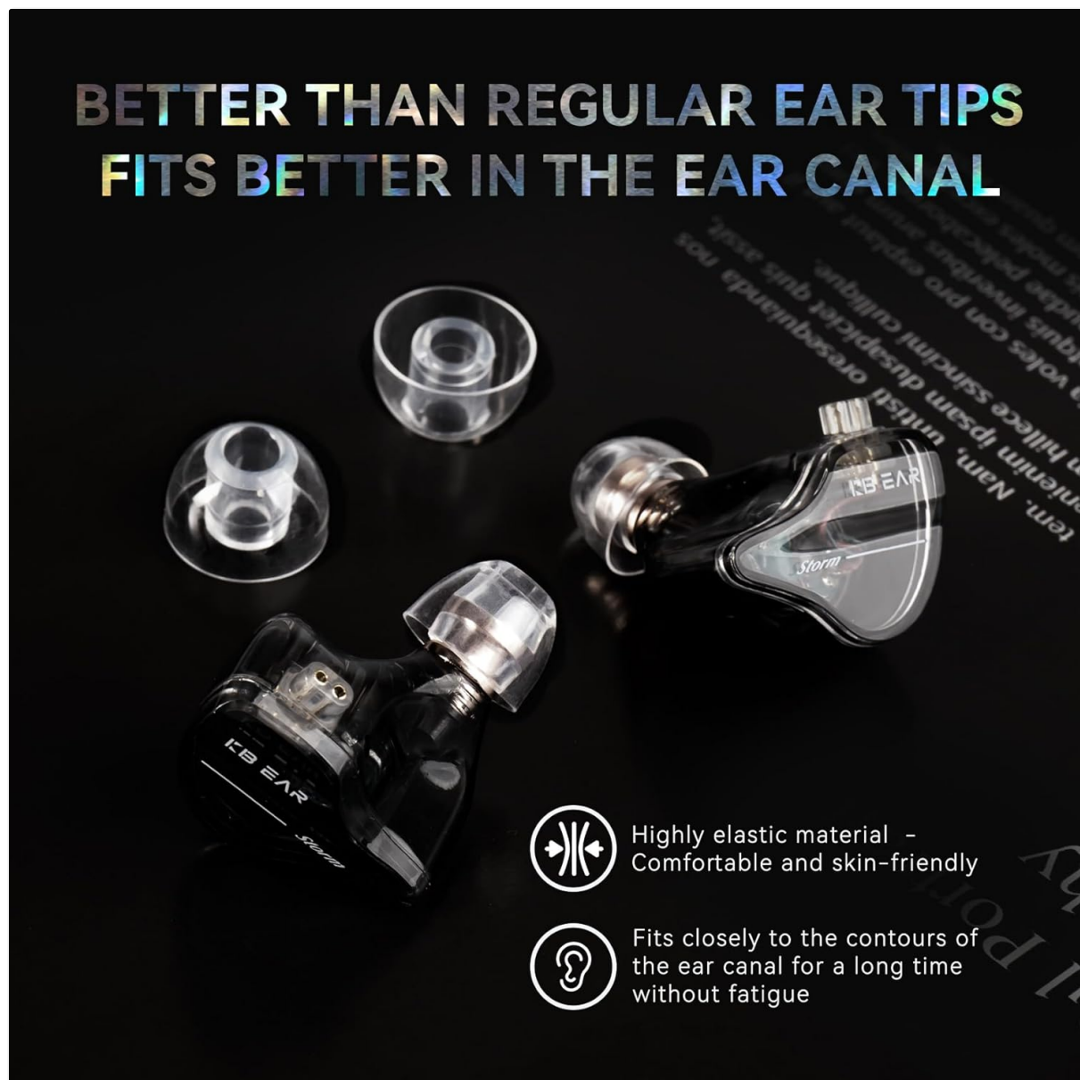
Image: KBEAR KT01 ear tips shown alongside an earphone, illustrating how they fit onto the earphone nozzle for a secure and comfortable fit.

Push the ear tip onto the nozzle, twisting gently until it is fully seated and secure. Ensure the ear tip is not loose and does not easily come off.