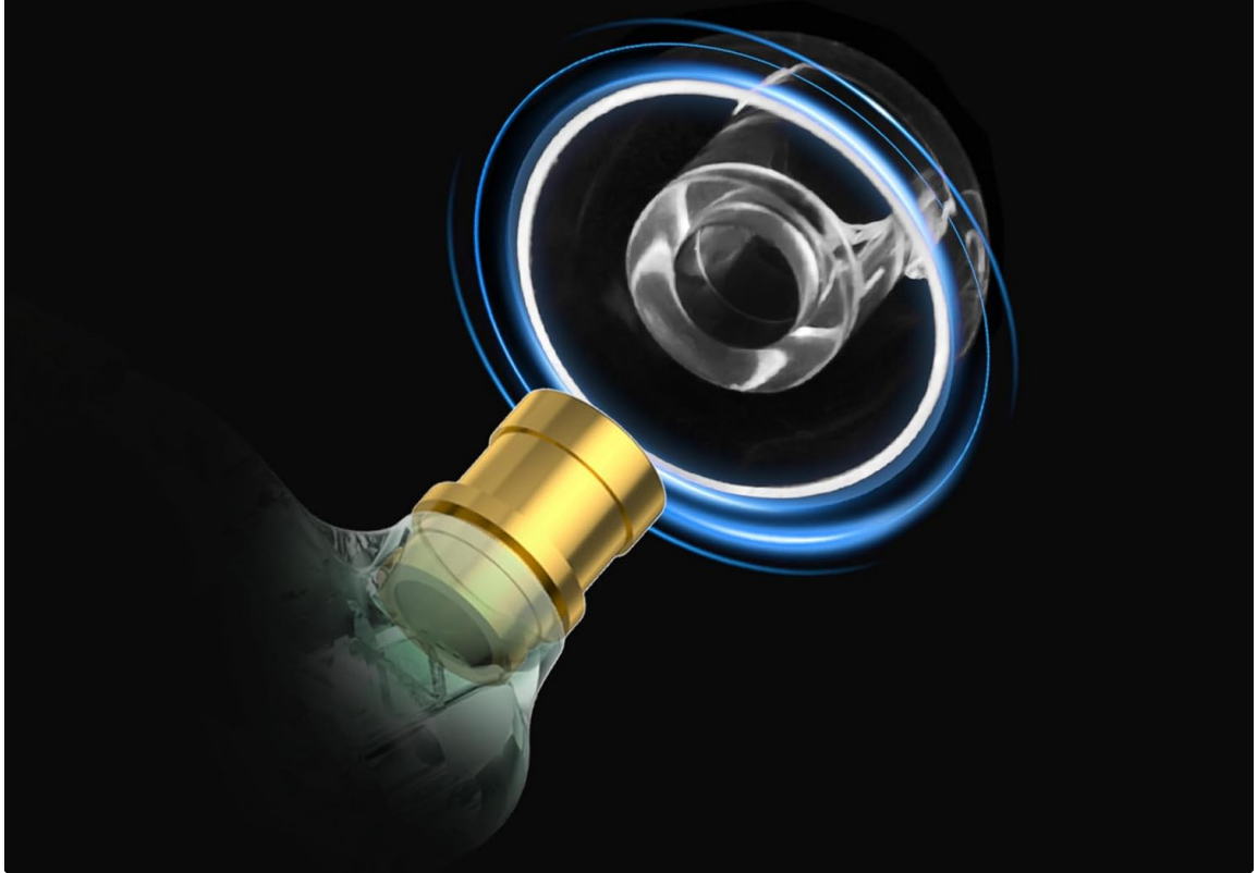
Image: A diagram illustrating how the KBEAR KT01 ear tips contribute to clearer sound layers and a cleaner soundstage by increasing the diameter of the inner sound hole.

More transparent and clearer sound by increasing the diameter of the inner sound hole