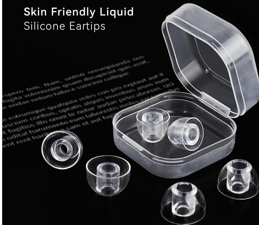
Image: KBEAR KT01 liquid silicone ear tips displayed with their transparent storage case, emphasizing their skin-friendly material.