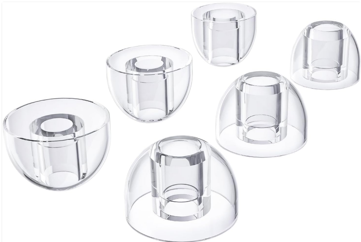
Image: A set of KBEAR KT01 liquid silicone earbud tips in small, medium, and large sizes, showcasing their transparent design.

The EZ EAR KBEAR KT01 replacement ear tips are designed to enhance your listening experience with wireless and wired earphones. Crafted from liquid silicone, these eartips offer a secure fit, supreme comfort, and effective ambient noise blocking. This manual provides instructions for proper installation, usage, and maintenance to ensure optimal performance.